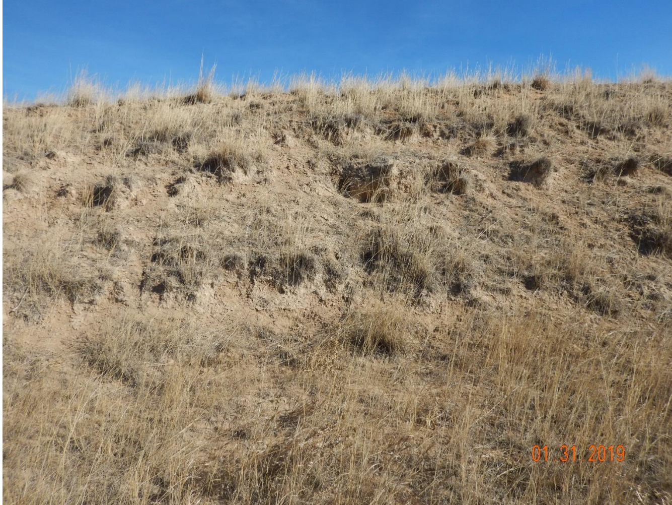
Photo 8: Photo taken from the soil stockpile on the northwest end of the location. Photo shows stormwater erosion degradation along slopes of soil stockpile.