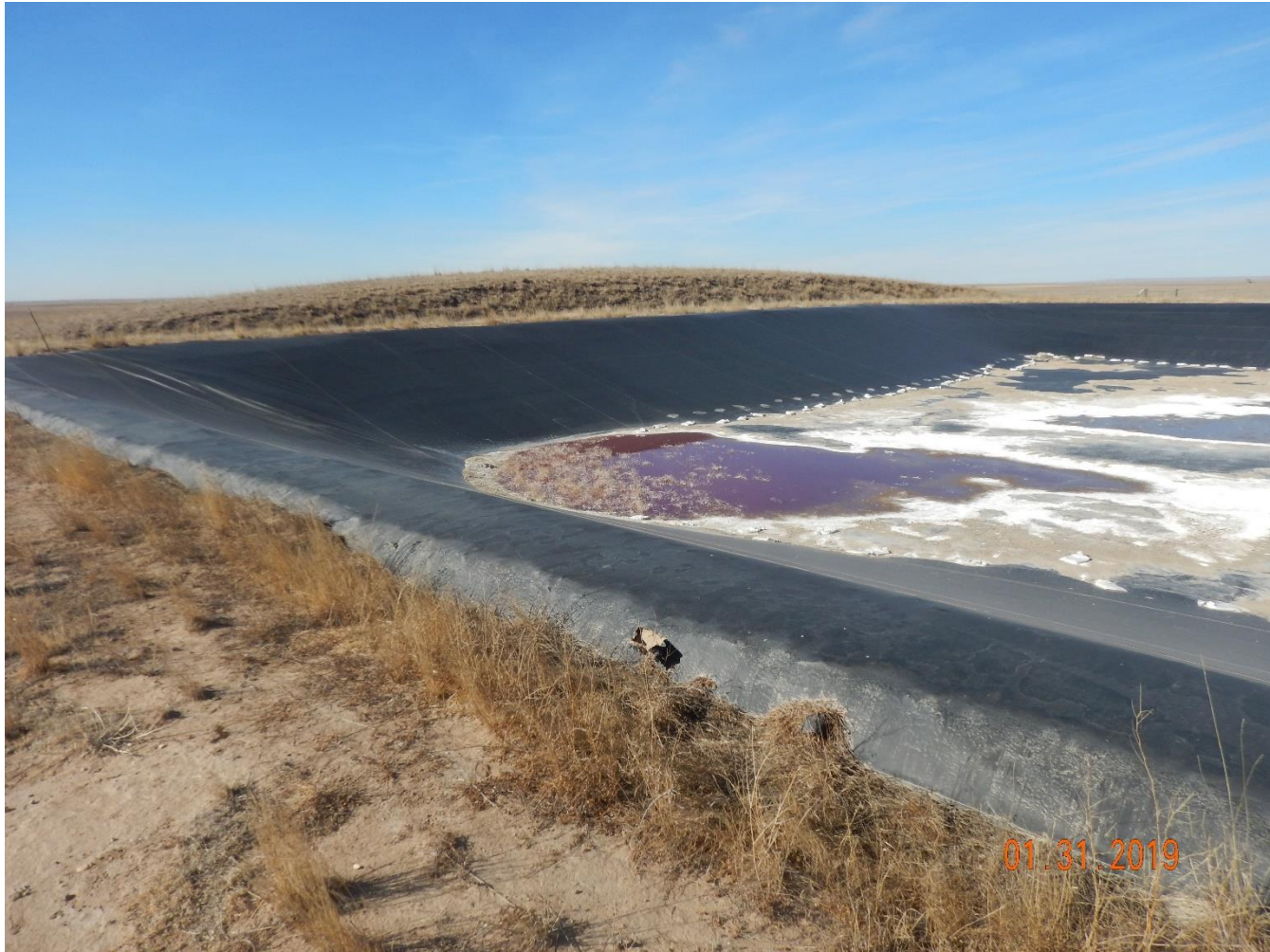
Photo 7: Photo taken from the south end of the pit #430101, facing northwest. See comments under photo 6.