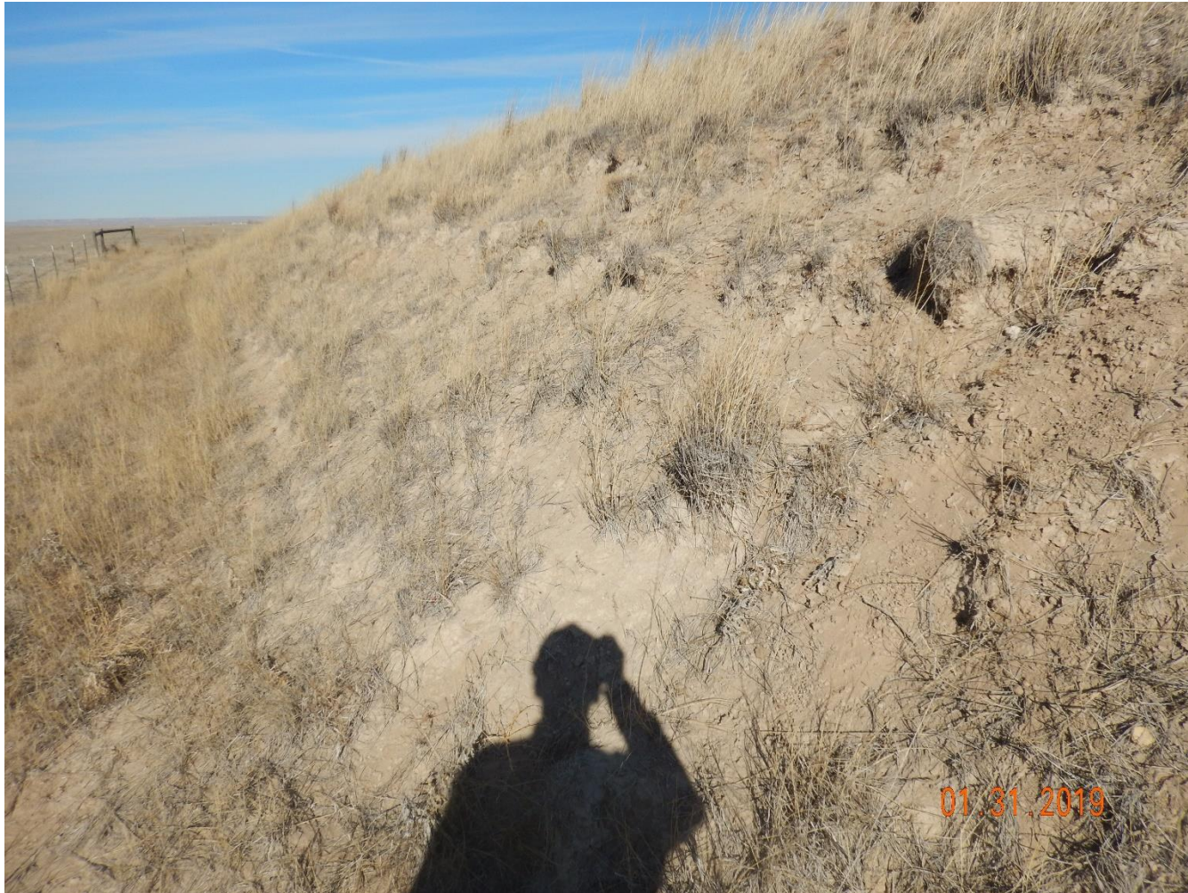
Photo 9: Photo taken from the soil stockpile on the northwest end of the location, facing north. Photo shows stormwater erosion degradation along slopes of soil stockpile.