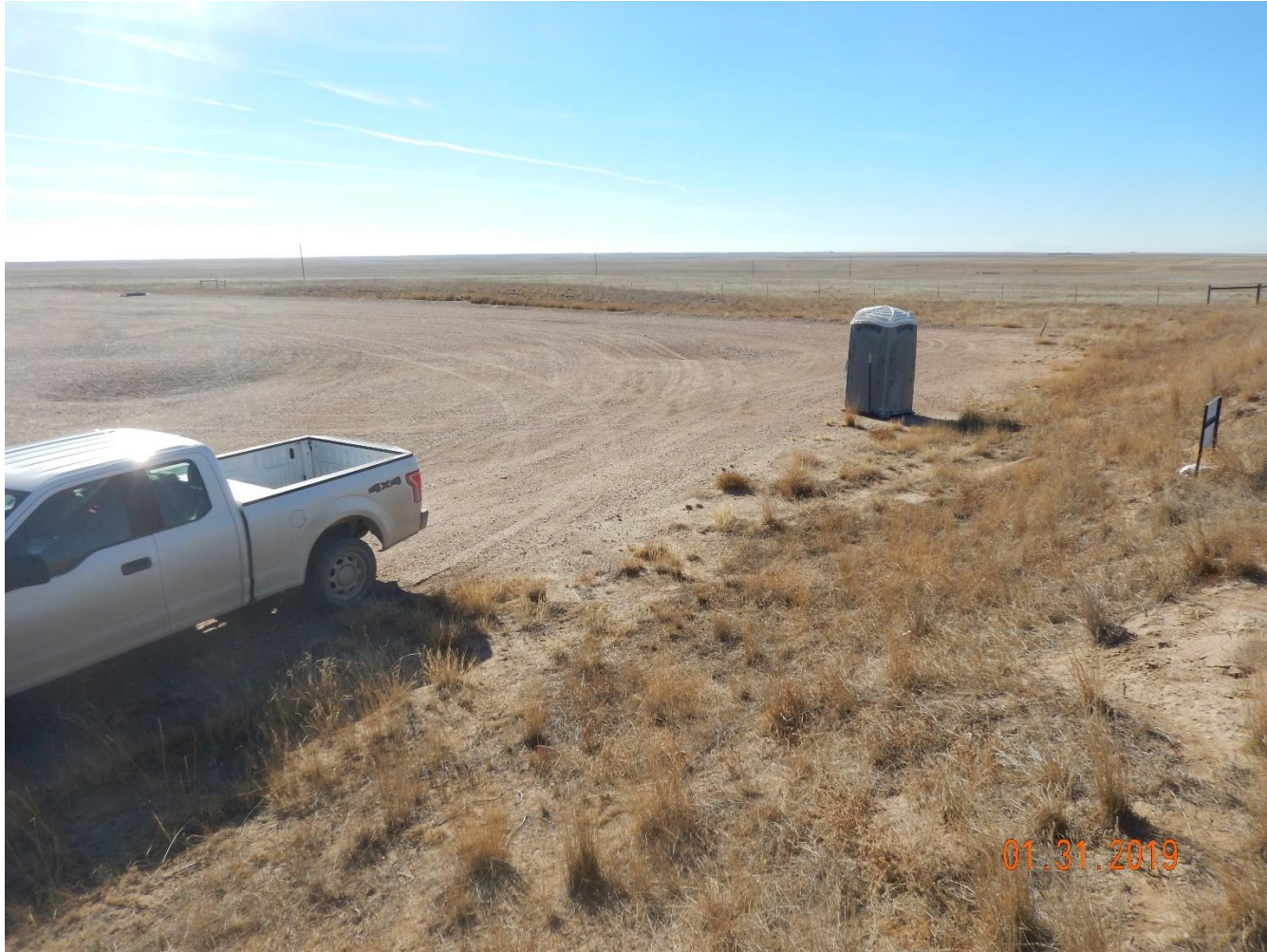
Photo 2: Photo taken from the north end of the pad, facing southwest. Photos 2-5 provides an overview of the location from west, southwest, southeast, to east. Photos also show interim reclamation has not been conducted in accordance with COGCC rule 1003.