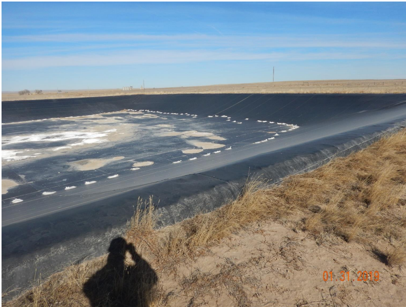
Photo 6: Photo taken from the south end of the pit #430101, facing northeast. Location received an approved 502.b variance to delay interim reclamation of the location for three (3) years until 12/03/2018. Photos 6-7 shows pit has not been closed/reclaimed.