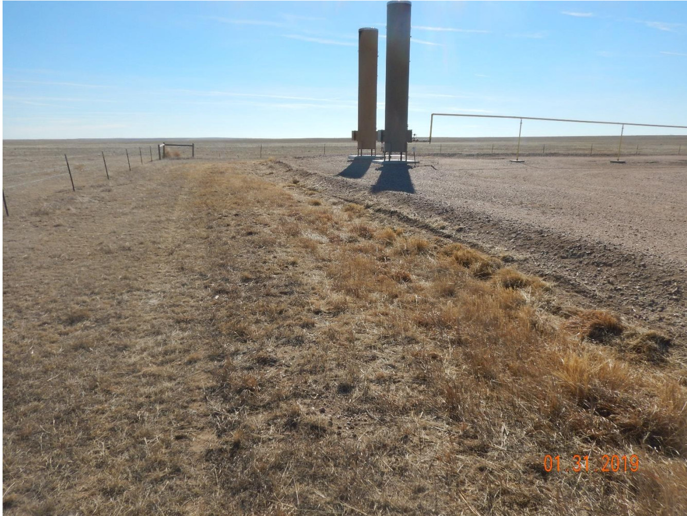
Photo 2: Photo taken from the east end of the location, facing south. Photos 2-5 provides an overview of the location from south, southwest, northwest to north. Photos also show interim reclamation has not been conducted in accordance with COGCC rule 1003.