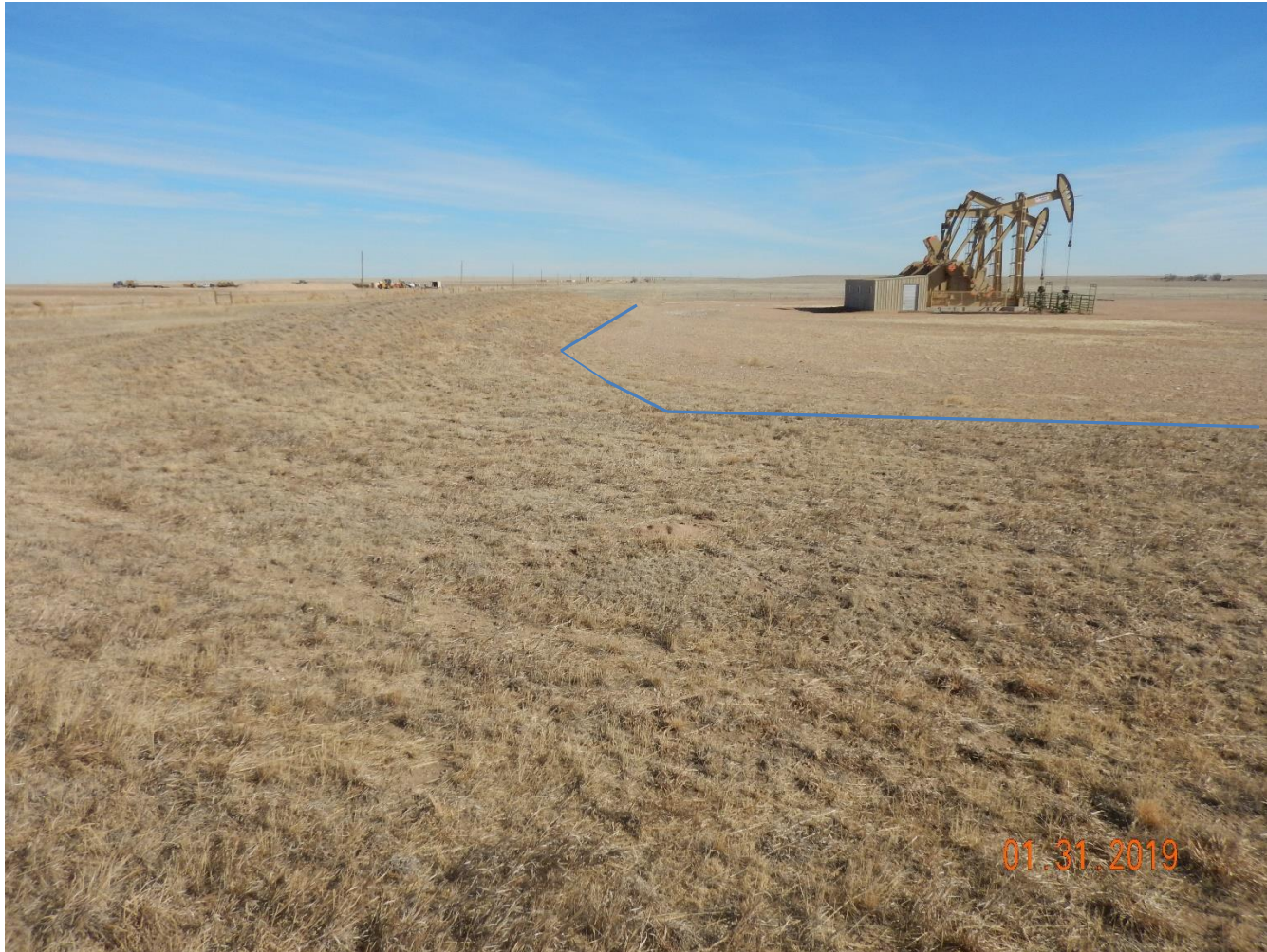
Photo 6: Photo taken from the west end of the location, facing east. Photo shows interim reclamation has not been conducted in accordance with COGCC rule 1003. Blue line shows pad perimeter.