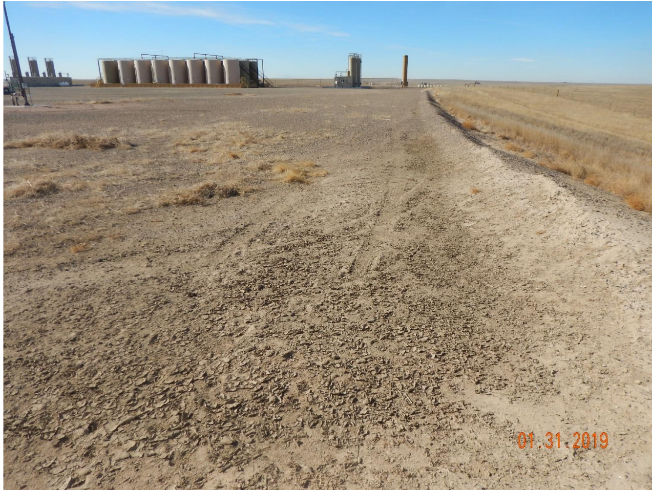
Photo 7: Photo taken from the northeast corner of the location, facing west. Photo shows interim reclamation has not been conducted in accordance with COGCC rule 1003