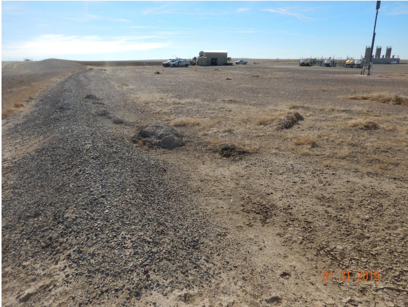
Photo 6: Photo taken from the northeast corner of the location, facing south. Photo shows interim reclamation has not been conducted in accordance with COGCC rule 1003