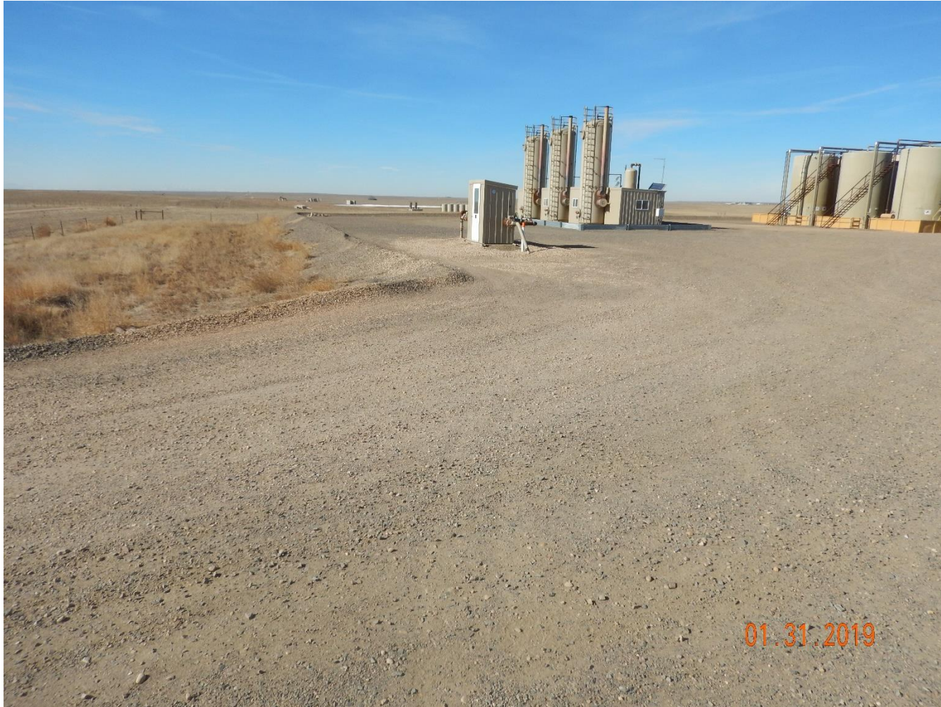
Photo 2: Photo taken from the south end of the location, facing west. Photos 2- 5 provide and overview of the location from west, northwest, northeast to east. Photos also show interim reclamation has not been conducted in accordance with COGCC rule 1003.