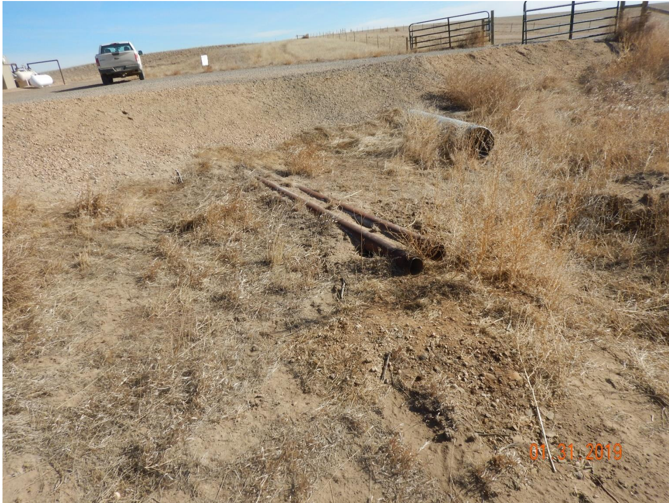
Photo 8: Photo taken from the south end of the location, facing east. Photo shows two pieces of pipe equipment stored off of the location.