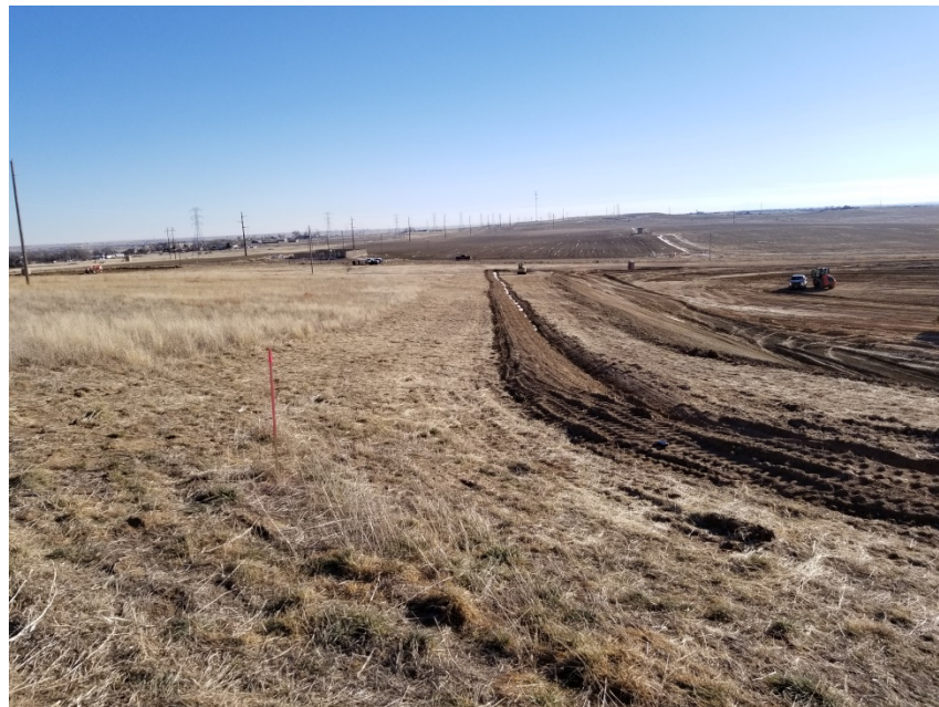
Photo 6. Photo taken from northeastern perimeter of the location, facing South. See comments from Photo 1.