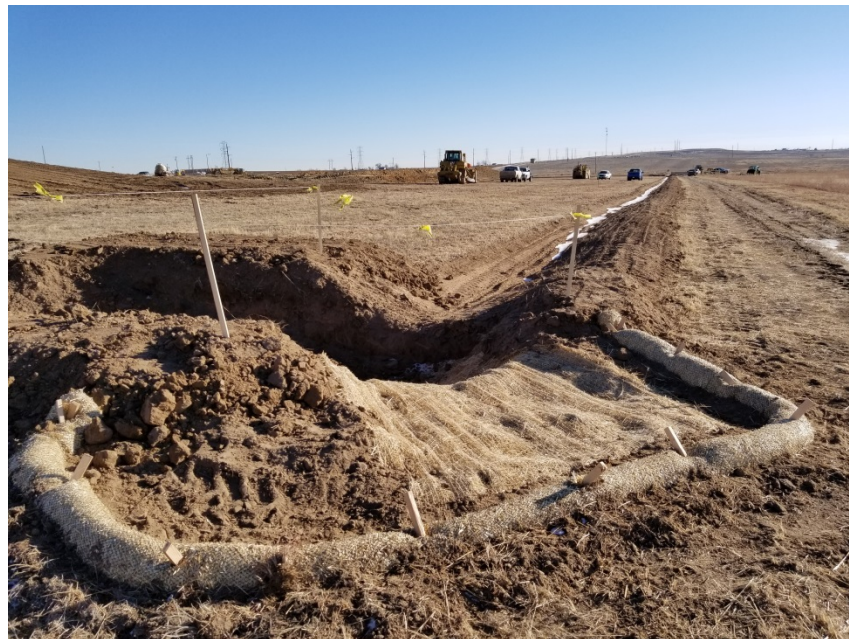
Photo 8. Photo taken from northwestern perimeter of the location, facing East. See comments from Photo 1.