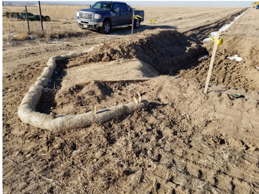
Photo 2. Photo taken from the southwestern location, facing North. See comments from Photo 1.