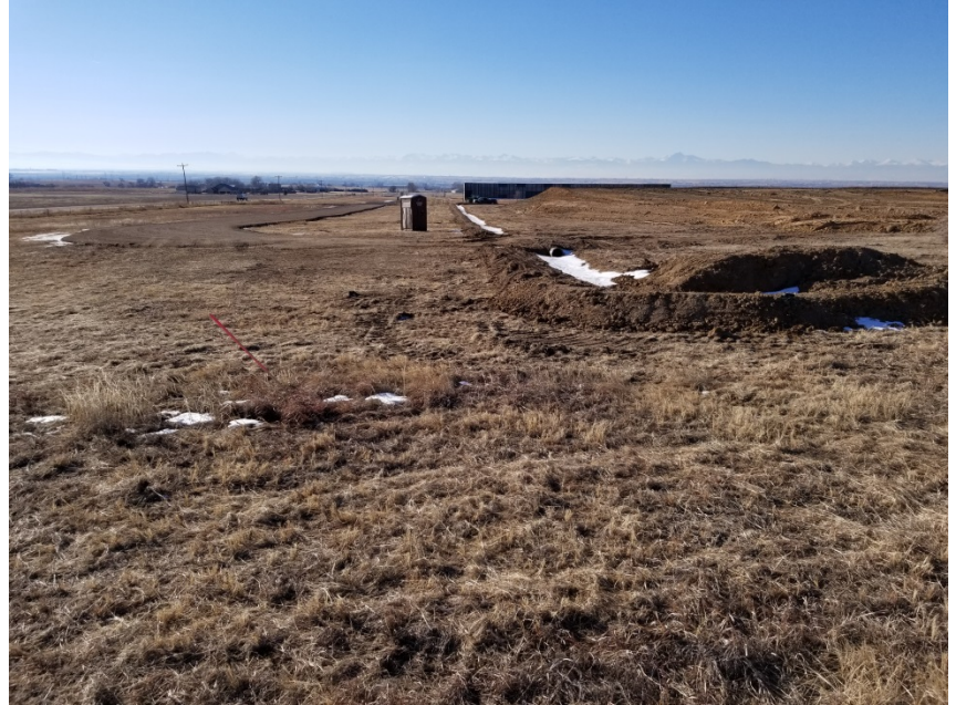
Photo 4. Photo taken from southeastern perimeter of the location, facing West. See comments from Photo 1.