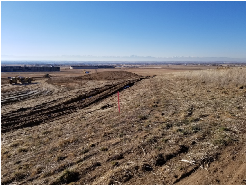
Photo 5. Photo taken from northeastern perimeter of the location, facing West. See comments from Photo 1.