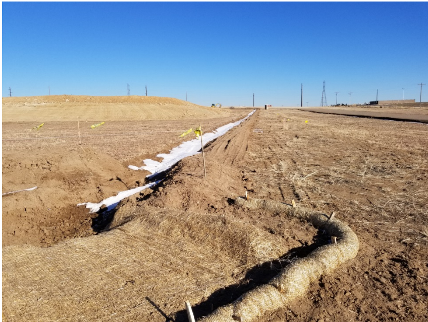
Photo 1. Photo taken from the southwestern location, facing East. Operator has installed a sediment trap with a temporarily stabilized outlet. A ditch and berm BMP has been installed around the perimeter of the location. BMPs in proper functioning condition at the time of this inspection.