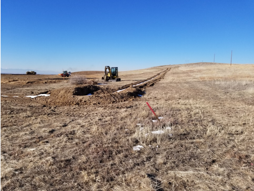
Photo 3. Photo taken from southeastern perimeter of the location, facing North. See comments from Photo 1.