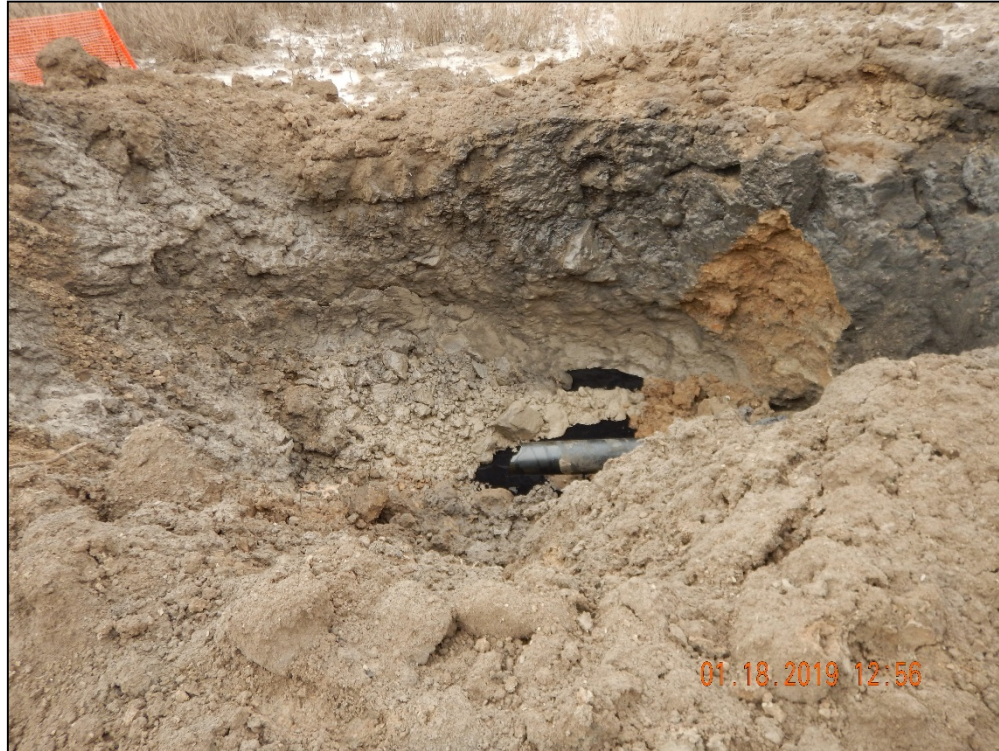
16" COPUC Gas Gathering Pipeline ruptured