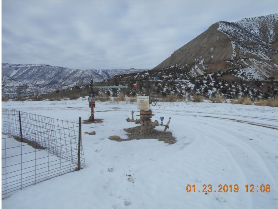
Wellhead with sign.

TEP ROCKY MOUNTAIN LLC - 96850 API # 05-045-14693 Williams #GM 239-36 Inspection Date : 1/23/2019