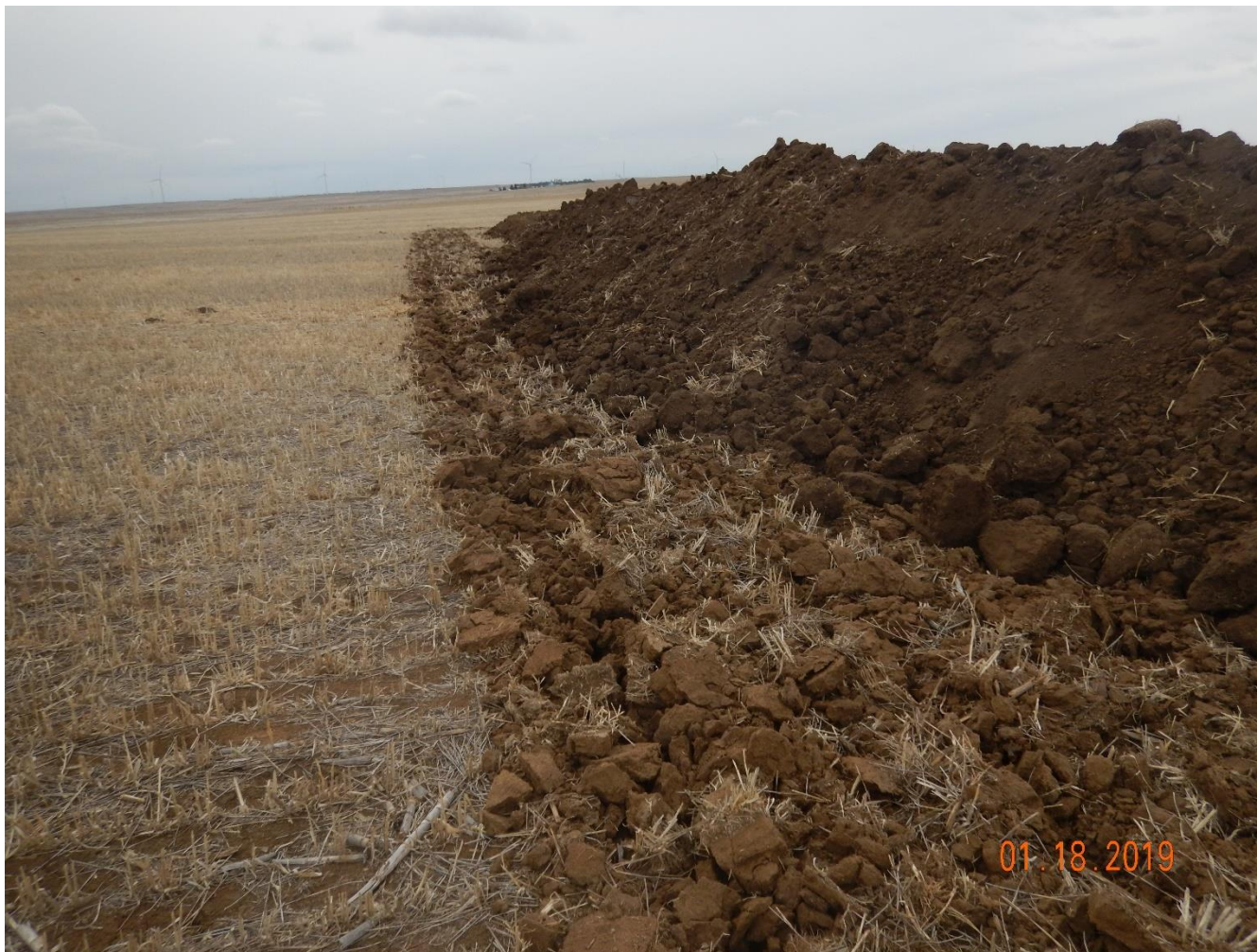
Photo 6: Photo taken from the east end of the disturbance area. Photo shows area where topsoil has been pushed onto the perimeter stormwater BMP. Advise maintenance to ensure BMP remains in proper functioning condition.