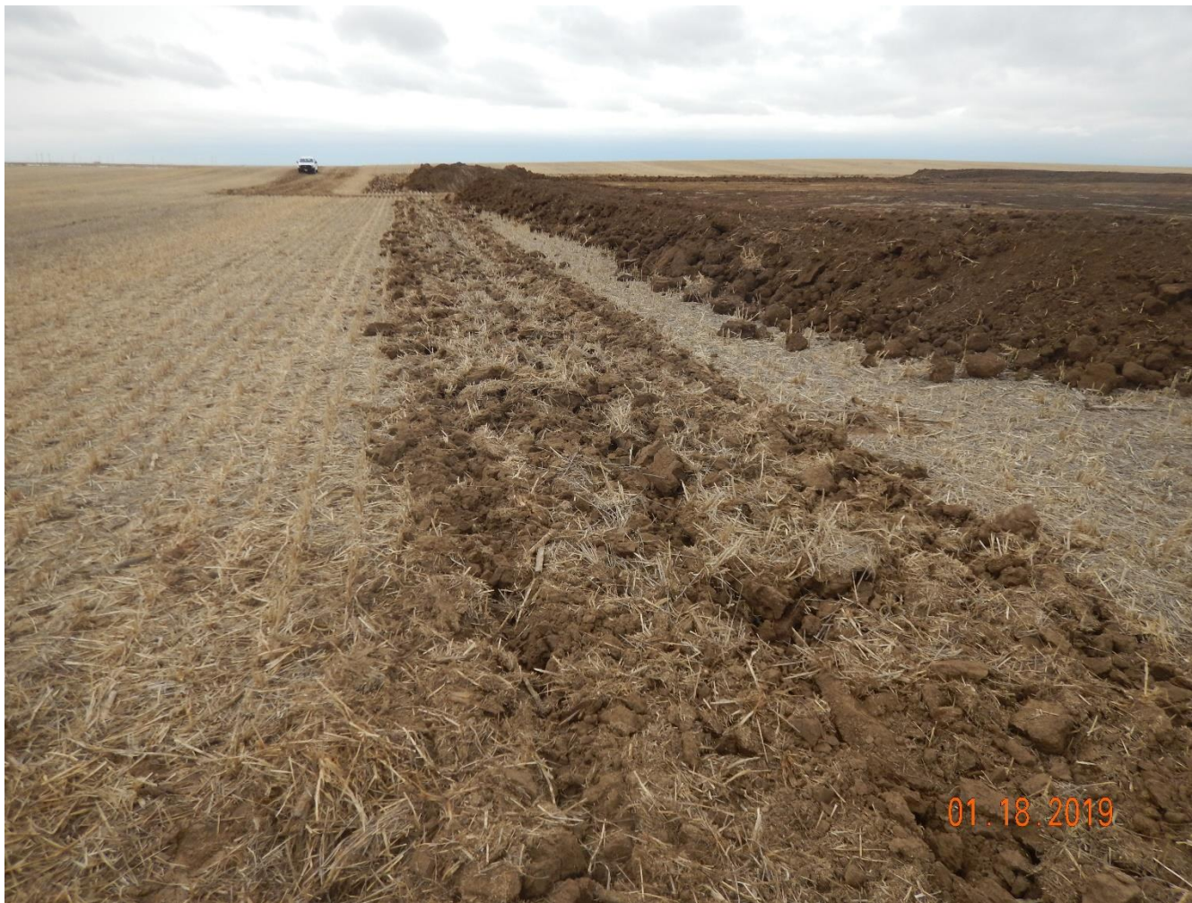
Photo 4: Photo taken from the southeast corner of the disturbance area, facing west. See comments under photo 2.