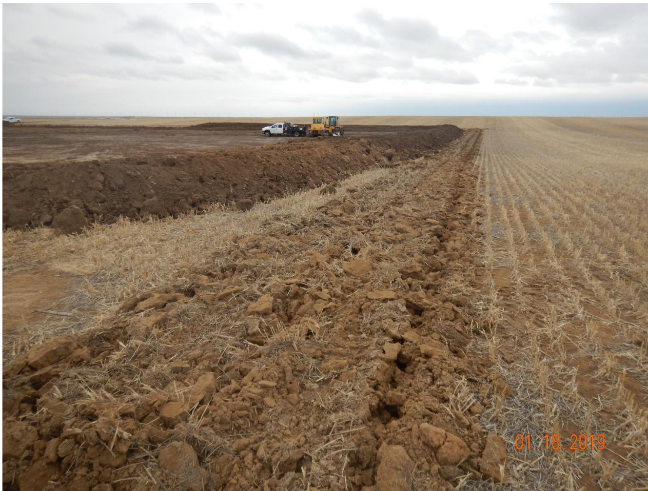
Photo 8: Photo taken from the northeast corner of the disturbance area, facing west. See comments under photo 2.