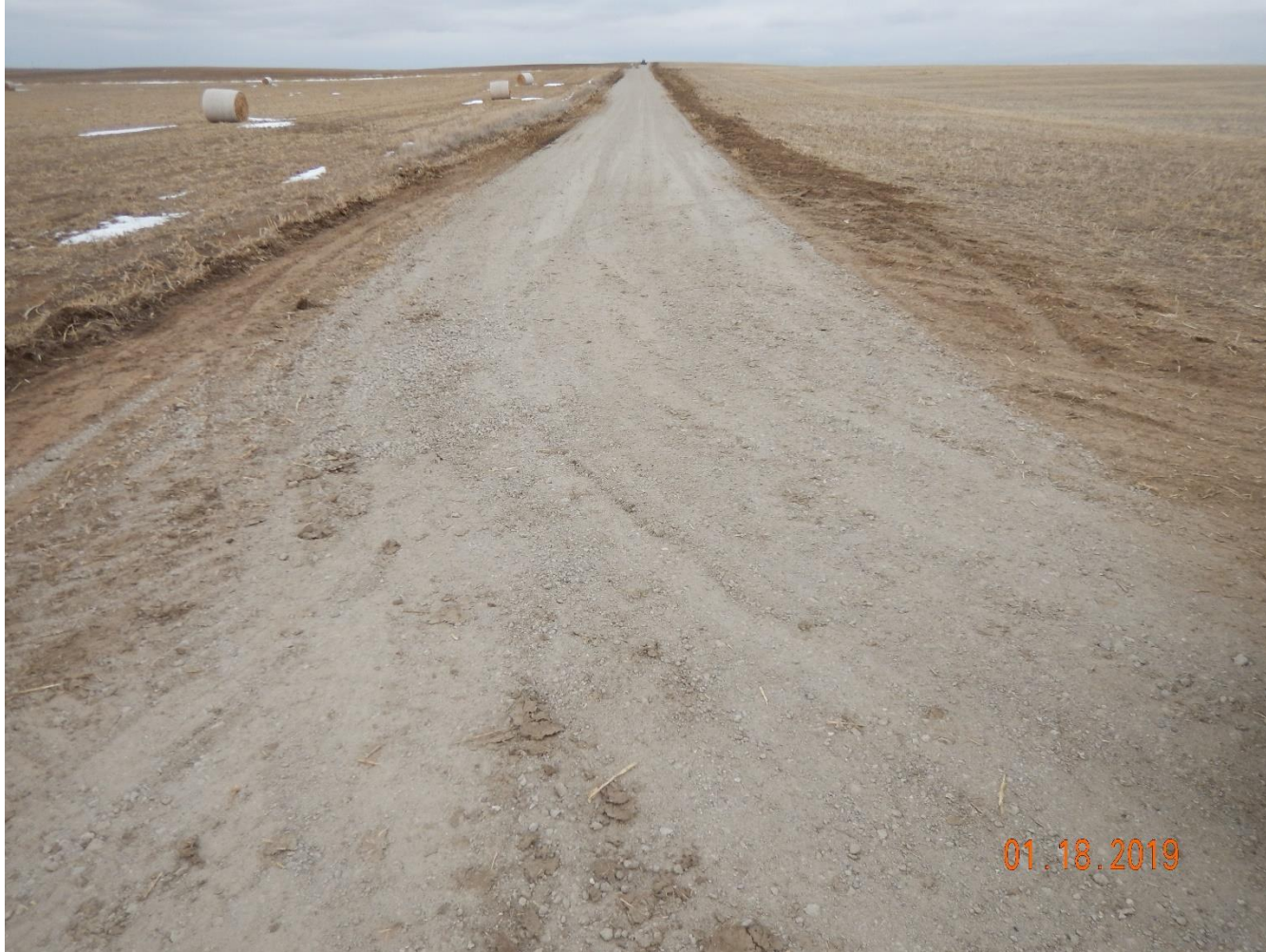
Photo 14: Photo taken from the west of the location. Photo shows the pre-existing farm road. Operator has placed road base on access road for stabilization.