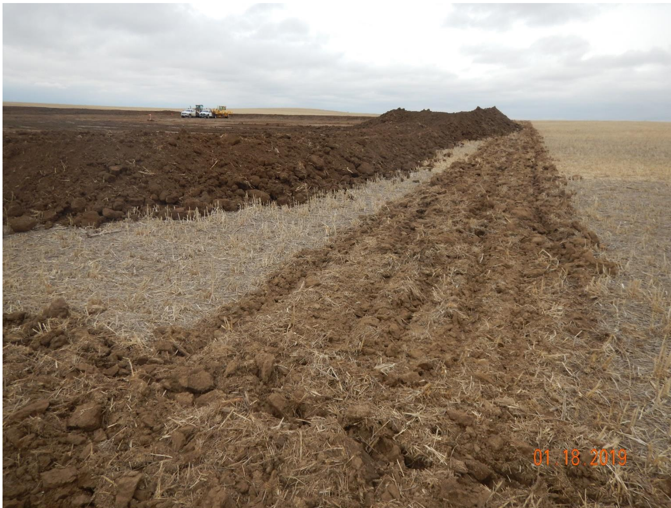
Photo 5: Photo taken from the southeast corner of the disturbance area, facing north. See comments under photo 2.