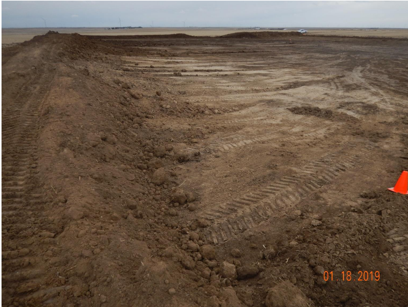
Photo 9: Photo taken from the northeast corner of the current pad, facing south. Photo shows sufficient soil salvage and segregation appears to be being conducted.