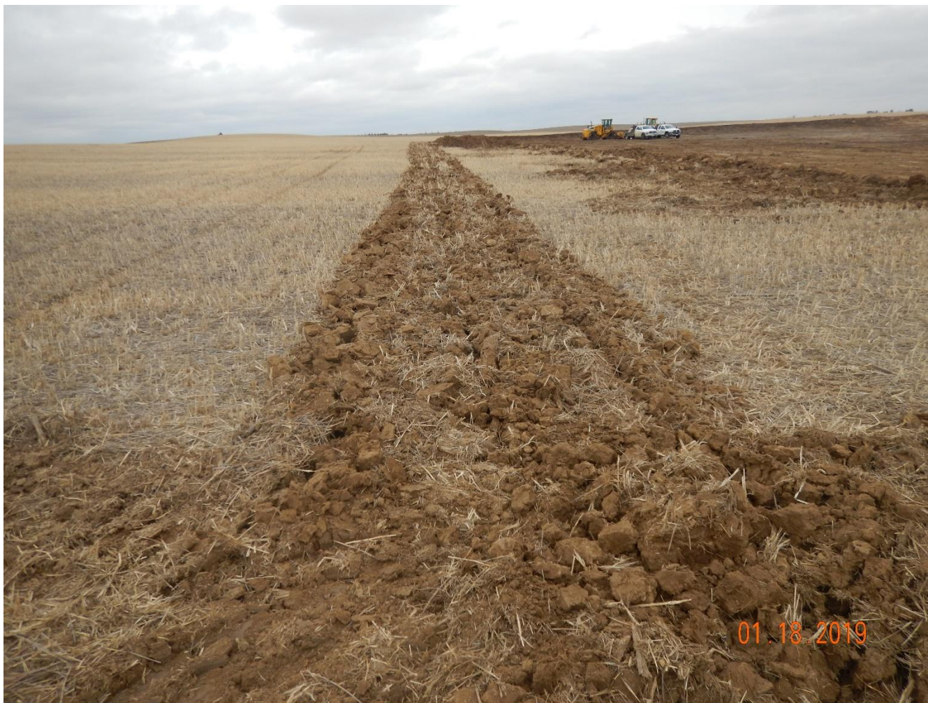
Photo 2: Photo taken from the southwest corner of the disturbance area, facing north. Photo shows operator has installed surface roughening (ripping) as a stormwater control BMP along the perimeter of the pad. BMP appears to have been installed in accordance with good engineering practices prior to and/or during construction activities, and in proper functioning condition.