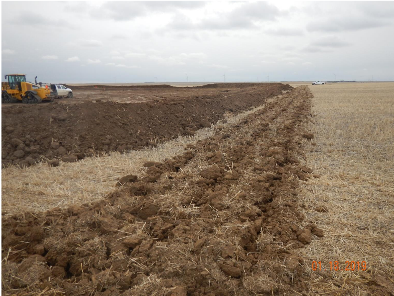
Photo 12: Photo taken from the northwest corner of the disturbance area, facing south. See comments under photo 2.