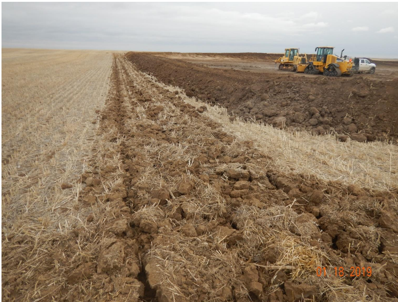
Photo 11: Photo taken from the northwest corner of the disturbance area, facing east. See comments under photo 2.