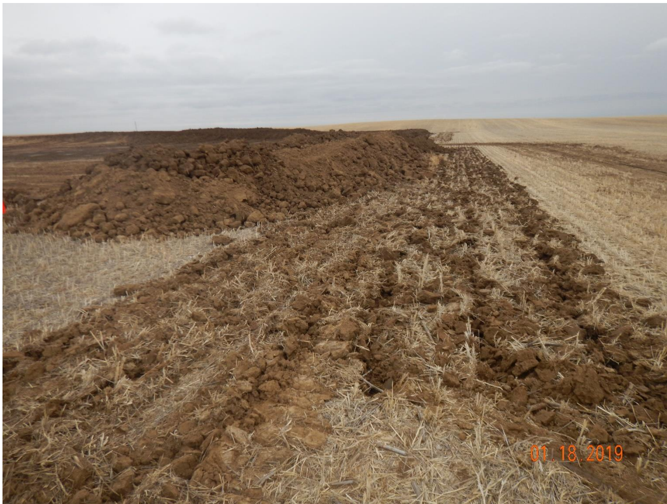
Photo 3: Photo taken from the southwest corner of the disturbance area, facing east. See comments under photo 2.