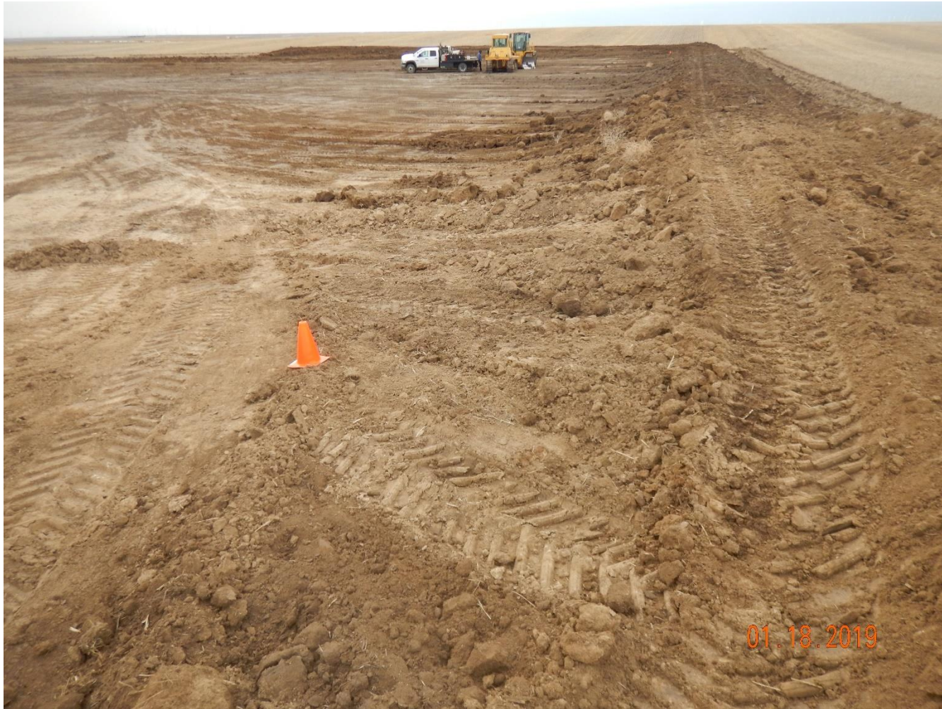
Photo 10: Photo taken from the northeast corner of the current pad, facing west. Photo shows sufficient soil salvage and segregation appears to be being conducted.