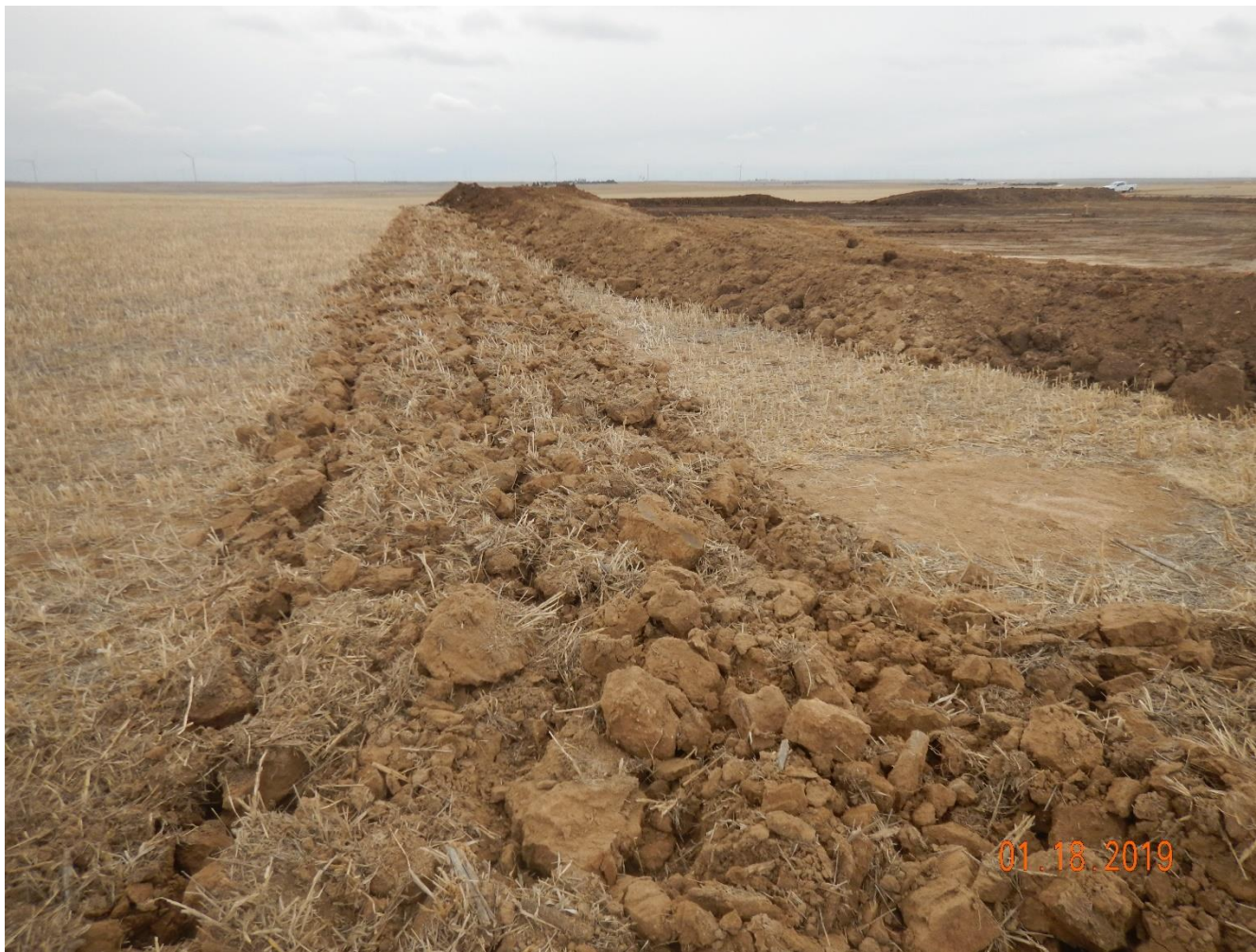
Photo 7: Photo taken from the northeast corner of the disturbance area, facing south. See comments under photo 2.