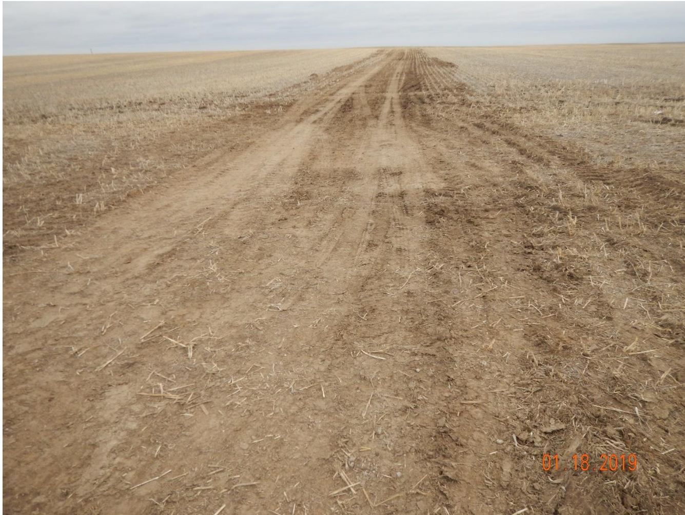
Photo 13: Photo taken from the south end of the location, facing west. Photo shows the east/west access road.