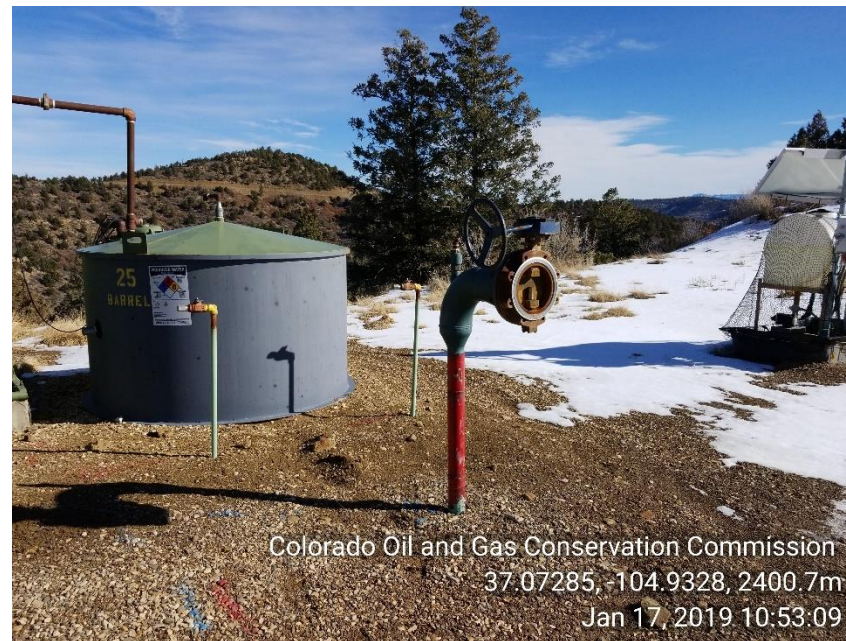
Photo 8 Unused, unmarked and not LOTO risers