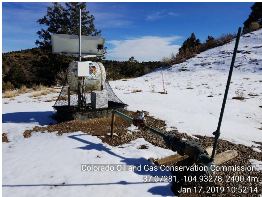
Photo 7 Unused equipment Methanol tank. Unused, unmarked and not LOTO riser.