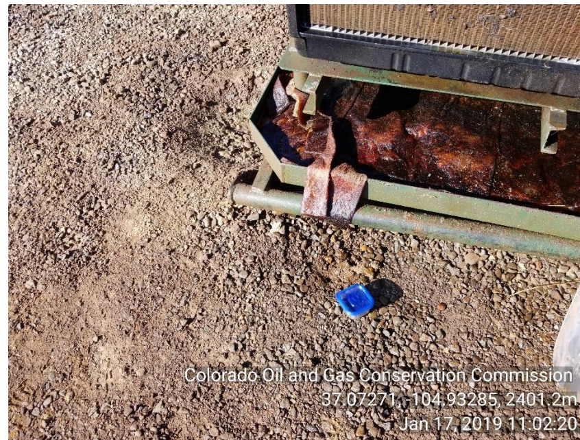
Photo 10 soil sample taken in front of radiator of liquid ring compressor.