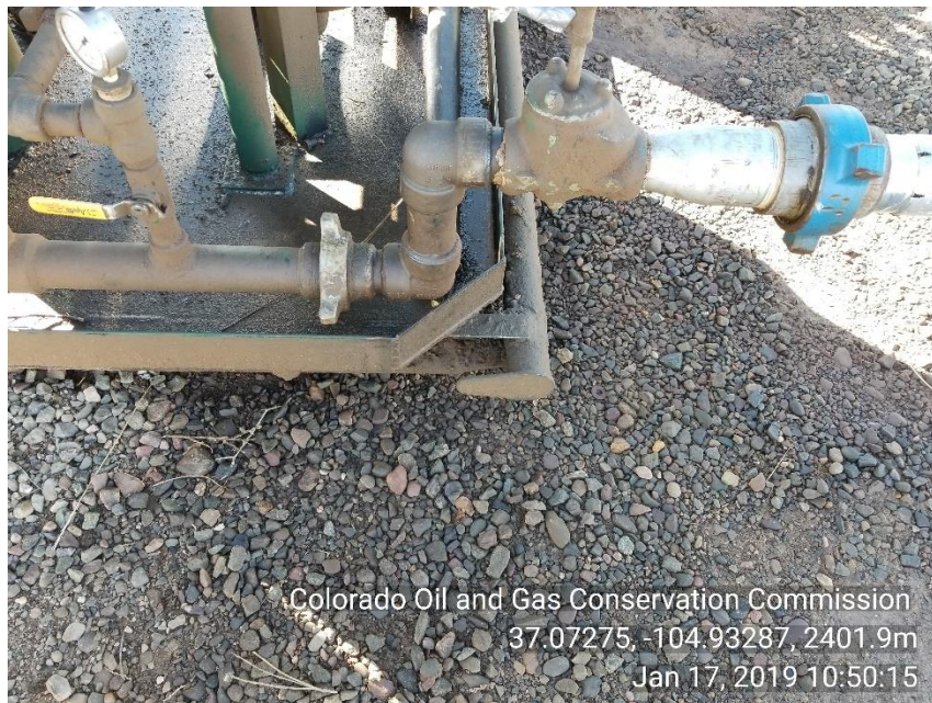
Photo 3 Stained soil around liquid ring compressor