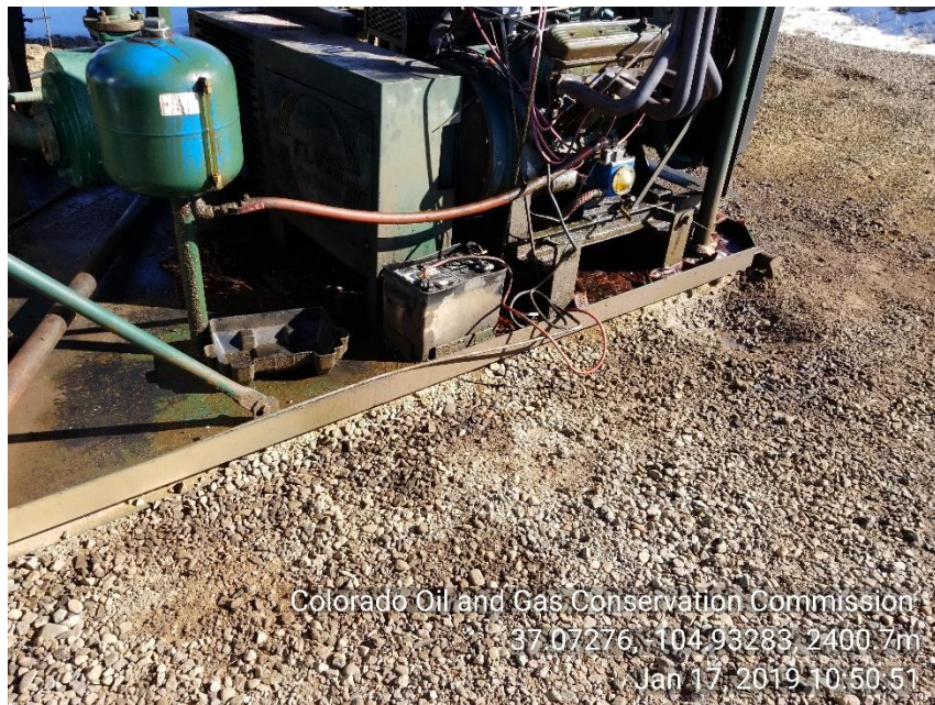
Photo 5 Stained soil around liquid ring compressor