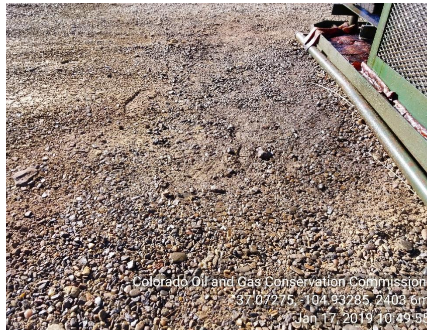
Photo 2 stained soil around liquid ring compressor