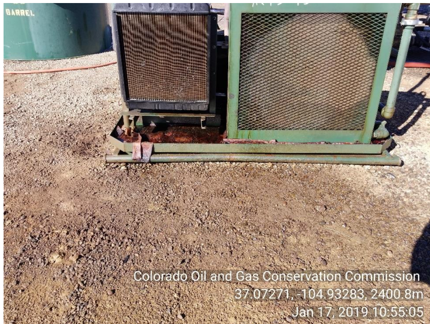
Photo 9 stained soil in front of liquid ring compressor