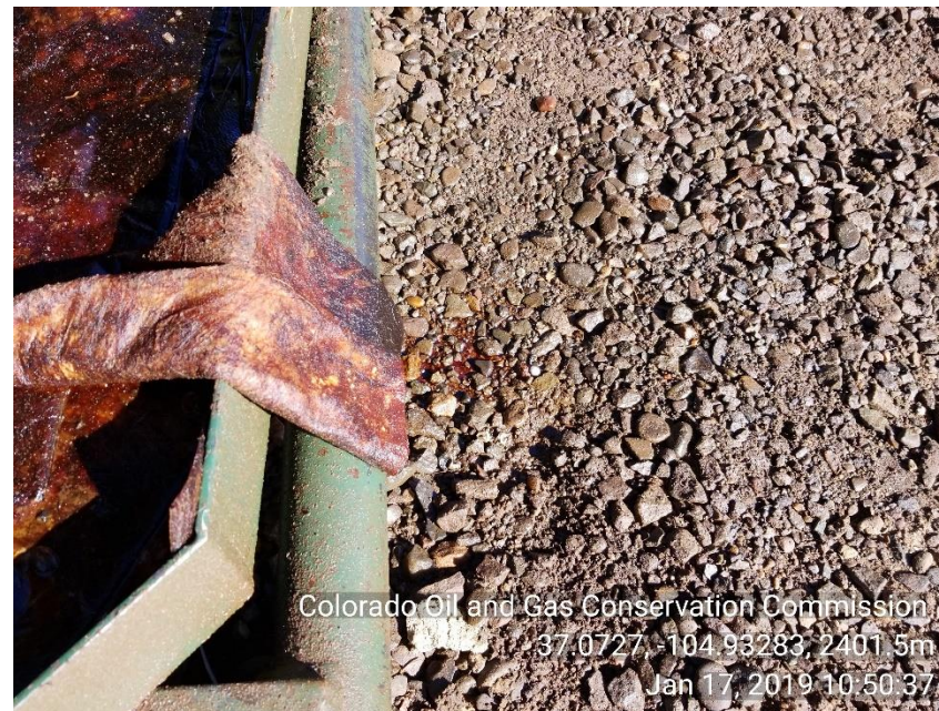
Photo 4 fluid leaking out of liquid ring skid via diaphr. Stained soil under diaphr.