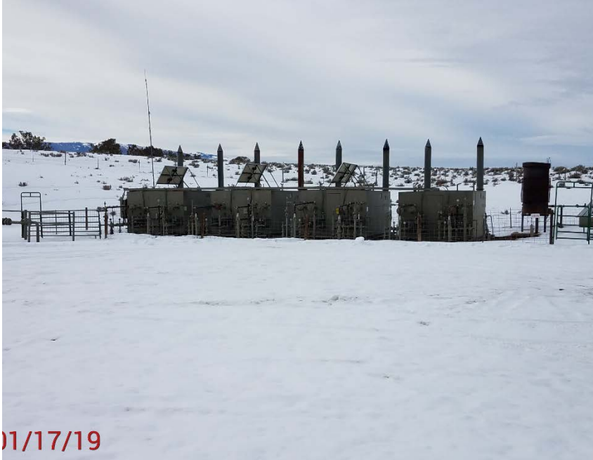
Location Photo #1