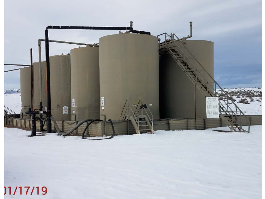
Location Photo #2