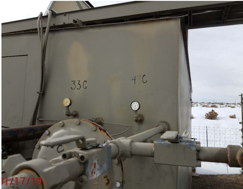
Location Photo #5