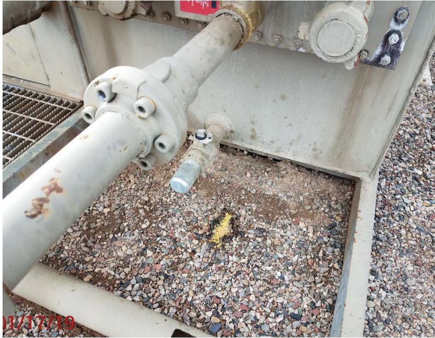
Location Photo #7, Oil spot below fitting on 43C.