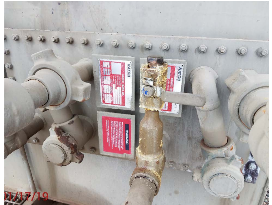
Location Photo #6, Dripping fitting.