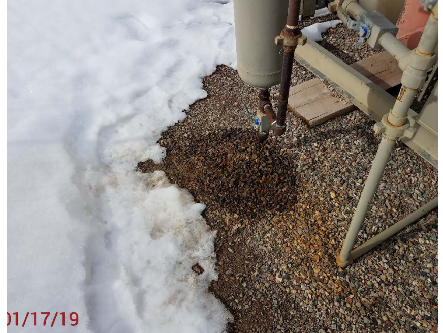
Location Photo #4, Stained ground under scrubber pot, on 34A.