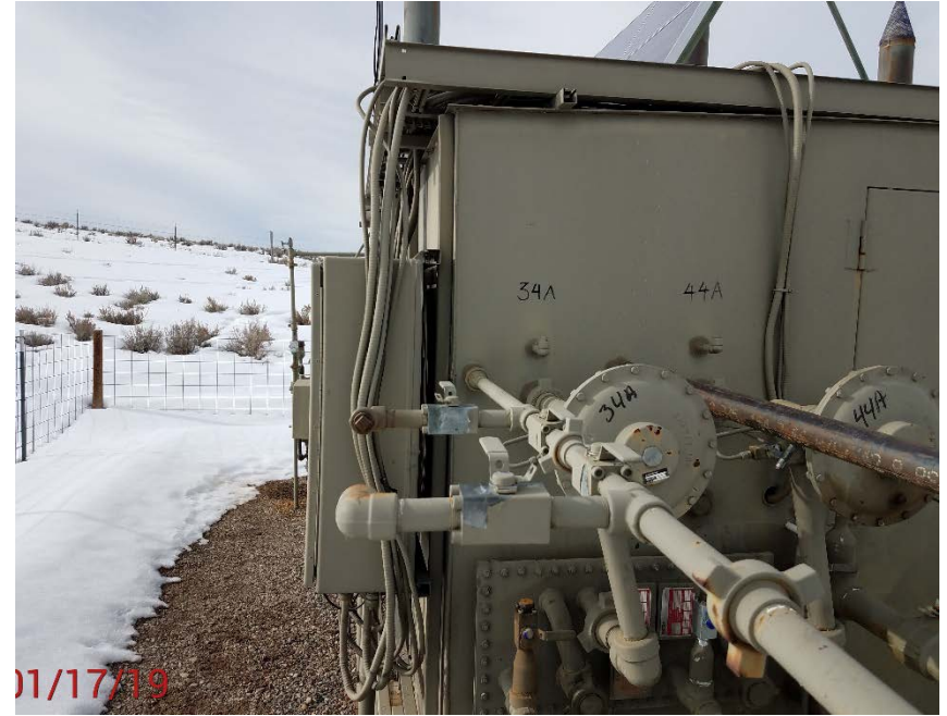
Location Photo #8