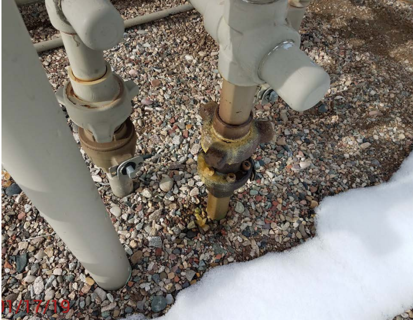
Location Photo #9, leaking hammer union on separator 34C.