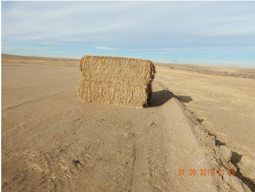
Photo 5. Photo taken from the northern production area, facing West. All locations shall be kept free of supplies not necessary for use on that lease per Rule 603.f.