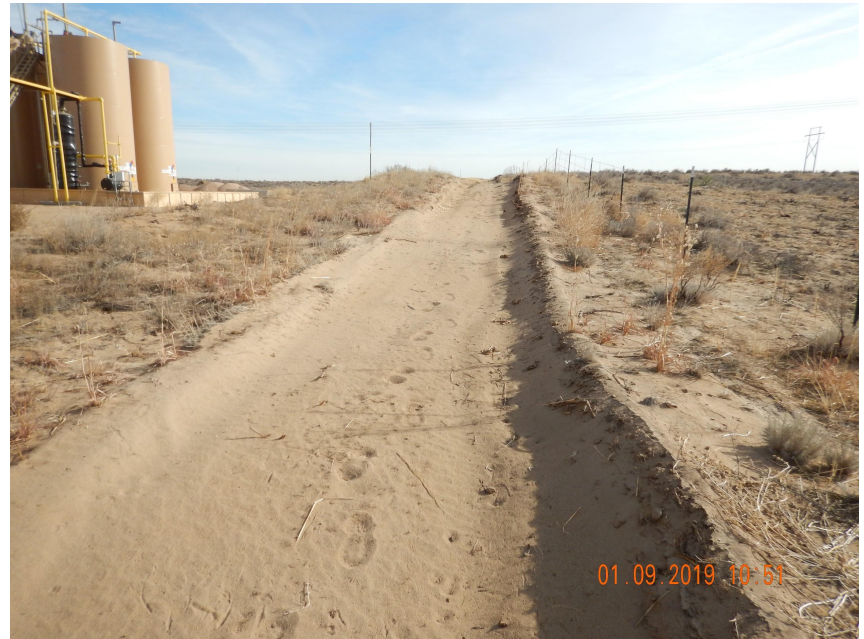
Photo 10. Photo taken from the southwestern perimeter of the location, facing East. See comments under Photo 9.