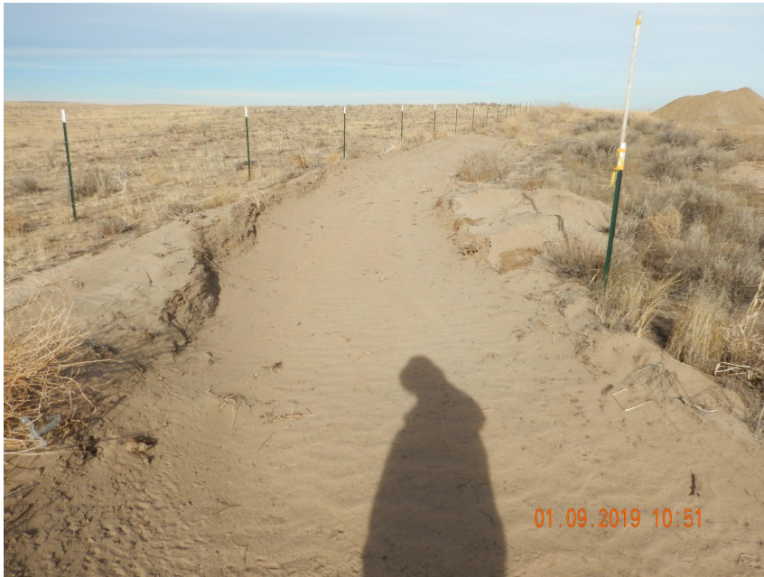
Photo 11. Photo taken from the southwestern perimeter of the location, facing North. See comments under Photo 9.