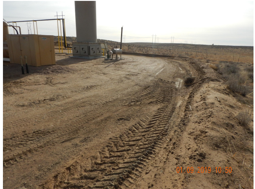
Photo 8. Photo taken from the southwestern production area, facing South. See comments under Photo 1.