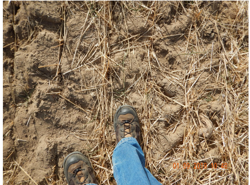
Photo 4. Close up photo taken from the northern interim reclamation area. Some germination was observed throughout portions of the interim area.