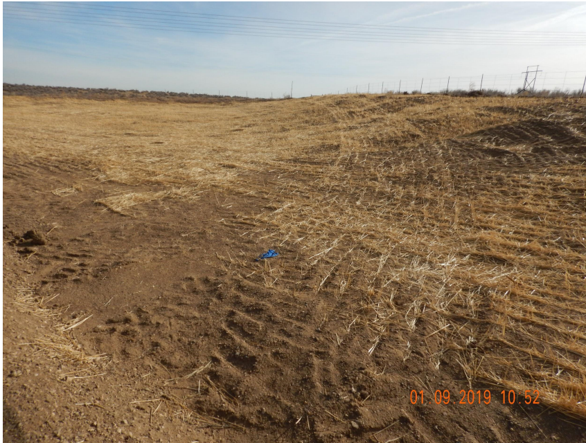
Photo 13. Photo taken from the southeastern interim reclamation area, facing East. See comments under Photo 2.