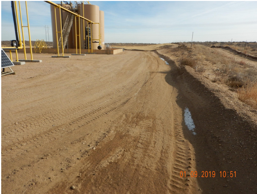
Photo 7. Photo taken from the western production area, facing South. See comments under Photo 1.