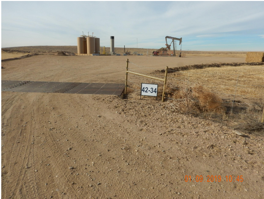
Photo 1. Photo taken from the entrance of the location, facing West. Photo illustrates Operator sign. Another Operator sign was located next to the pumpjack. Appears the Operator has performed interim reclamation activities to reduce disturbance areas only needed for production operations.