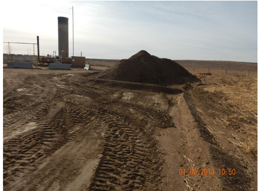
Photo 6. Photo taken from the western production area, facing Southwest. See comments under Photo 5.