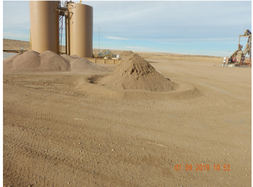
Photo 14. Photo taken from the southern production area, facing West. See comments under Photo 5.