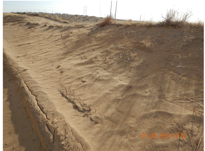
Photo 12. Photo taken from the southern cut slope of the location, facing East. See comments under Photo 9.