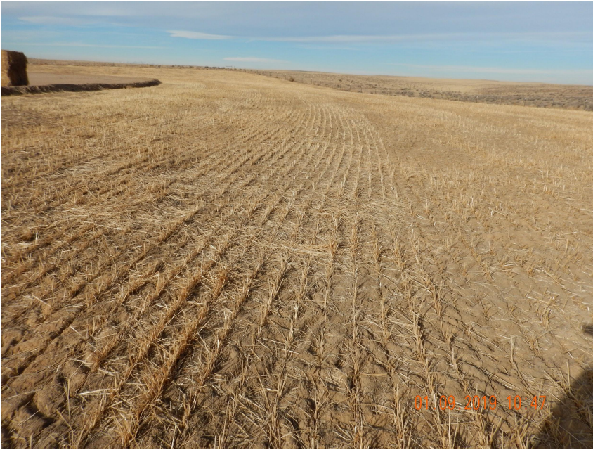
Photo 3. Photo taken from the northeastern interim reclamation area, facing West. See comments under Photo 2.