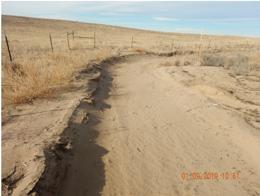
Photo 9. Photo taken from the southwestern perimeter of the location, facing West. Appears to be a relic ditch BMP that needs to be stabilized, as this is unconsolidated material that is susceptible to wind and water erosion. Wind erosion soil particle deposition was observed off Location at other nearby locations.