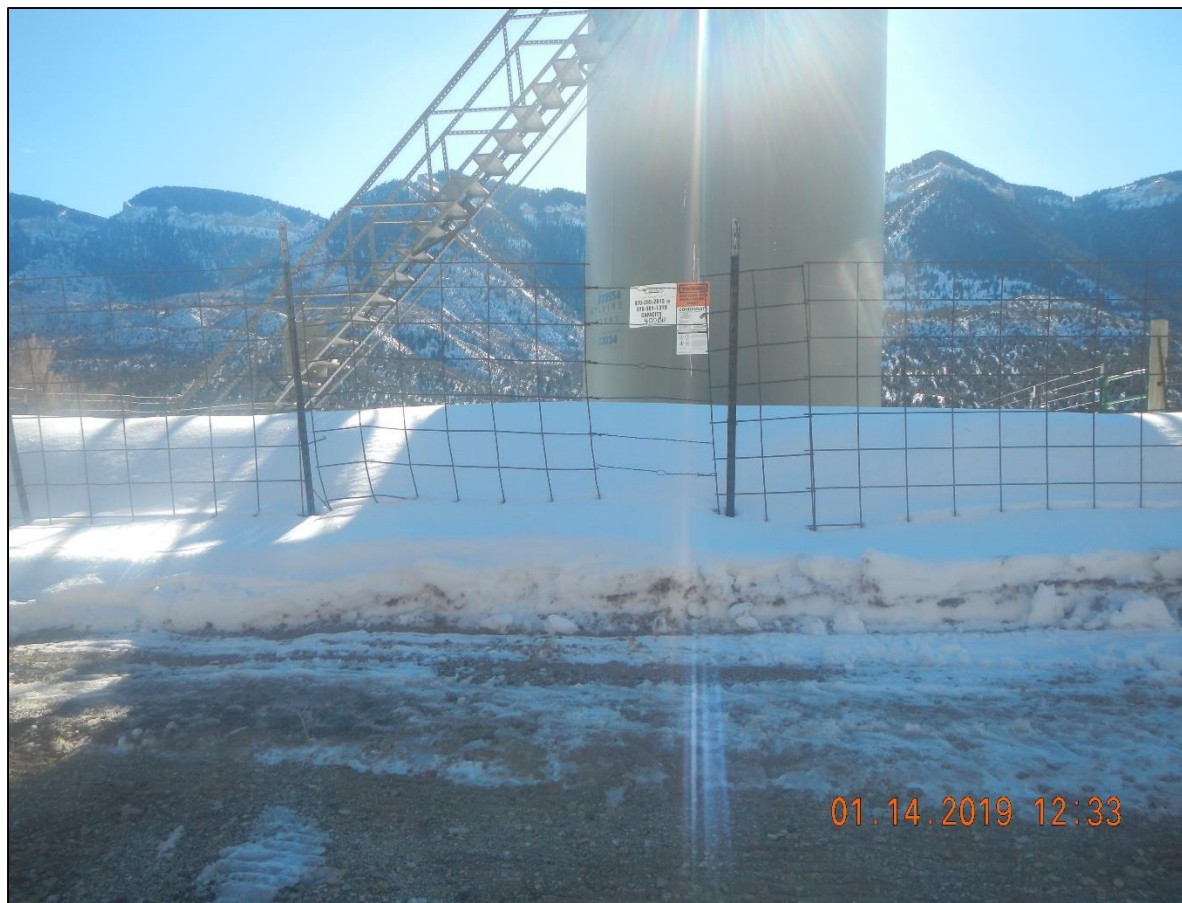
Opening in tank battery fencing is closed up.