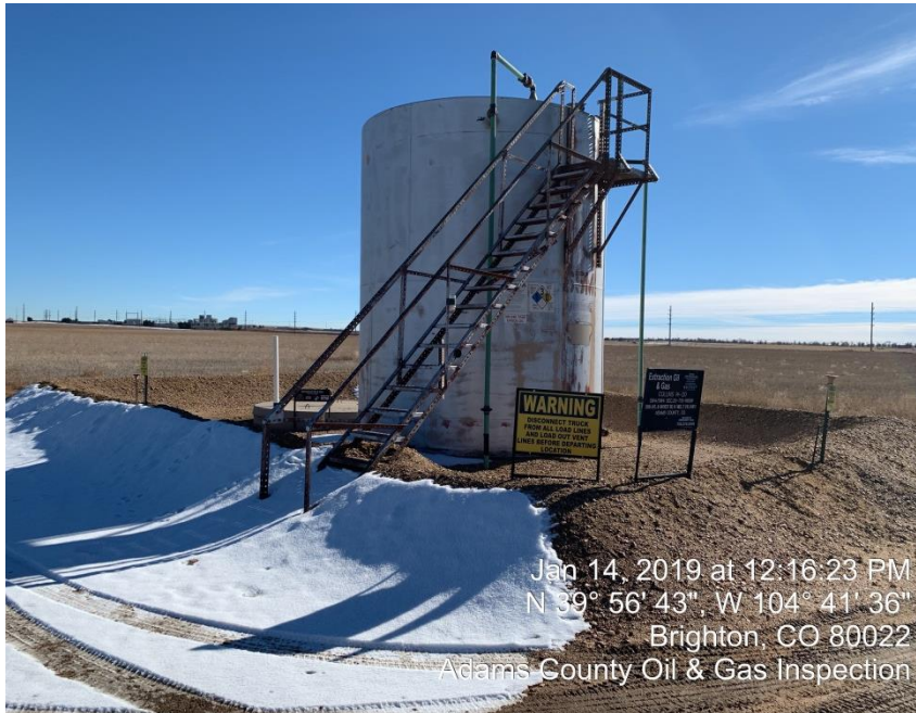
Photo#1 Production Tank and Produced Water Pit Corrective Action Paint Tank