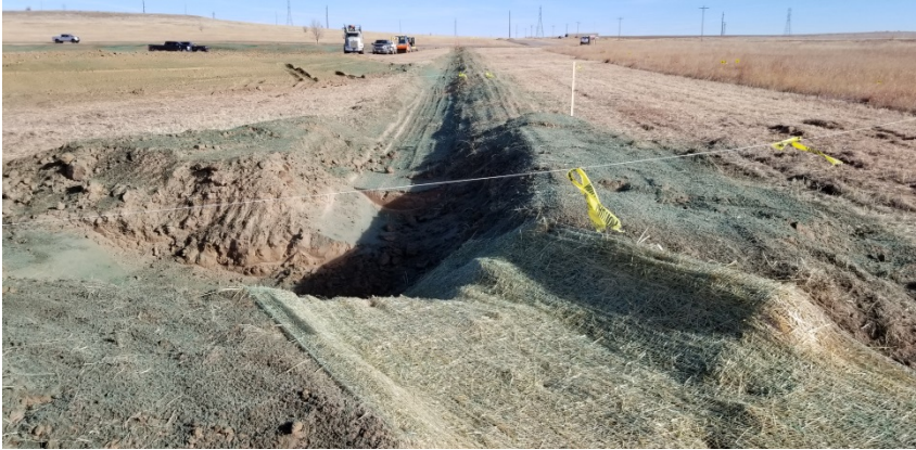
Photo 9. Photo taken from the southwestern perimeter of the location, facing East. See comments from Photos 1 and 7.