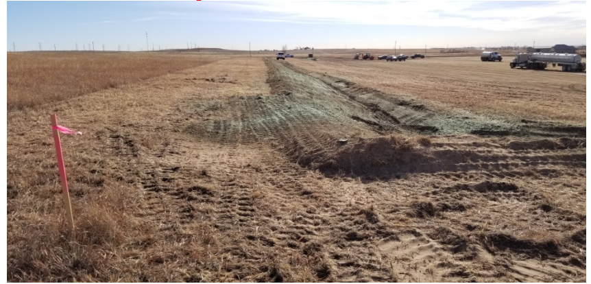
Photo 6. Photo taken from the northeastern perimeter of the location, facing South. See comments from Photo 1.