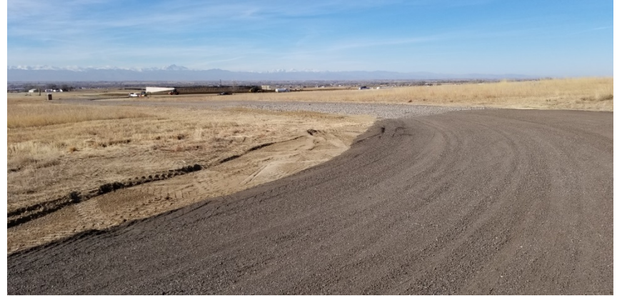
Photo 2. Photo taken from the entrance of the location off CR 8, facing Northwest. See comments from Photo 1.

Photo 1. Photo taken from the entrance of the location off CR 8, facing South. Operator has installed gravel potentially to limit tracking onto the county road. BMPs in proper functioning condition at the time of this inspection.