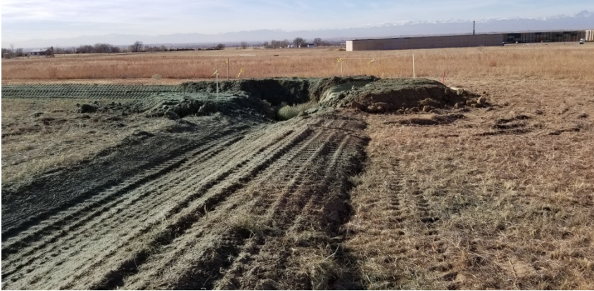
Photo 7. Photo taken from the northwestern perimeter of the location, facing West. Operator has installed a sediment trap with a temporarily stabilized outlet.