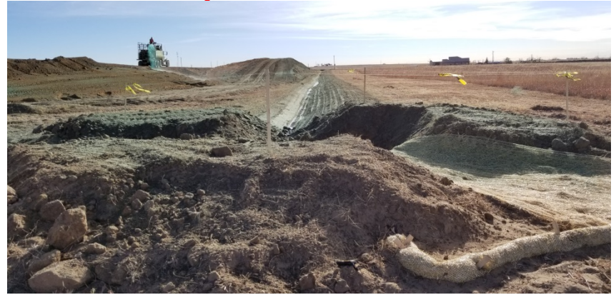
Photo 8. Photo taken from the northwestern perimeter of the location, facing South. See comments from Photo 7.