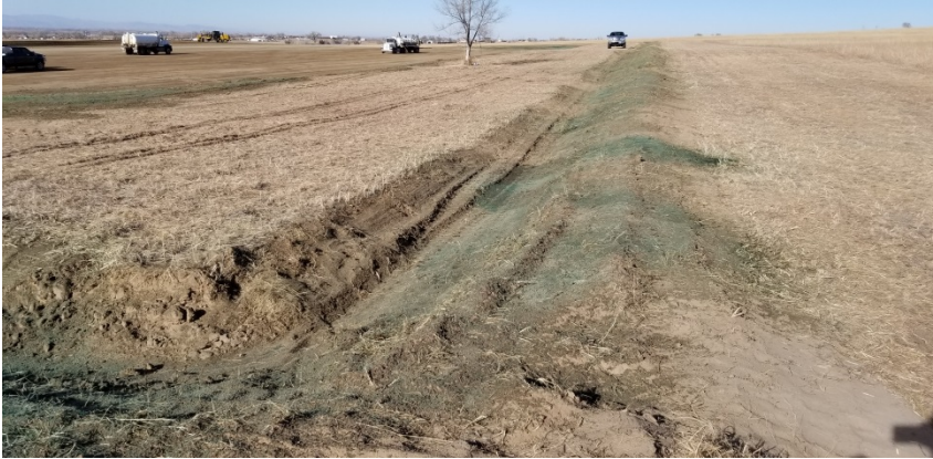
Photo 3. Photo taken from the southeastern perimeter of the location, facing North. Photo illustrates the ditch and berm BMP that has been installed around the perimeter of the location.