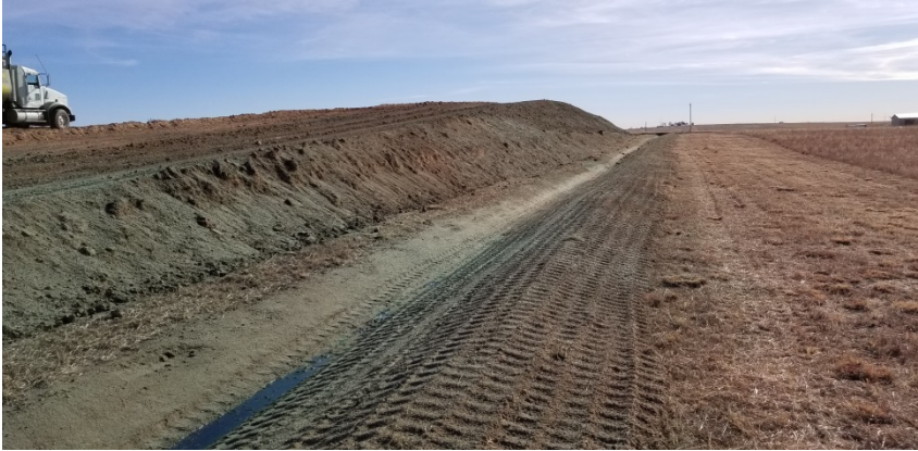
Photo 11. Photo taken from the Western perimeter of the location, facing South. The topsoil stockpile being stored along the western area has been temporarily stabilized with equipment tracking and hydroseed.