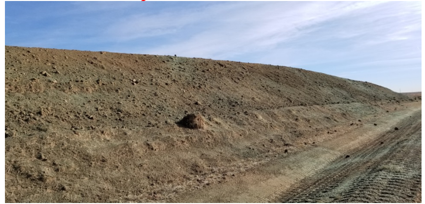
Photo 12. Photo taken from the Western perimeter of the location, facing South. See comments from Photo 11.