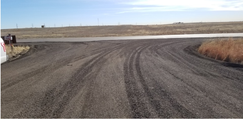
Photo 1. Photo taken from the entrance of the location off CR 8, facing South. Operator has installed gravel potentially to limit tracking onto the county road. BMPs in proper functioning condition at the time of this inspection.