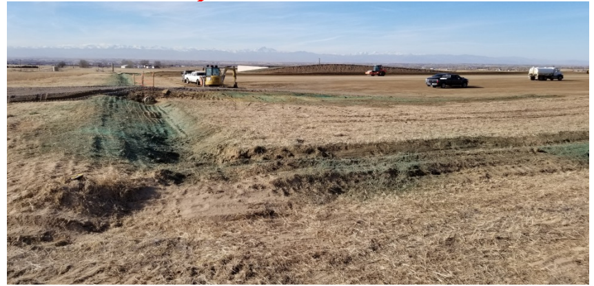
Photo 4. Photo taken from the southeastern perimeter of the location, facing West. See comments from Photo 1.