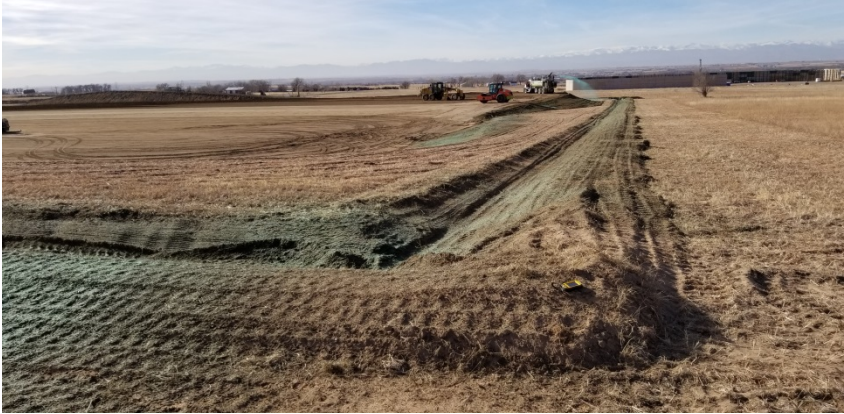
Photo 5. Photo taken from the northeastern perimeter of the location, facing West. See comments from Photo 1.