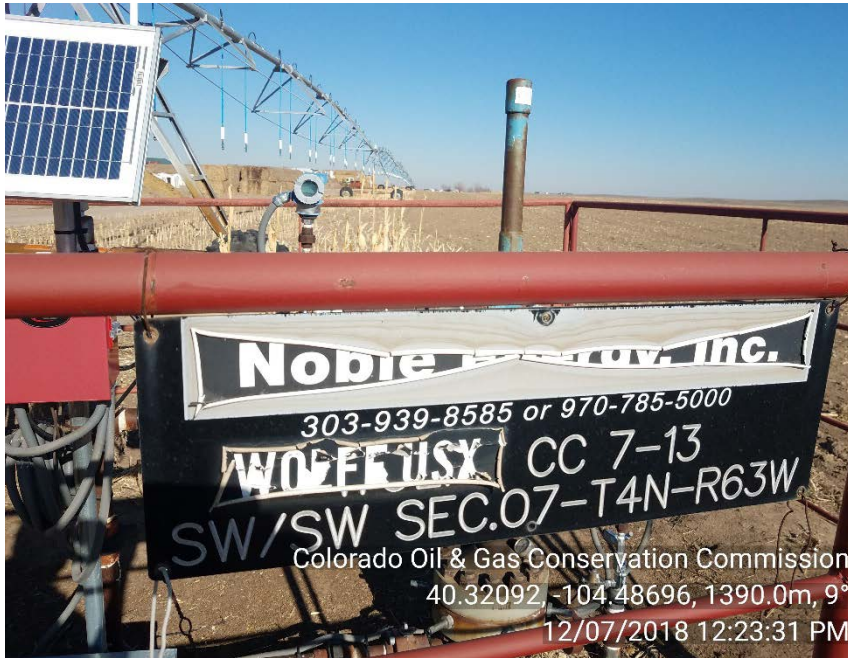
Emergency contact number on 12/7/18