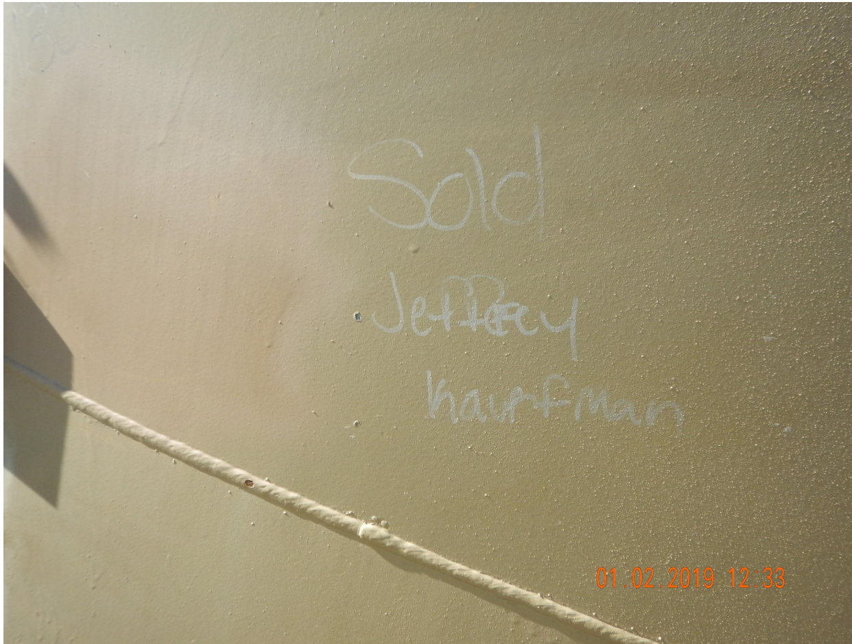
Photo 1. Photo taken from the southern location, facing West. Photo illustrates inadequate berms around tanks. Stormwater has eroded the berm and is eroding underneath one of the tanks- see next photo for a close up.