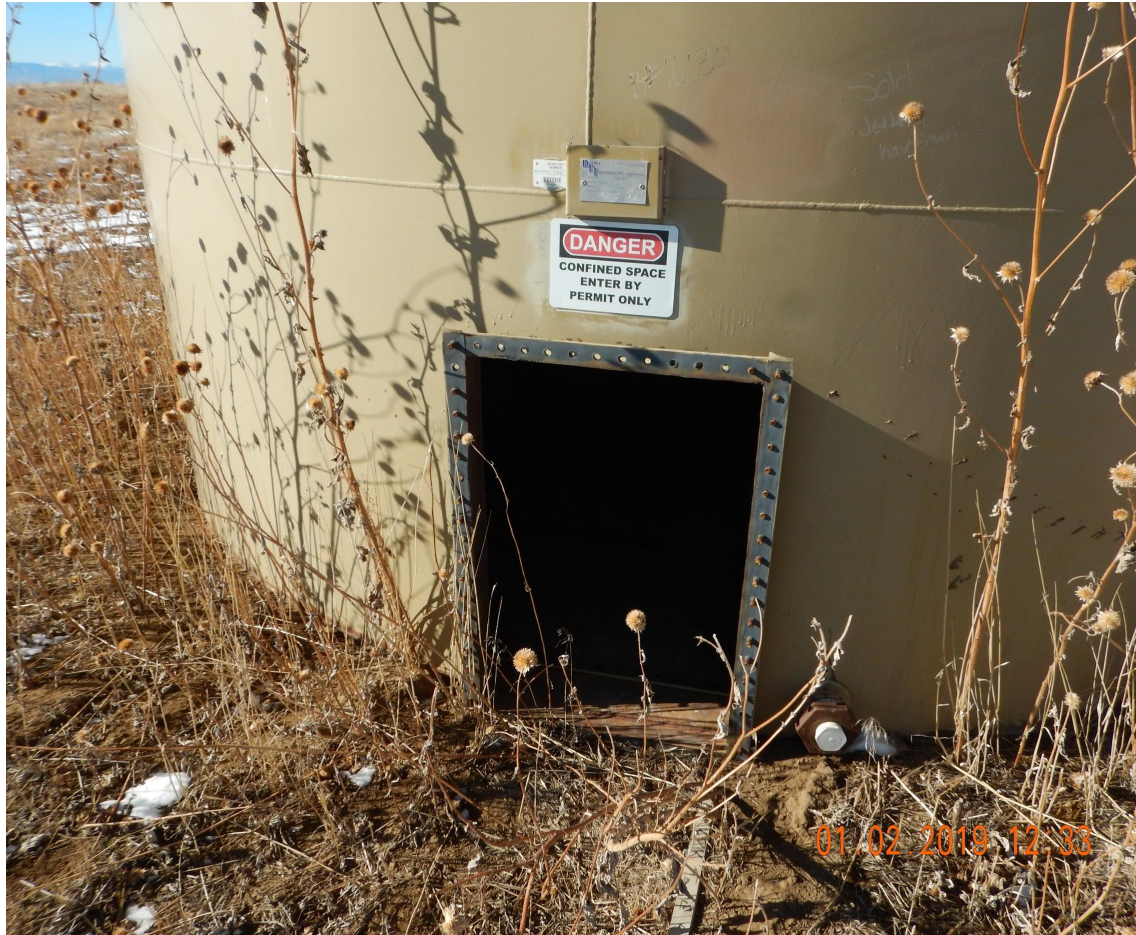
Photo 2. Close up photo illustrating stormwater eroding underneath the tank.