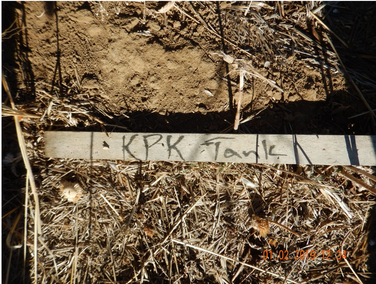
Photo 3. Close up photo taken of the previous tank illustrating a leak needing repair.