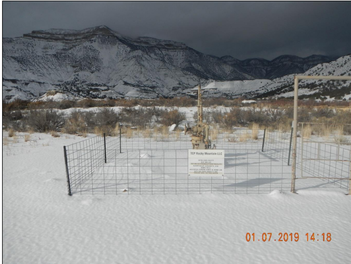
Well sign photo.