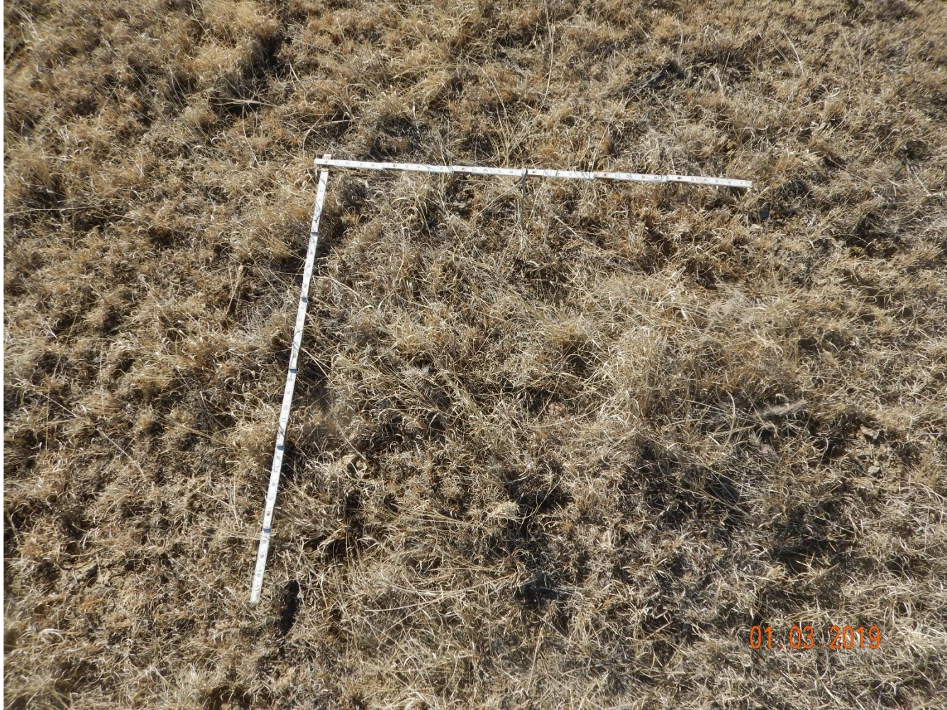
Photo 5: Photo taken from the adjacent reference area. Photo shows reference vegetation. Vegetation observed includes Blue grama, Buffalo grass, Wester wheat, Purple threeawn, sand dropseed, etc... 3x3 foot measuring stick for reference.