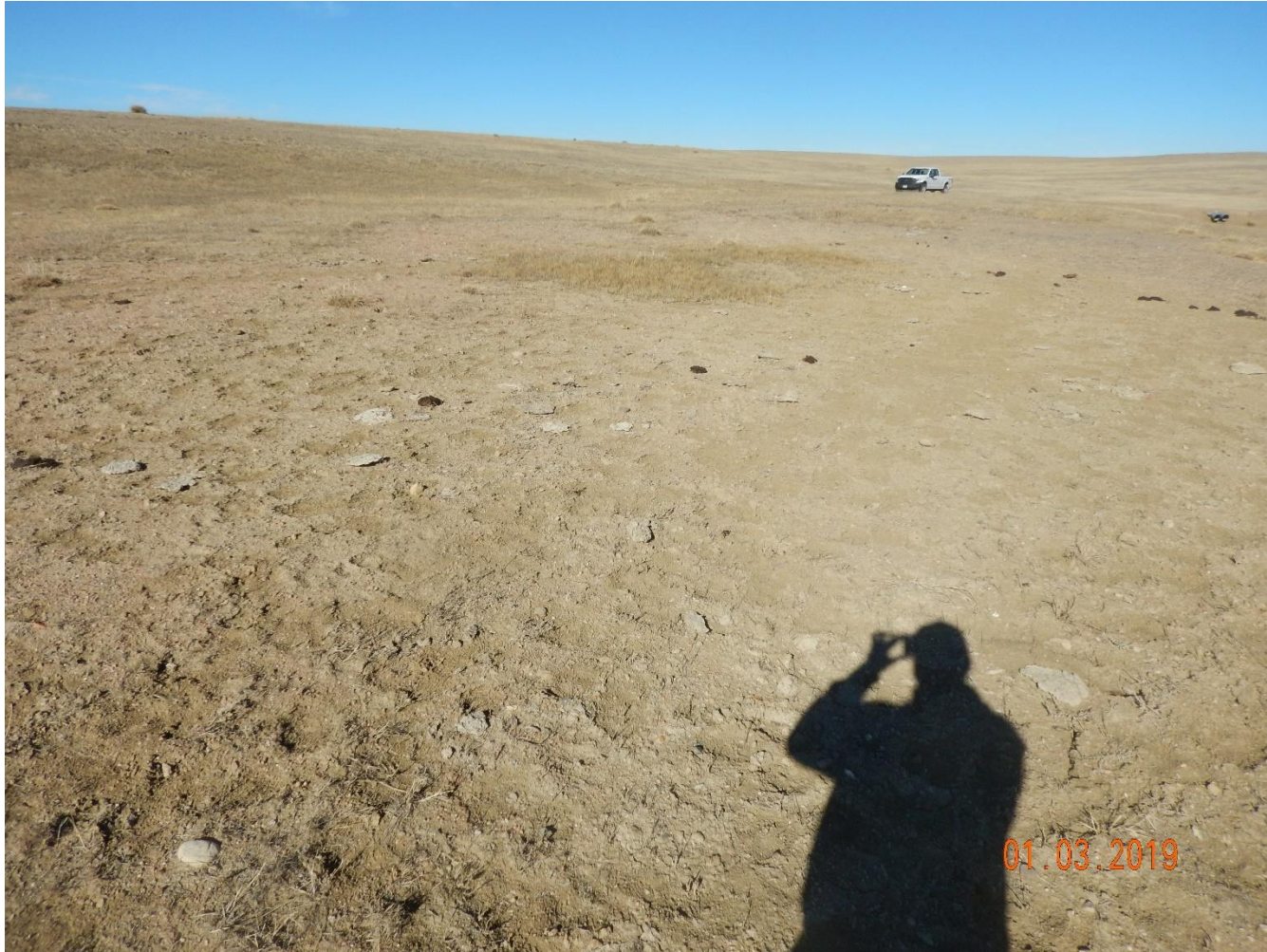
Photo 2: Photo taken from the south end of the location, facing north. Photo shows areas of the location/well remains predominantly bare and exposed soil. Location does not meet reclamation requirements.