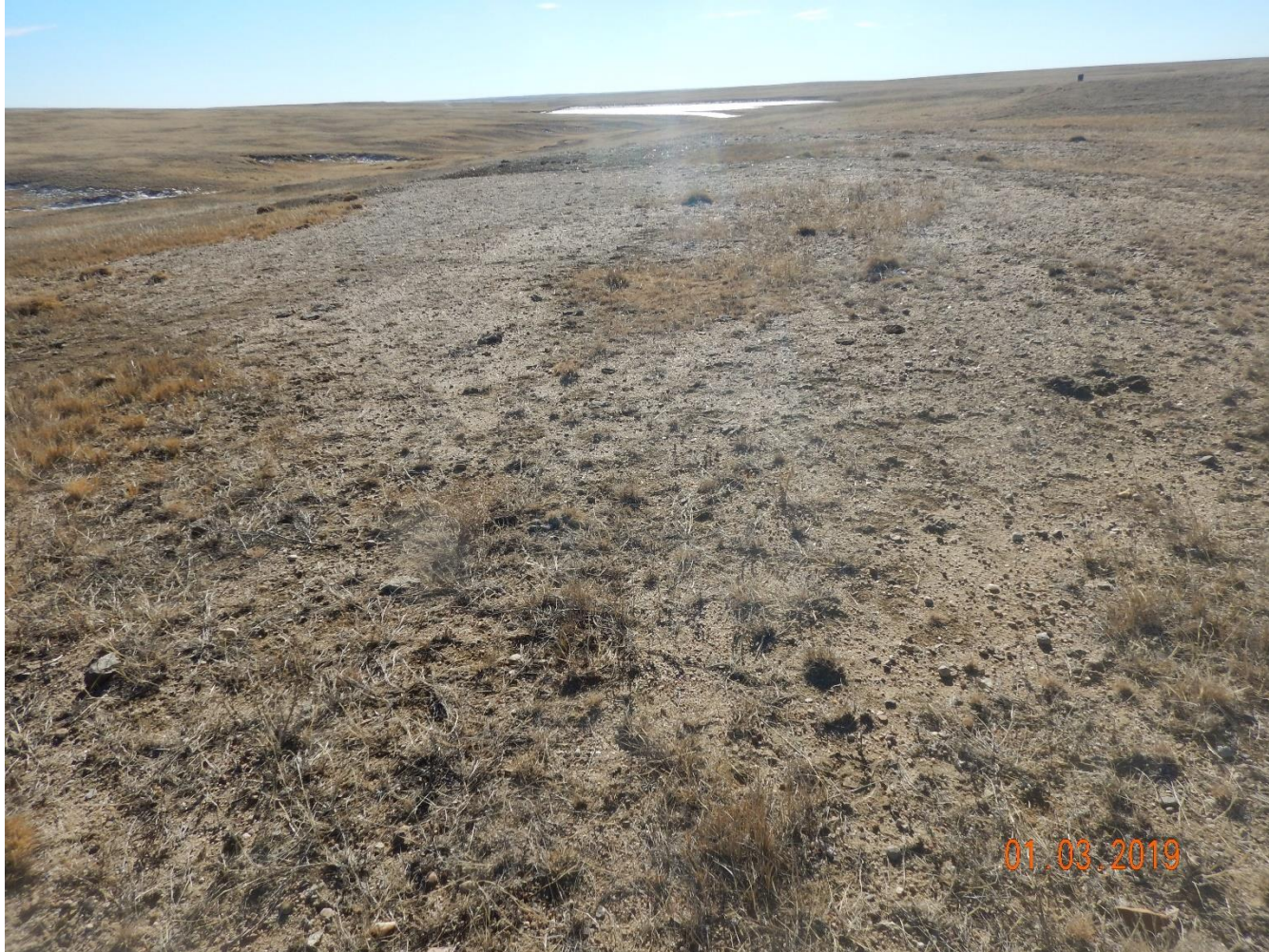
Photo 1: Photo taken from the north end of the location, facing south. Photo shows areas of the location/well remains predominantly bare and exposed soil. Location does not meet reclamation requirements.