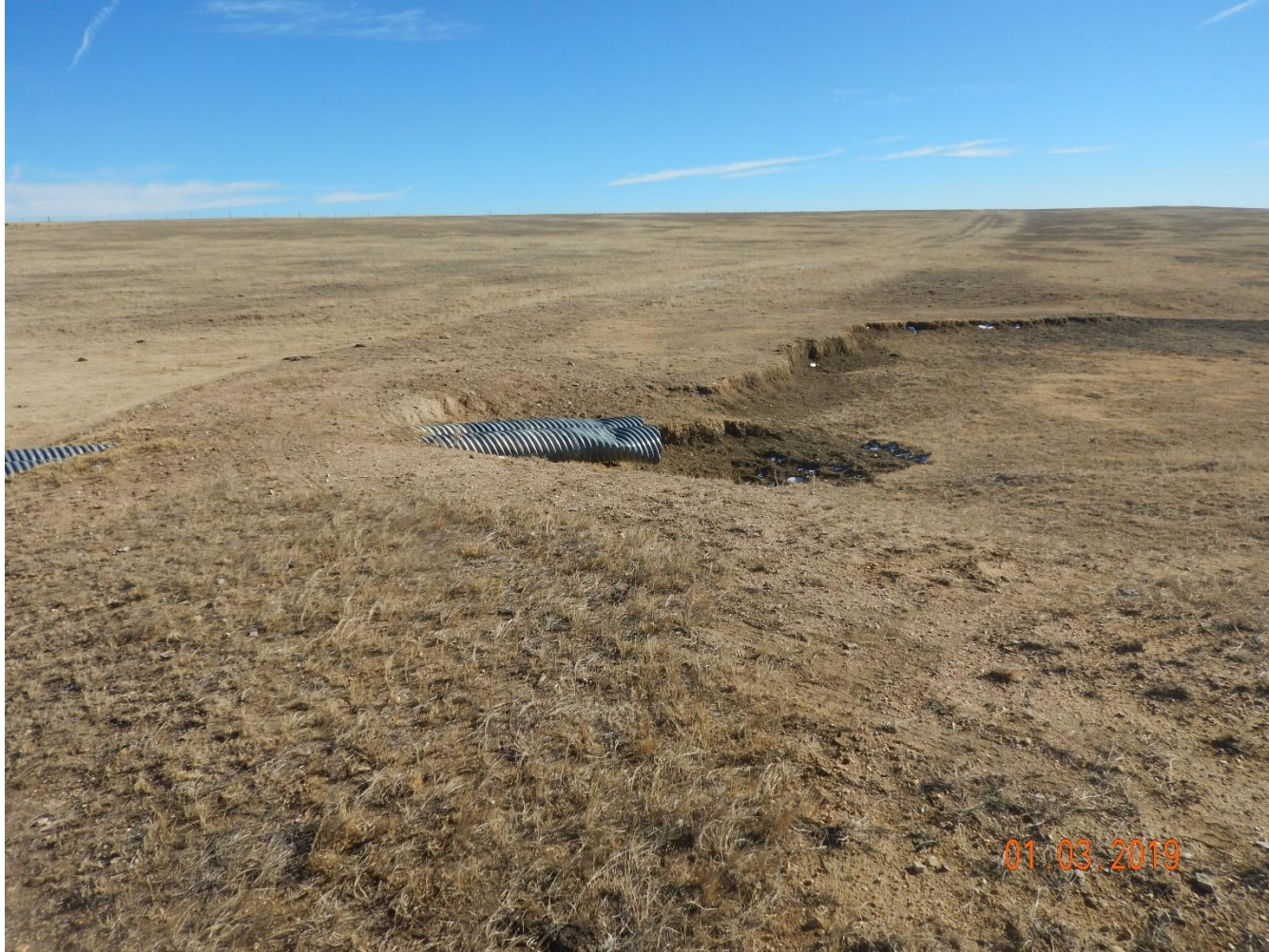
Photo 7: Photo taken from the north end of the location, facing east. Photo shows a section of access road/culvert that was constructed to cross a drainage. Access road requires reclamation including removal of culvert and restoration of the drainage.