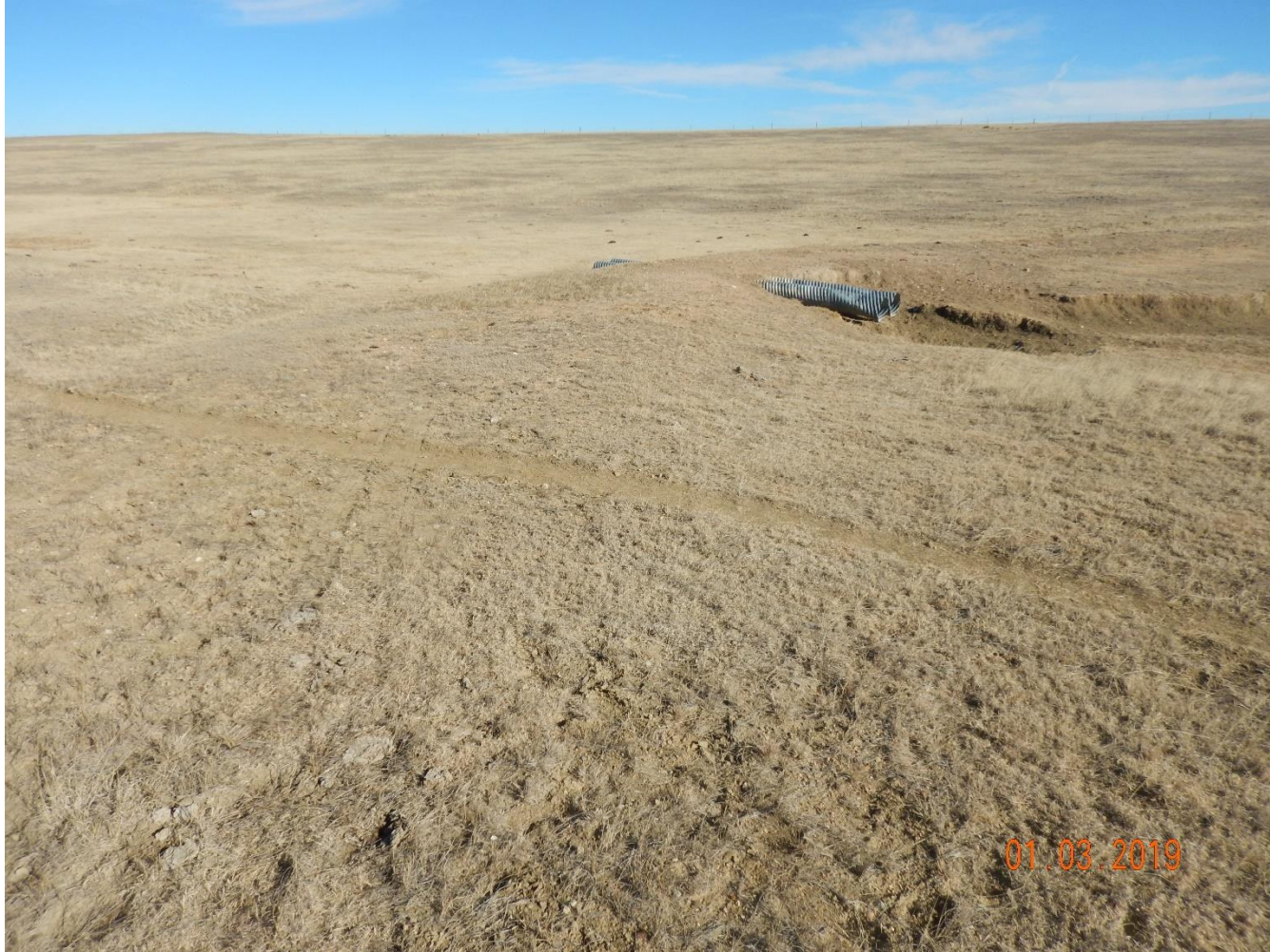
Photo 6: Photo taken from the north end of the location, facing east. Photo shows a section of access road/culvert that was constructed to cross a drainage. Access road requires reclamation including removal of culvert and restoration of the drainage.