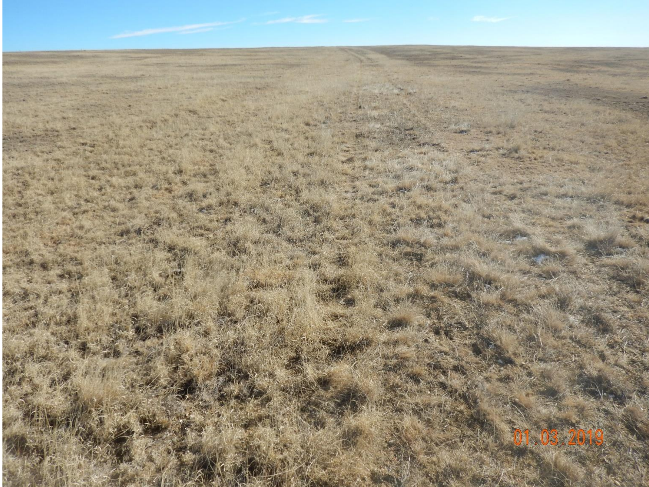
Photo 8: Photo taken from the access road, east of the location. Vegetation appears to have achieved uniform establishment on access road.