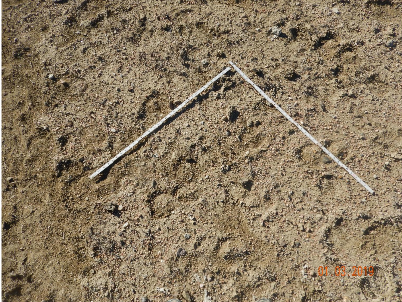
Photo 4: Photo taken from the location. Photo shows location remains predominantly bare and exposed soil. 3x3 foot measuring stick for reference.