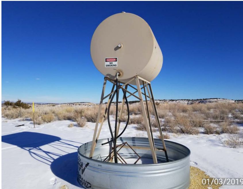
Photo 3. Container without label.