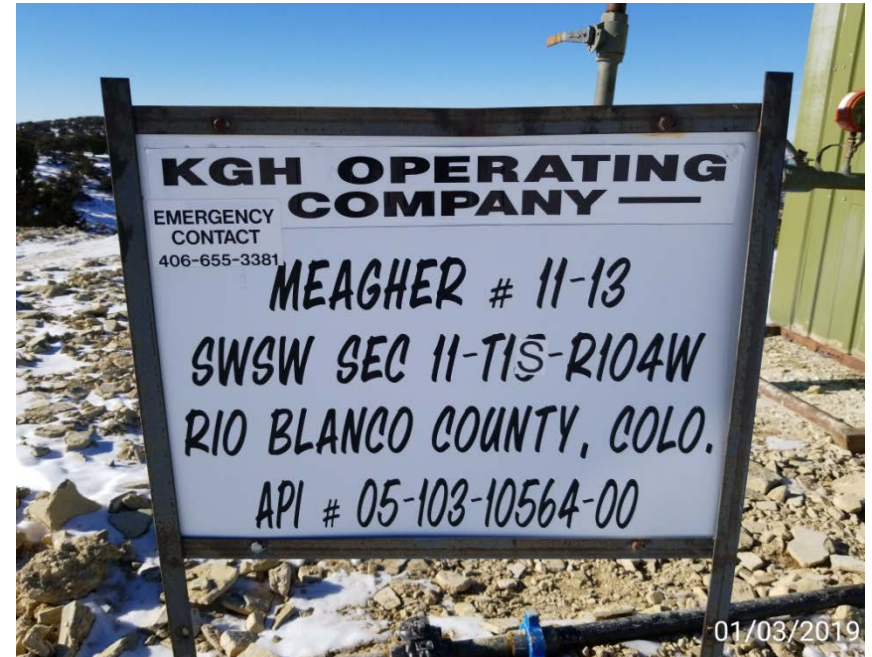
Photo 4. Sign missing nearest public road 114.