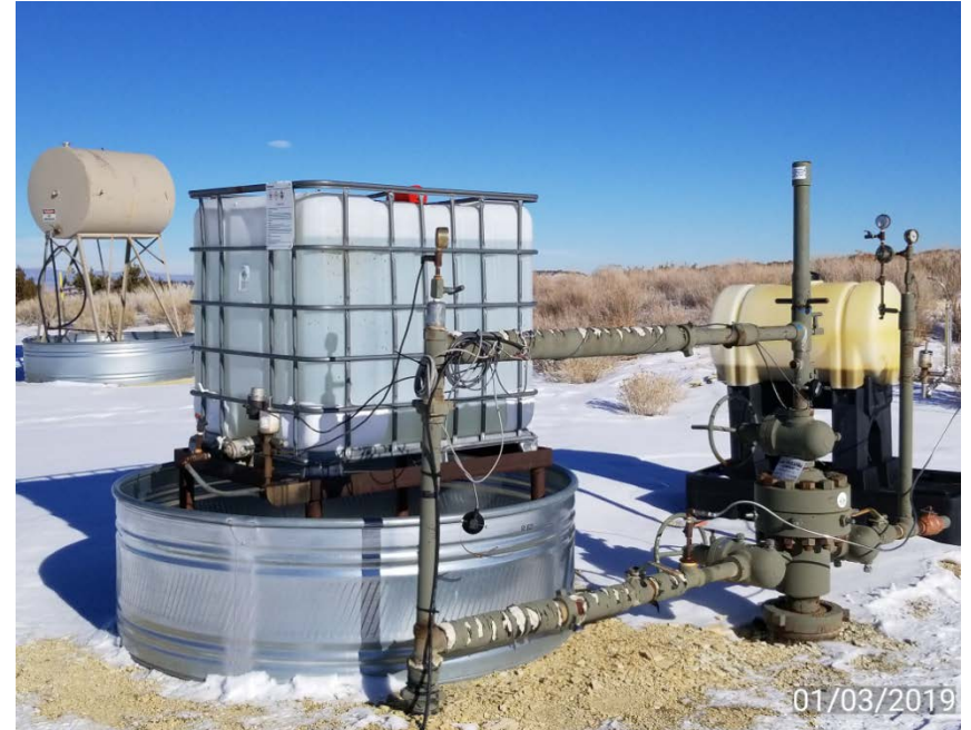
Photo 2. Well head.