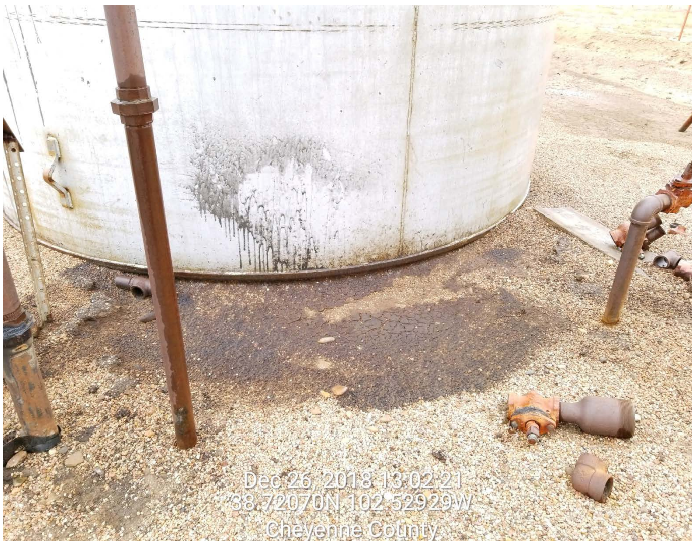
Stained soil around tank

Location Name: Lowe #4 API: 017-06294 Inspection Date: 12/26/2018