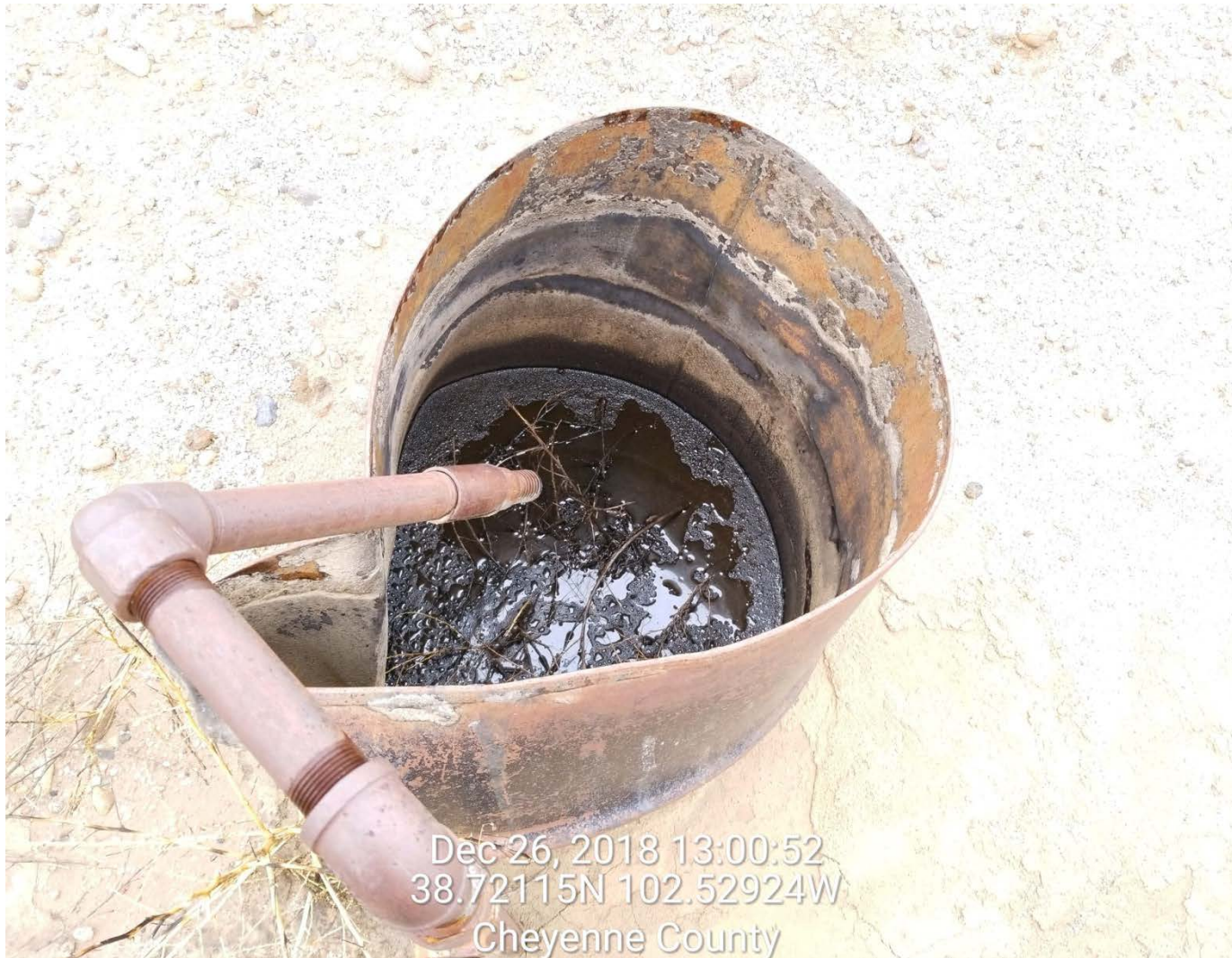
Above ground oil tank open and allowing wildlife access.

Location Name: Lowe #4 API: 017-06294 Inspection Date: 12/26/2018