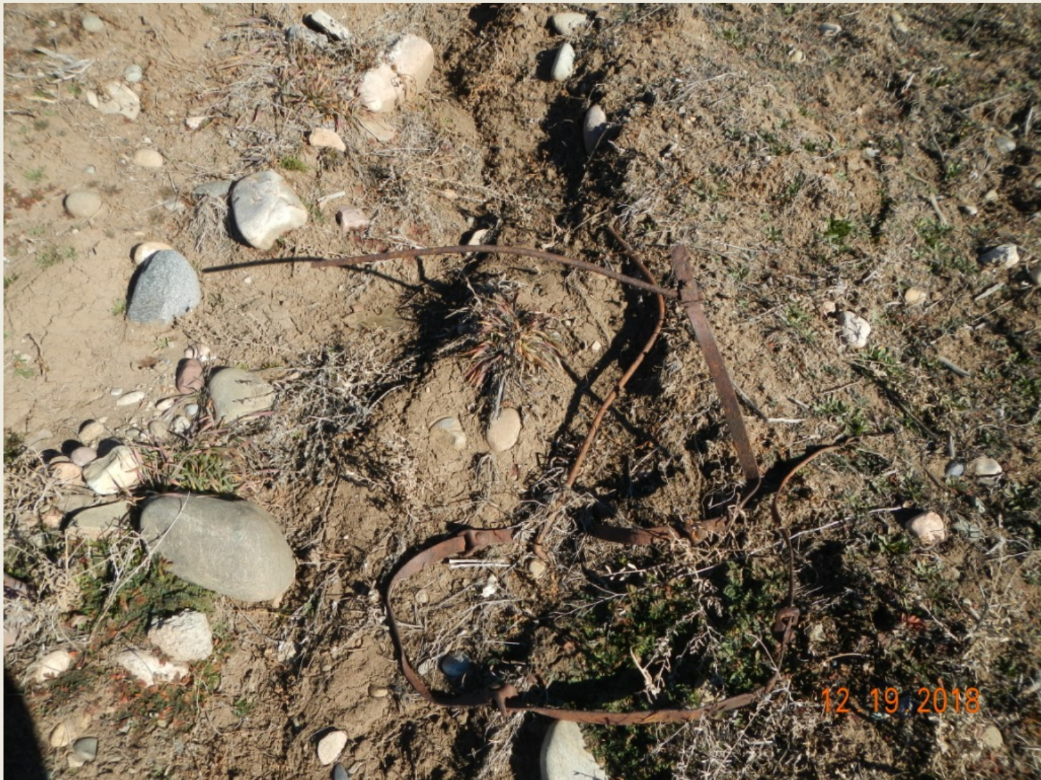
Photo 6. View of metal debris within the northeastern project area.