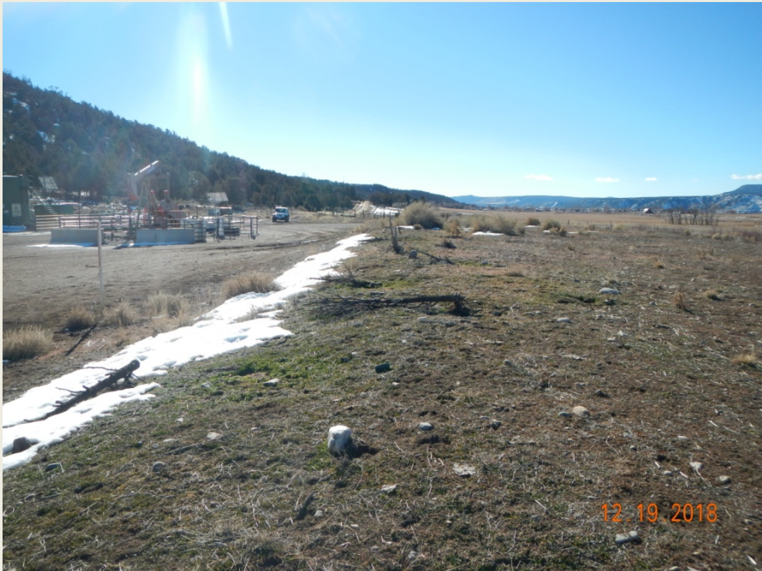
Photo 2. View the western project area from the northwestern corner facing southward.