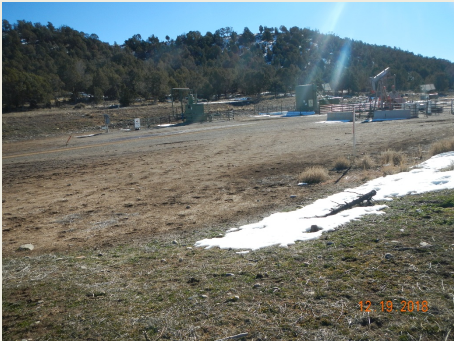
Photo 1. View of the northwestern project area from the well pad entrance facing eastward.