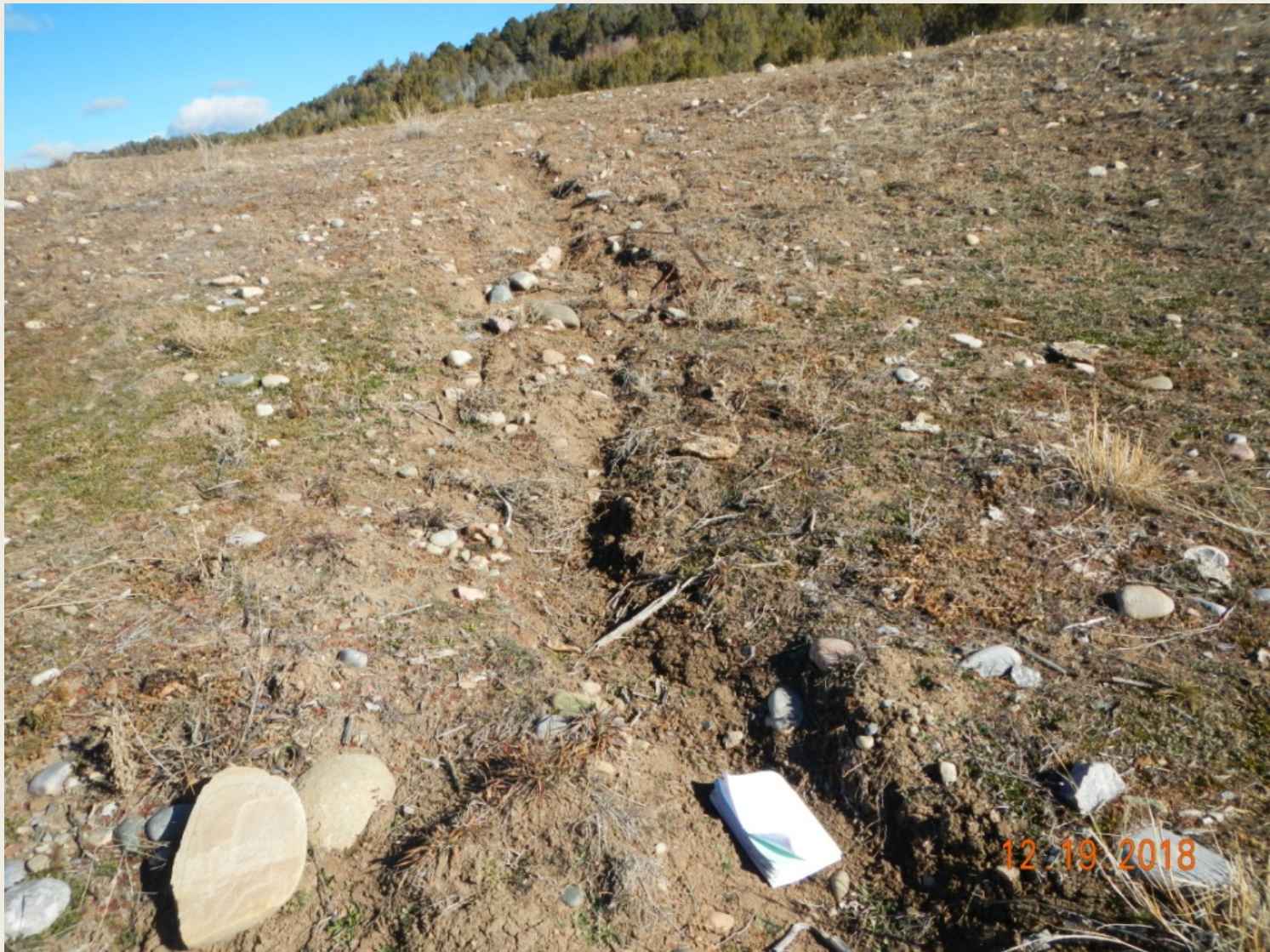
Photo 4. View of an erosional channel approximately 1.5 feet wide and 10 inches deep within the northeastern project area.