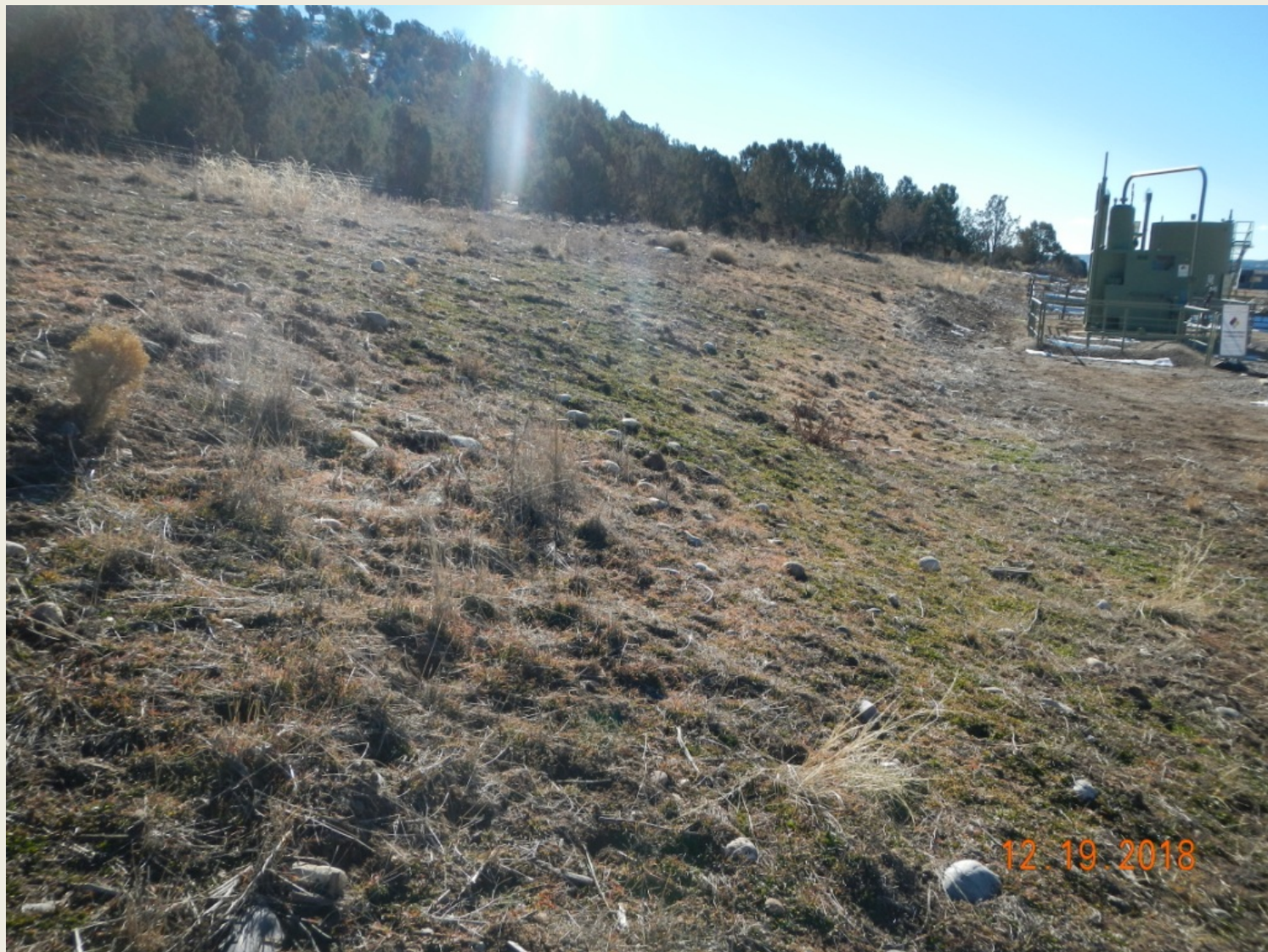
Photo 5. View of the eastern project area from the northeastern corner facing southward. Vegetation is grazed and largely comprised of weedy annuals.