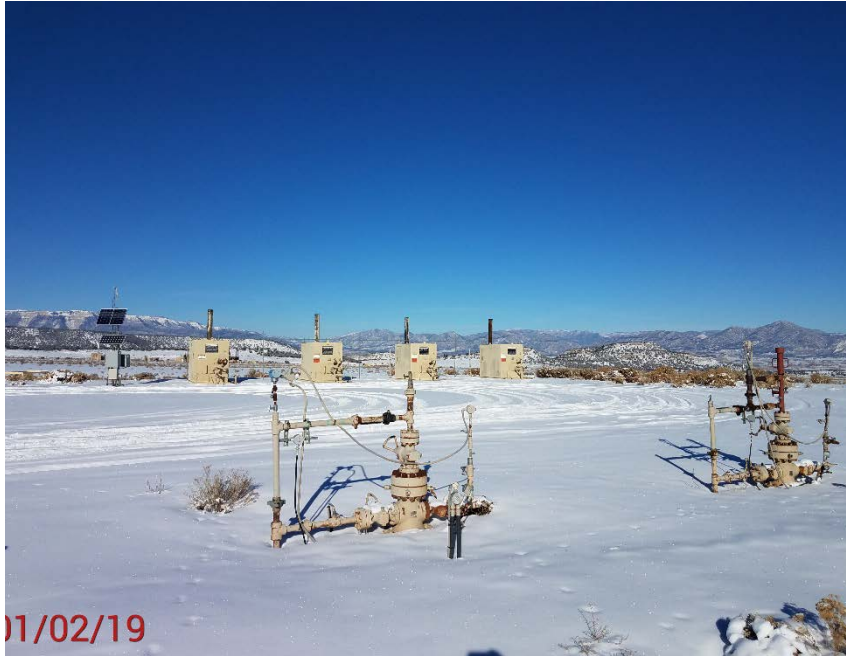
Location Photo #1