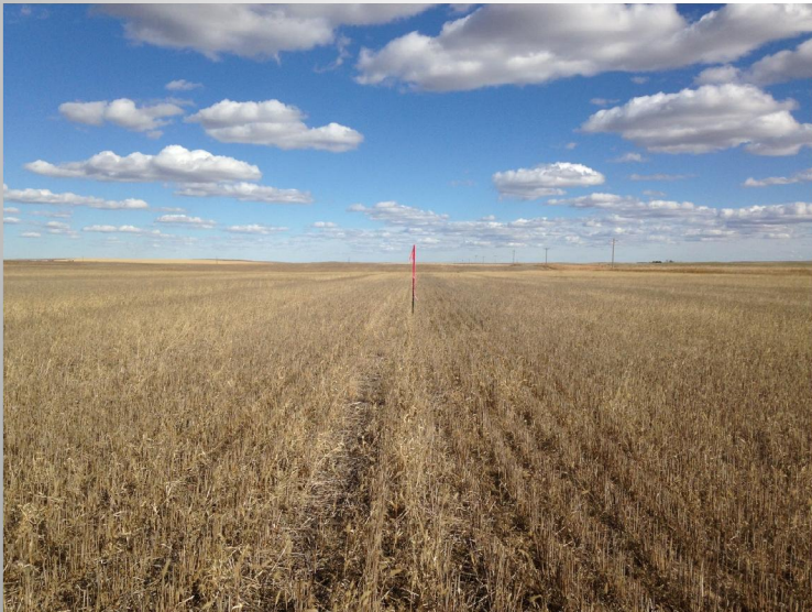
Gunbarrel #1 • East View