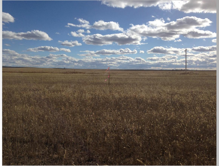
Gunbarrel #1 • South View