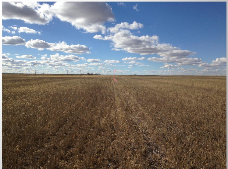
Gunbarrel#1 • West View