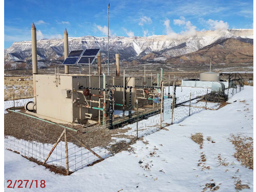
Location Photo #2