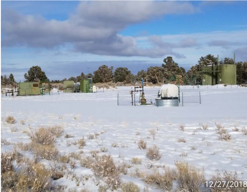
Photo 1. Location looking north.