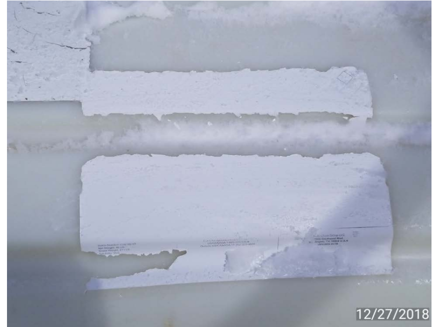
Photo 2. Container label not readable.