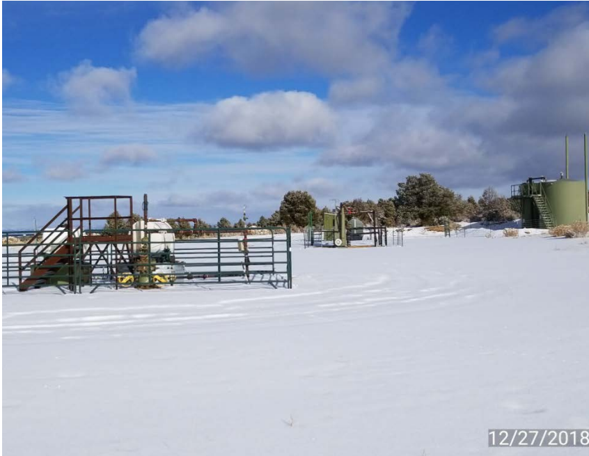
Photo 1. Location looking northeast.