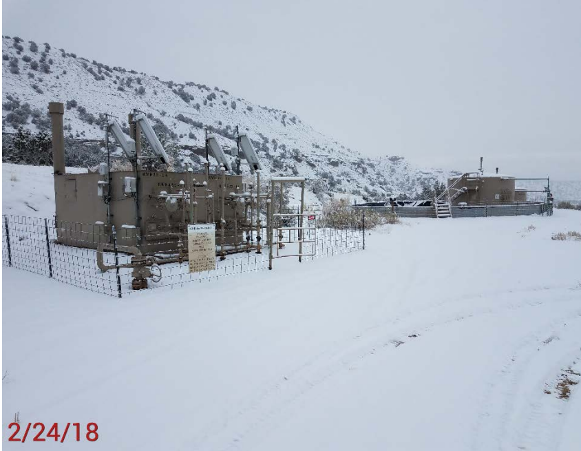
Location Photo #3