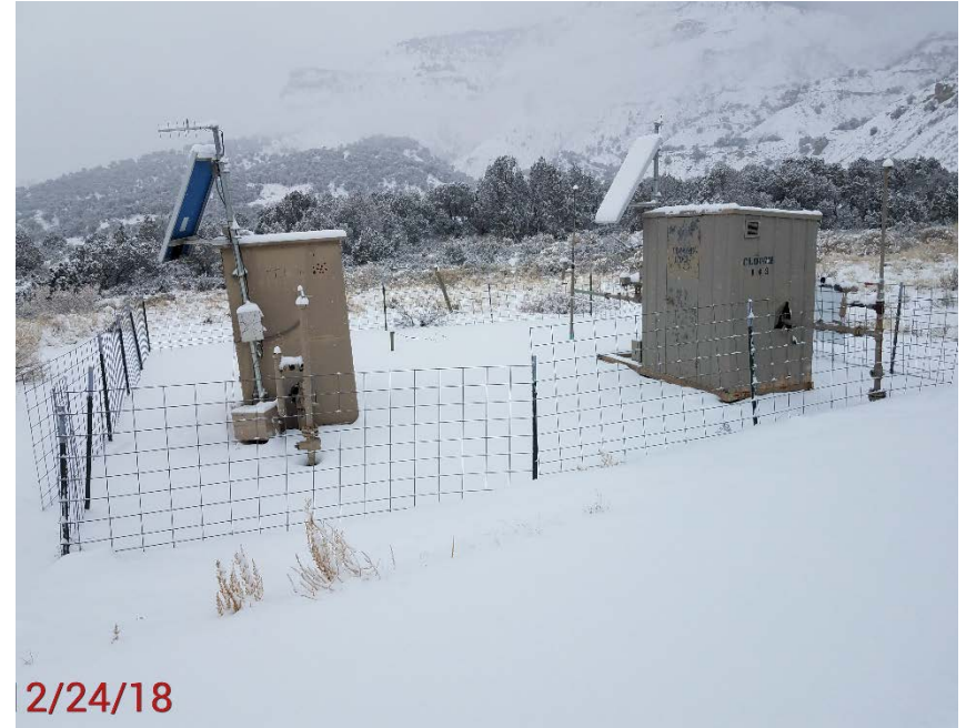
Location Photo #2