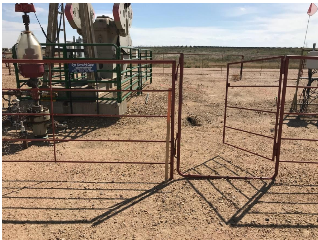
Photograph 3: View facing south as required in COGCC Rule 1004.