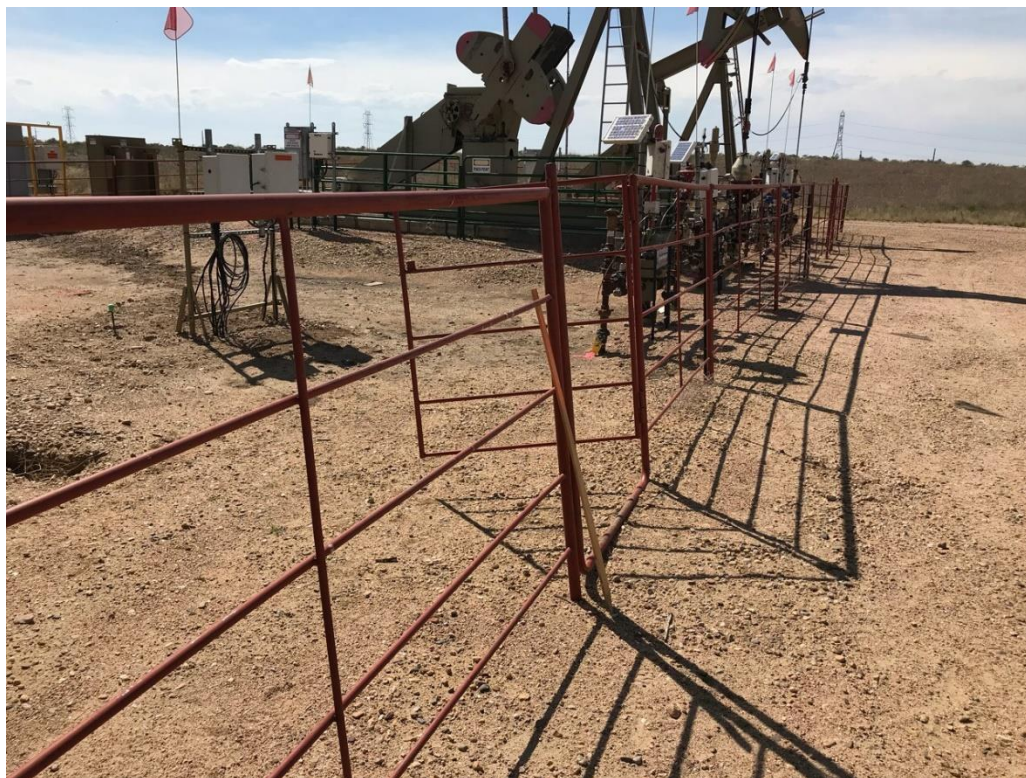
Photograph 4: View facing west as required in COGCC Rule 1004.