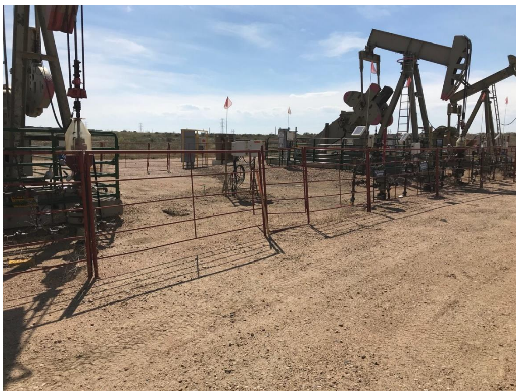
Photograph 5: Overall site view per COGCC Rule 1004.