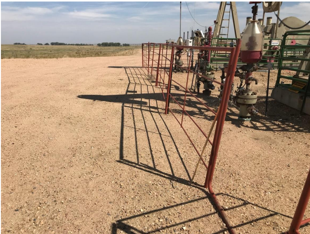
Photograph 2: View facing east as required in COGCC Rule 1004.