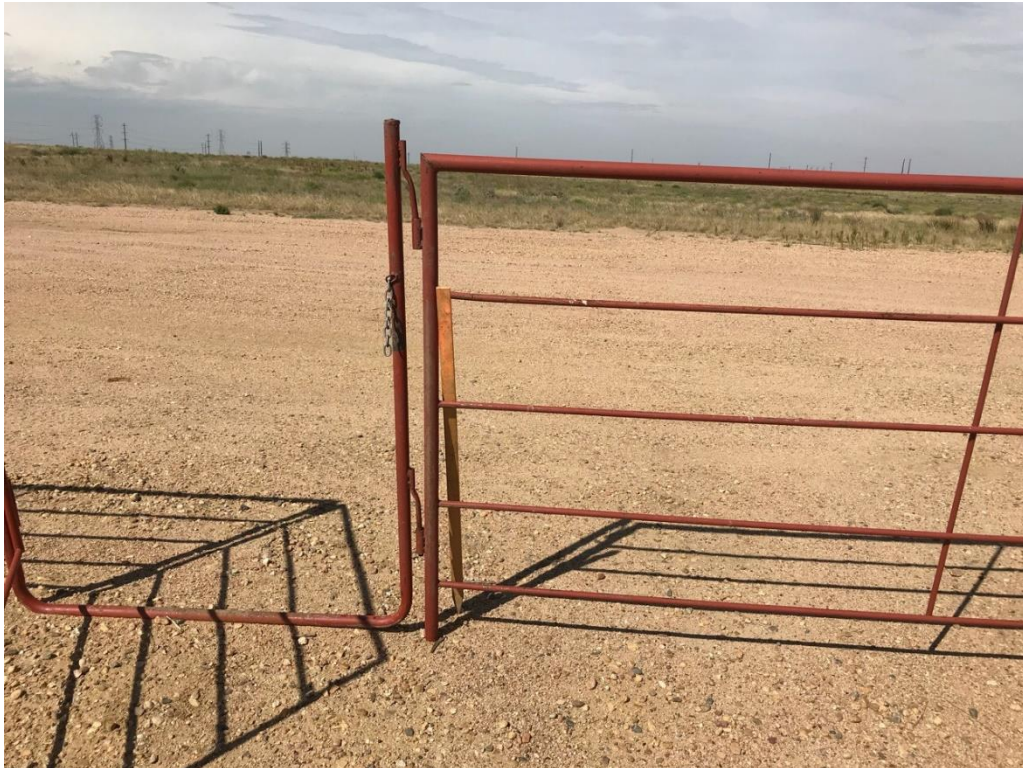
Photograph 1: View facing north as required in Colorado Oil and Gas Conservation Commission (COGCC) Rule 1004.