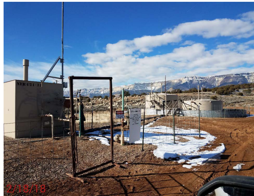
Location Photo #2