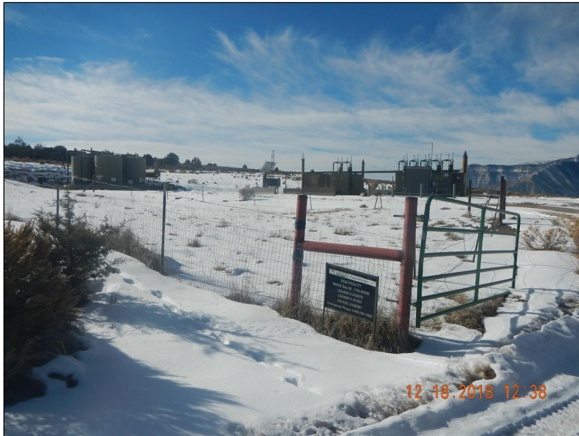
Location sign photo