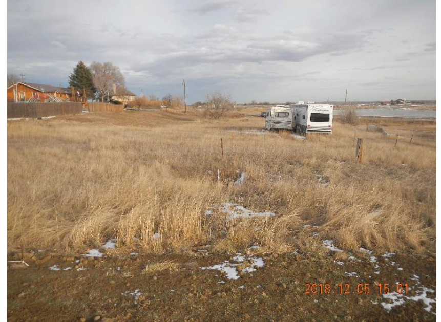
Photo 10: Wellhead center of picture looking SE from construction site.