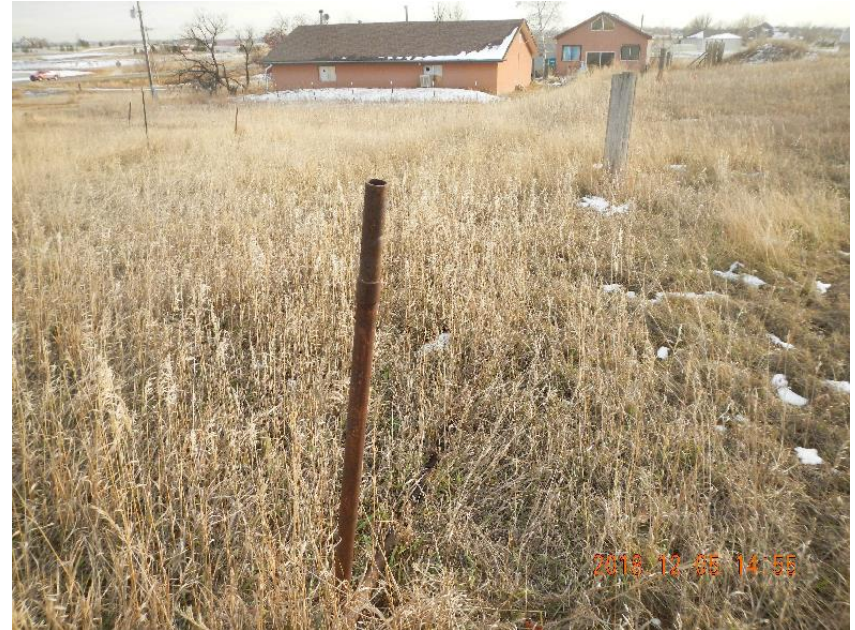
Photo 4: Disconnected line off E side of well looking SE towards house.