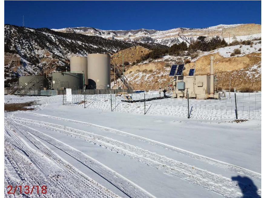
Location Photo #2