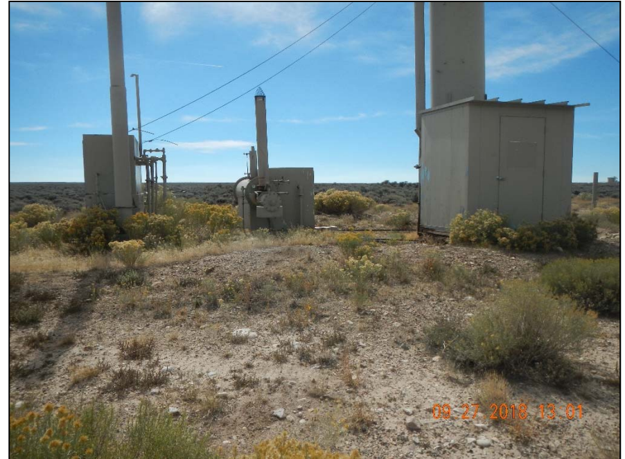
Photo 6. Weeds and vegetation around fired equipment.