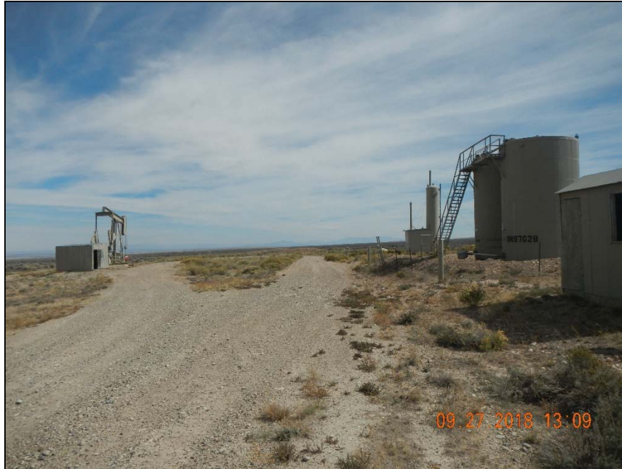
Photo 1. Overview of location taken at entrance facing east.