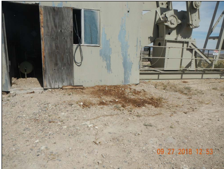
Photo 3. Stained soil at pump jack motor shed.