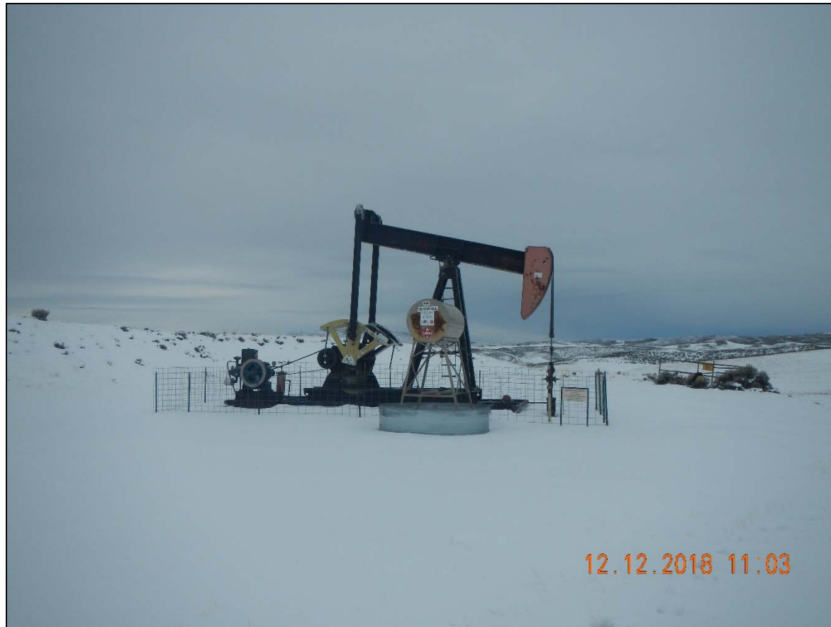
Photo 1. Overview of location taken at entrance facing southwest.

Inspection Photos Location Name: Fox Gov 1-30 API: 05-081-05372