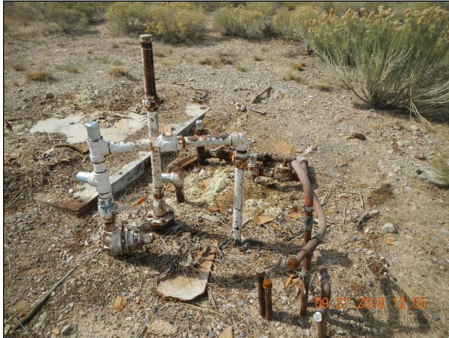
Photo 5. Unmarked risers.