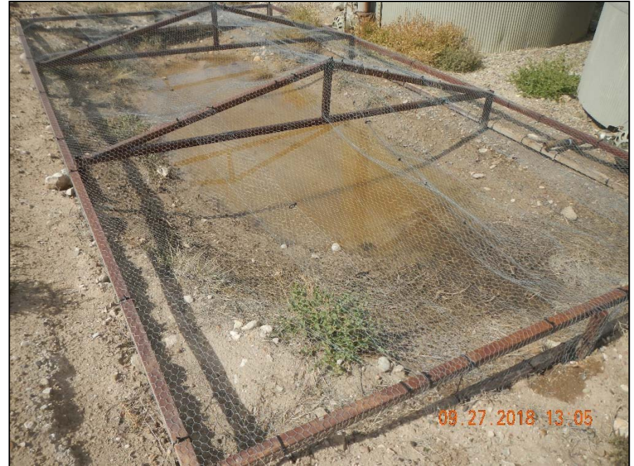
Photo 2. Pit in tank battery.