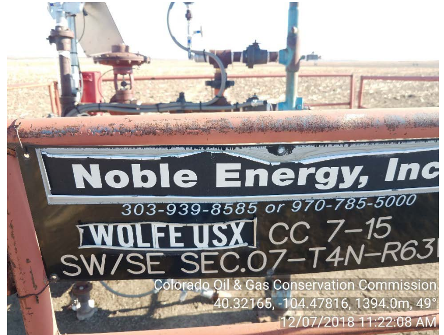
Emergency contact number