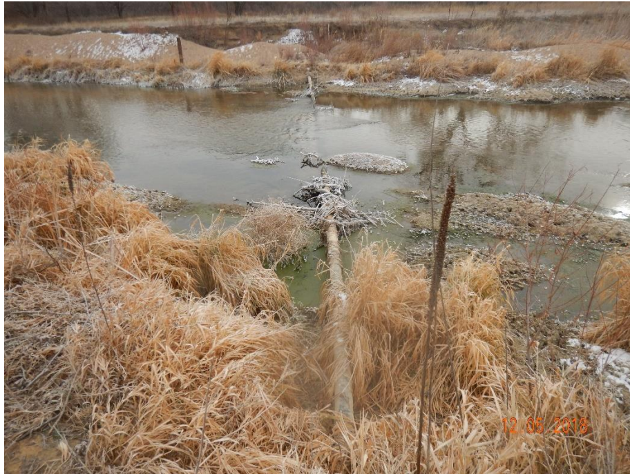
Photo 1: Photo taken from the ditch (40°33'10.81"N, 103°14'40.52"W) facing south. Photo shows flowline/risers have not been removed per corrective actions.