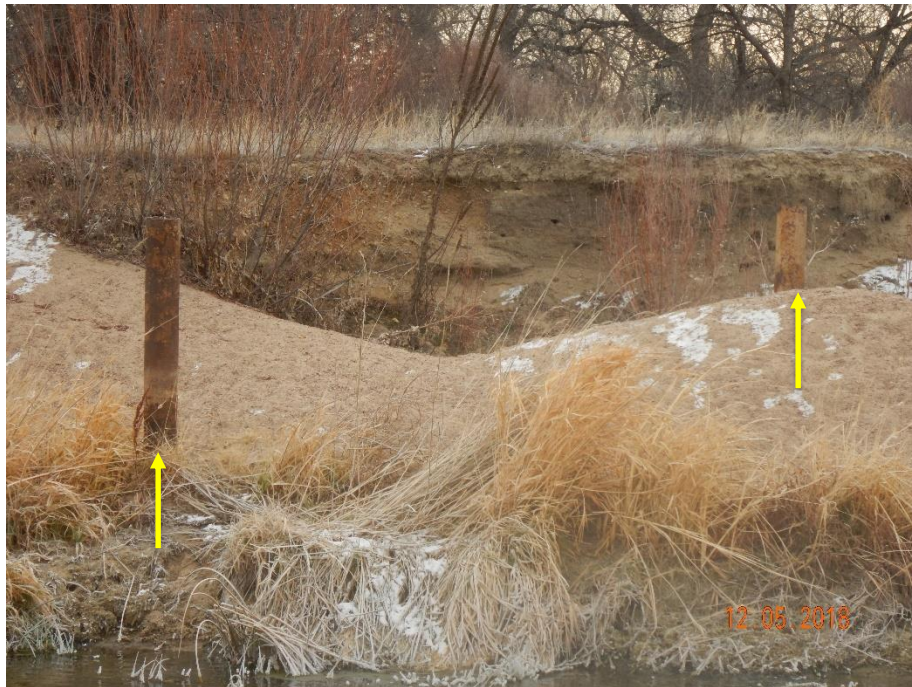
Photo 3: Continued from photo 2. Photo shows the two previously documented risers have not been removed