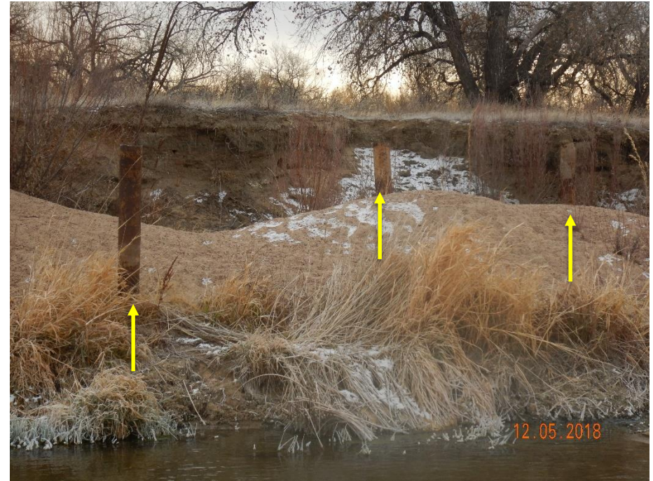
Photo 2: Photo taken from the ditch (40°33'10.81"N, 103°14'40.52"W) facing south. Photo shows the two risers documented in the previous inspection, as well as a third riser not previously documented.