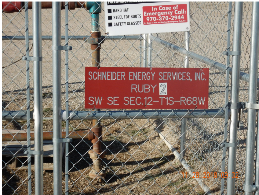
Photo 1. Operator well sign.