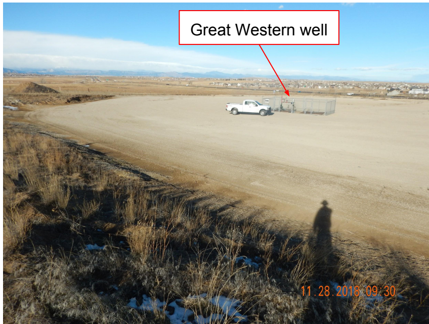
Photo 3. Photo taken from the southern perimeter of the location, facing Northwest. Photo illustrates that interim reclamation has not been performed. This location is not in compliance with Rule 1003 standards.