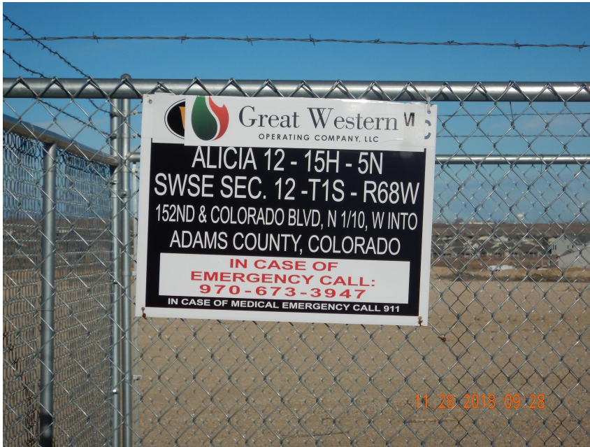
Photo 1. Operator well sign.