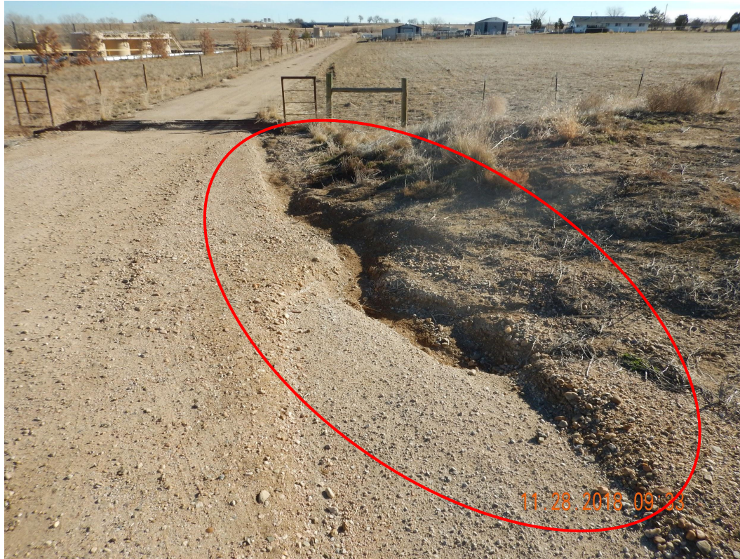
Photo 5. Photo taken from the entrance of the location, facing East. Photo illustrates stormwater erosion discharging off location. This location is not in compliance with Rule 1002 standards.