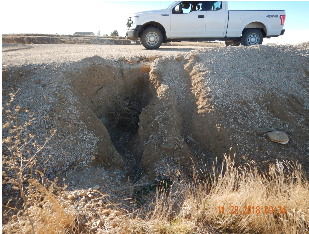
Photo 6. Photo taken from the northeastern location, facing South. Photo illustrate gully erosion off the the fill slope and is discharging off location. See comments under Photo 5.

Inspection Photos Location Name: ALICIA /PAD Location ID: 439515