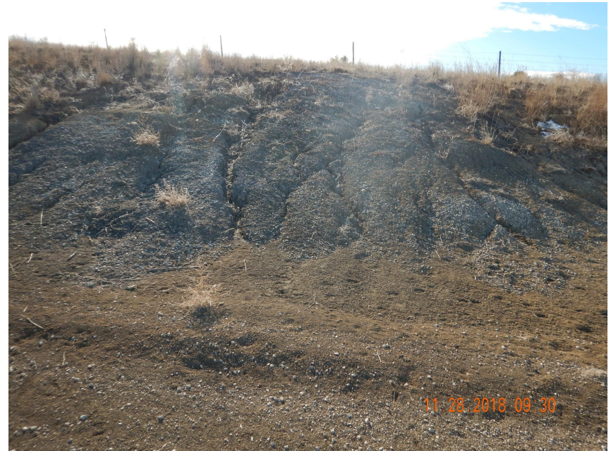
Photo 2. Photo taken from the southwestern cut slope, facing South. Photo illustrates an unstabilized cut slope with the evidence of rill erosion. The entire southern cut slope has not been properly stabilized. This location is not in compliance with Rule 1002 standards.