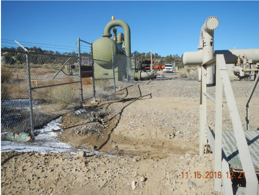
Damp area extends across adjacent facility.