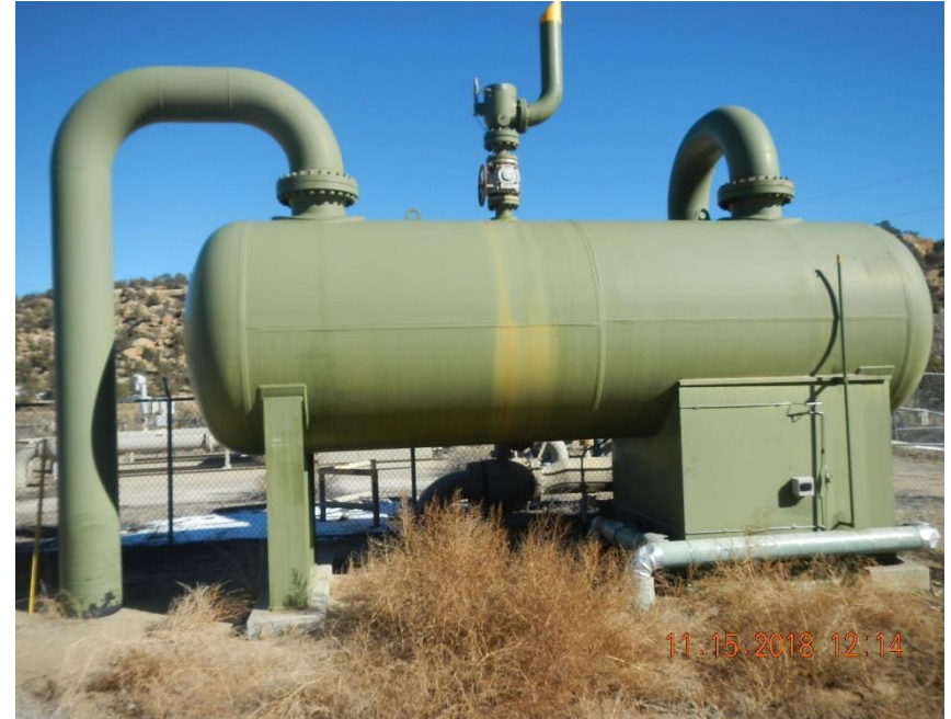
Slug catcher at Spill/Release Point ID #459062