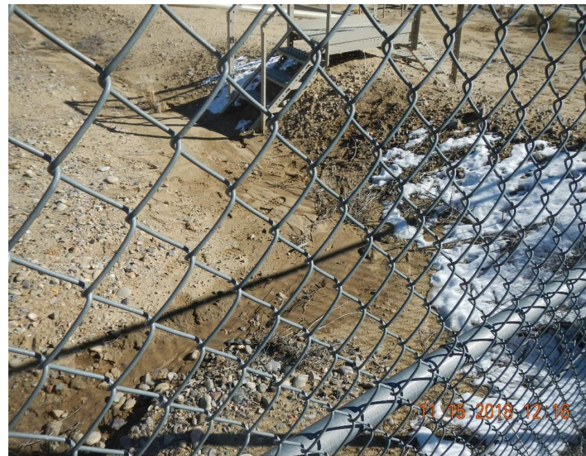
Evidence of flow onto adjacent facility.