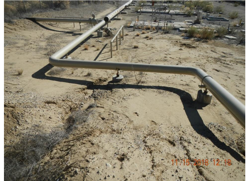
Flow path observed on adjacent Hilcorp facility.