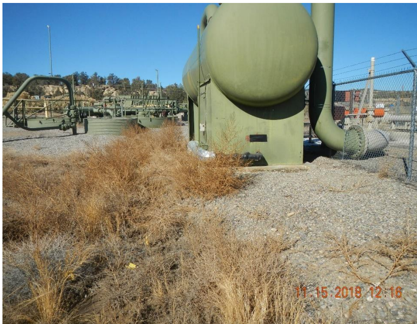
Flow path from slug catcher through weeds.