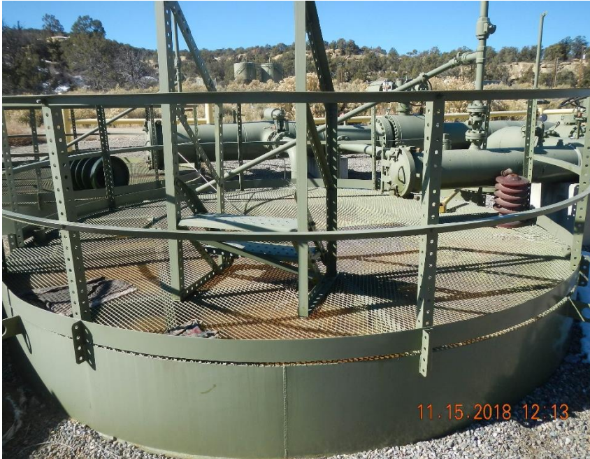
PBVs at pig station.