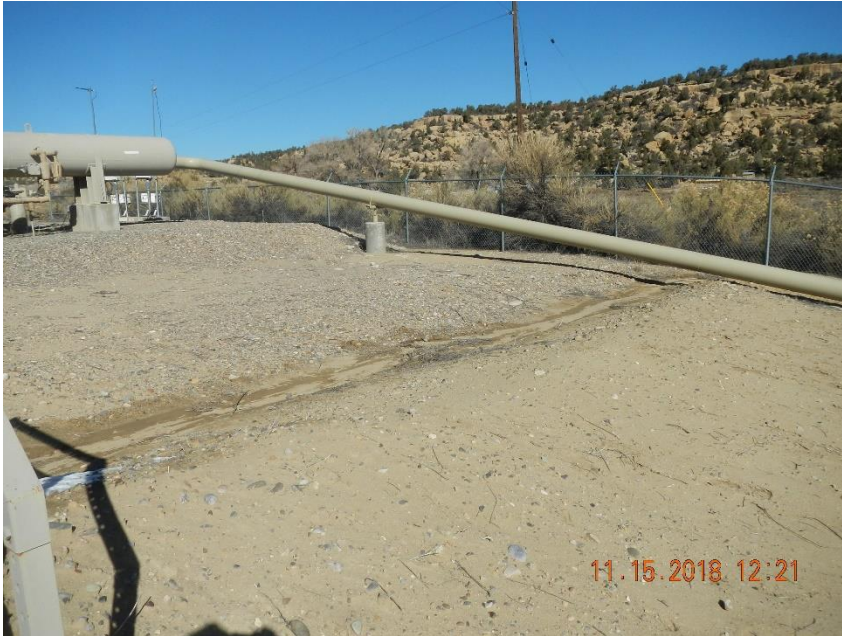
Produced water flow path extends across adjacent facility.