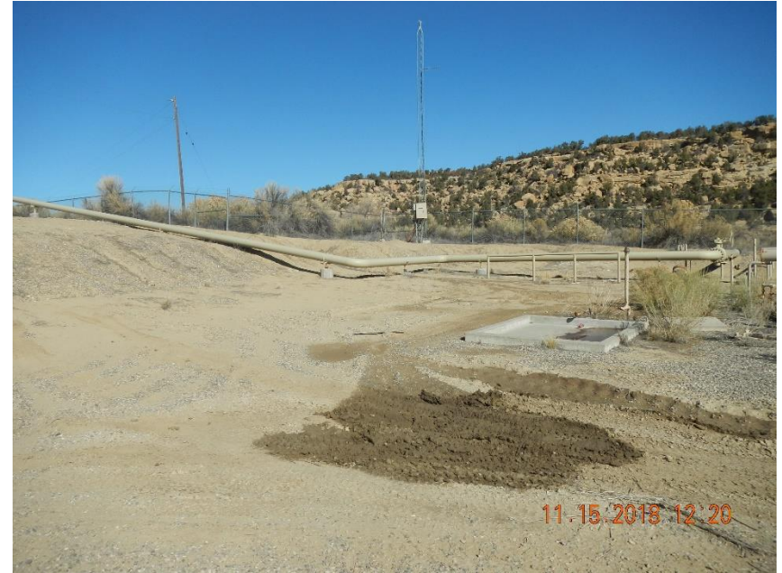
Apparent extent of release on adjacent Hilcorp facility.