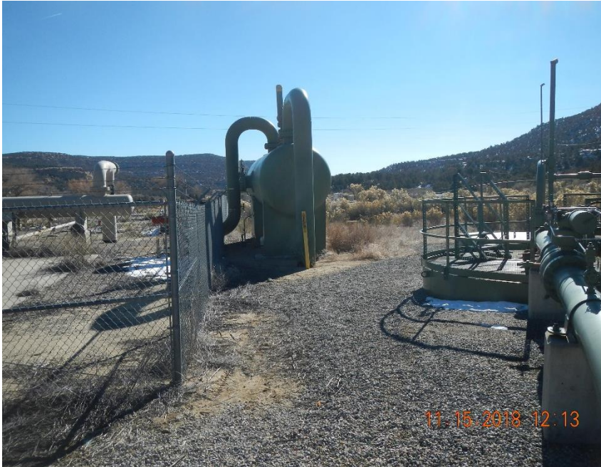
Location of Spill/Release Point ID #459062.