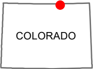
FIGURE 1 SITE LOCATION MAP CRITTER CREEK 9-15H SESE SEC 15-T11N-R63W WELD COUNTY, COLORADO HIGHPOINT RESOURCES