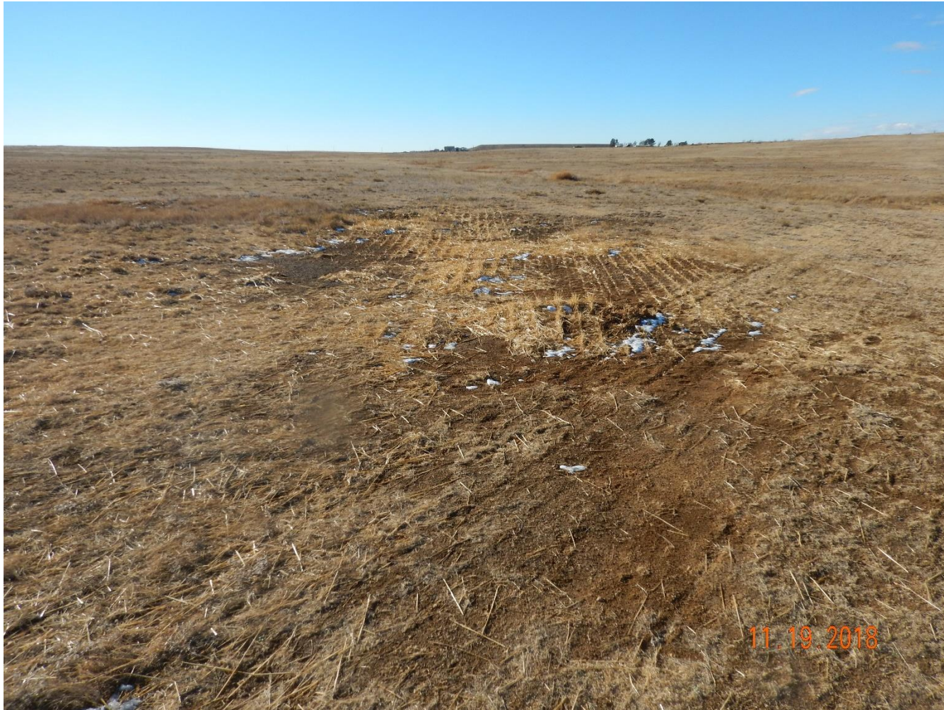
Photo 2: Photo taken from the location, facing west. Photo shows risers have been removed and additional reclamation activities appear to have been conducted.