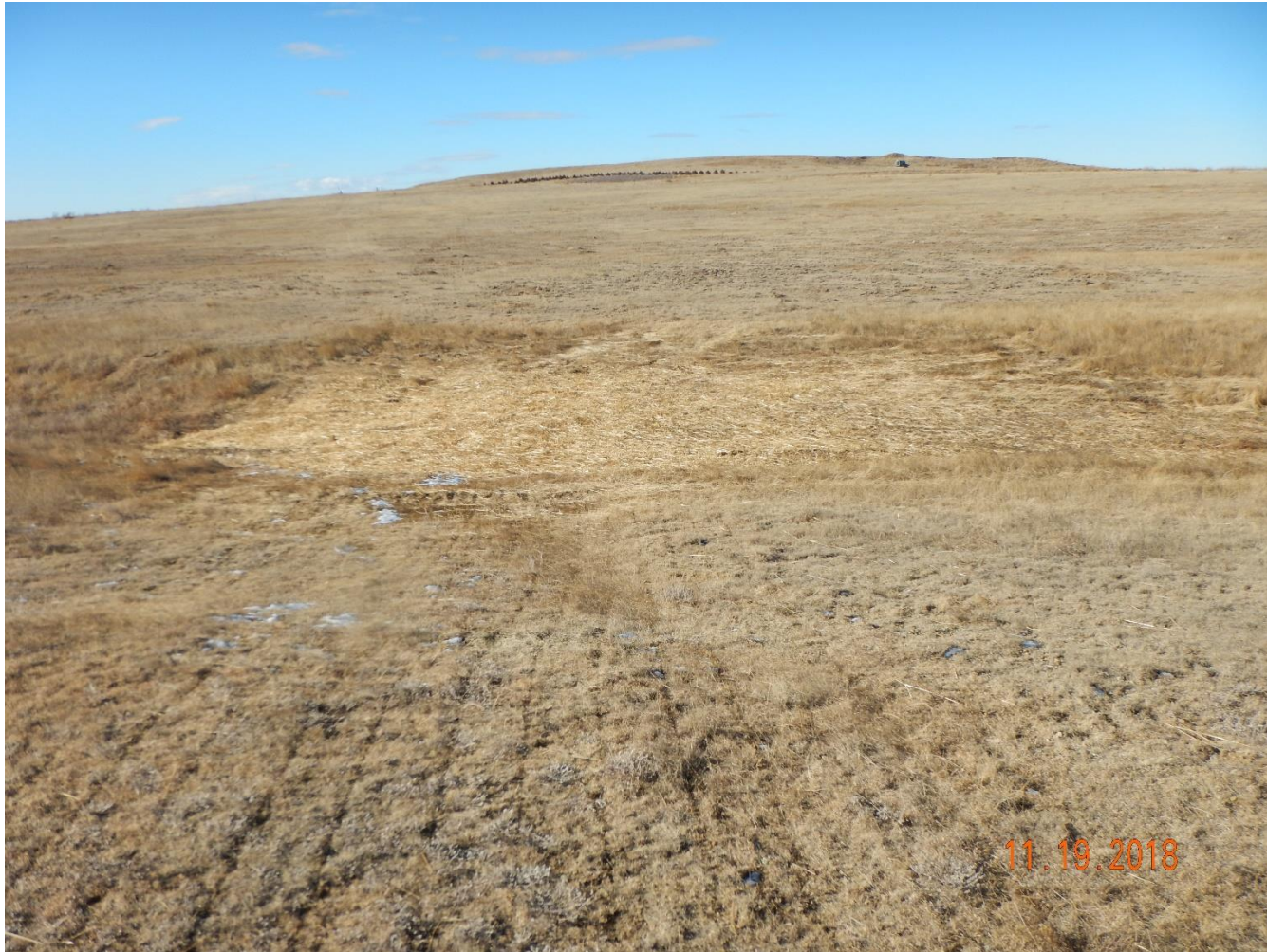
Photo 3: Photo taken from the location, facing north. Photo shows risers have been removed and additional reclamation activities appear to have been conducted.