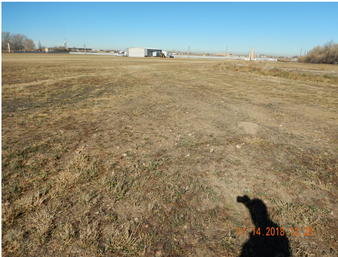
Photo 3. Photo taken from the well location, facing North. See comments under Photo 2.