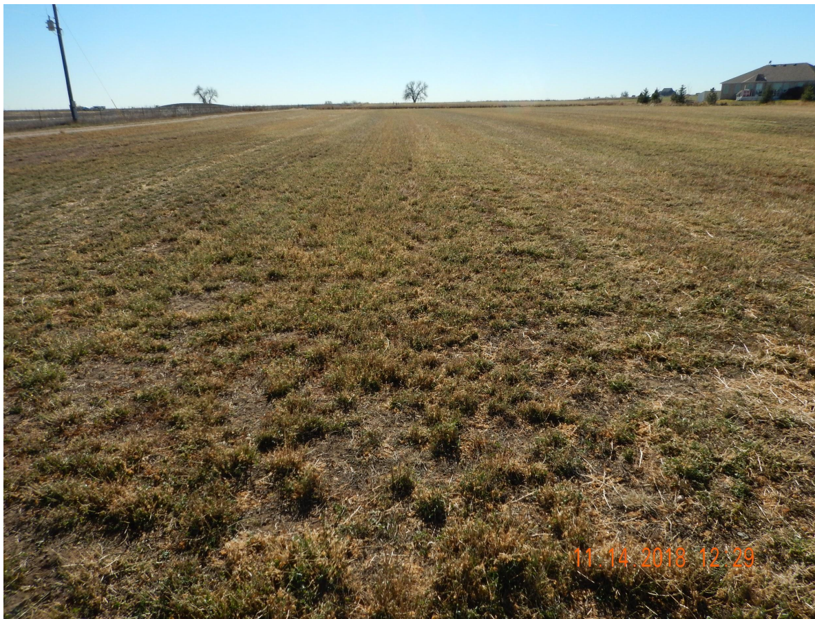
Photo 5. Reference photo taken south of the well location, facing South. Photo illustrates that the well location is not reflective of reference area vegetative levels.