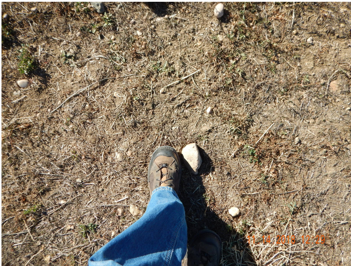
Photo 4. Photo taken from the well location. Photo illustrates the presence of gravel which was not observed in reference areas.