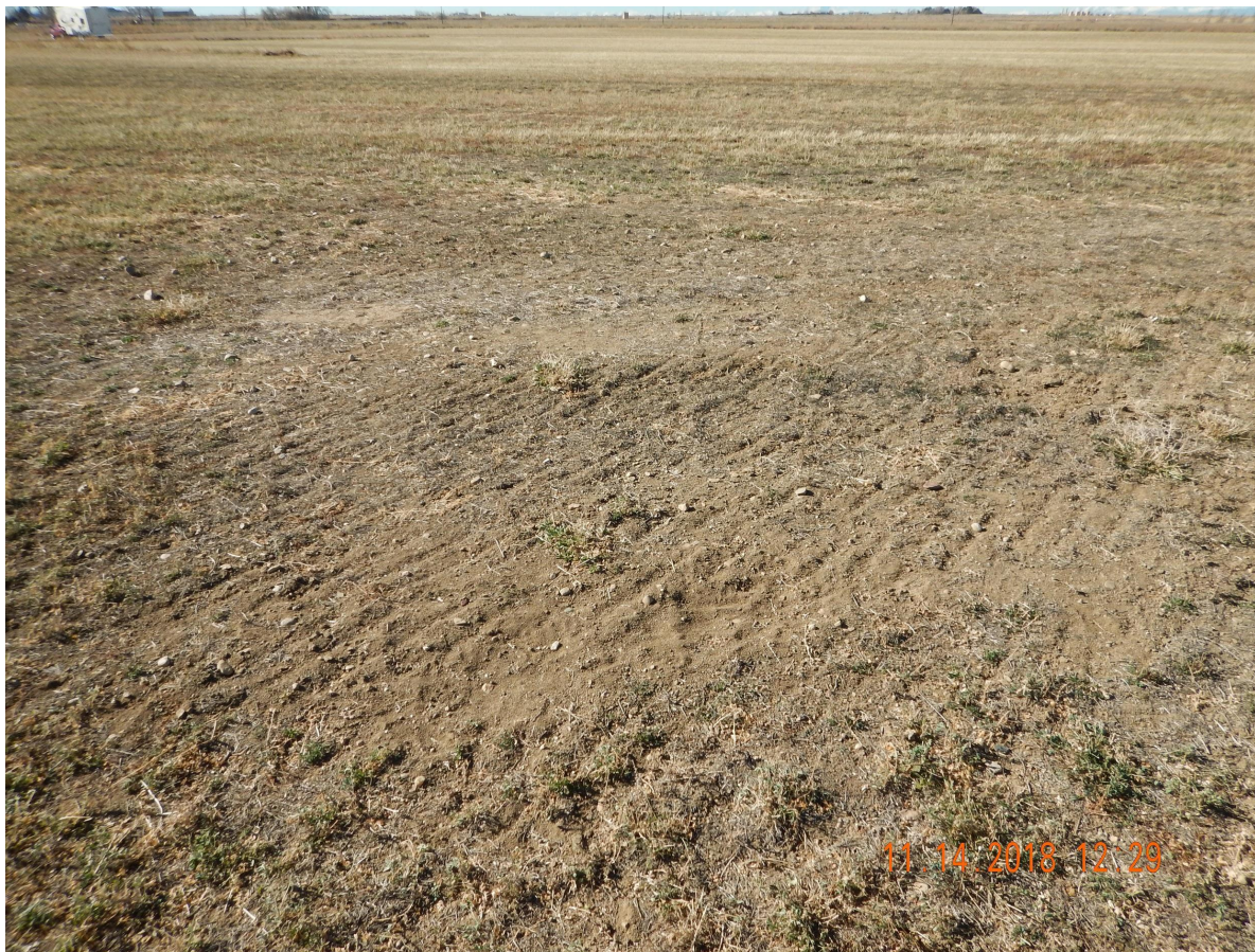
Photo 2. Close-up photo of the well location taken on 11/14/2018, facing West. Well location is not in compliance with Rule 1004 vegetative standards. Little to no establishment of reference area vegetation was observed and gravel did not appear to be properly removed.