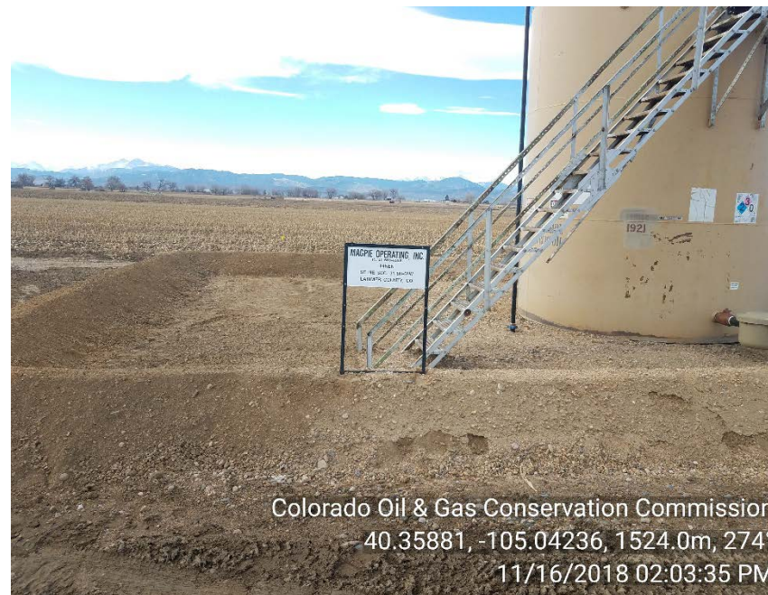
Tank berm on 11/16/18