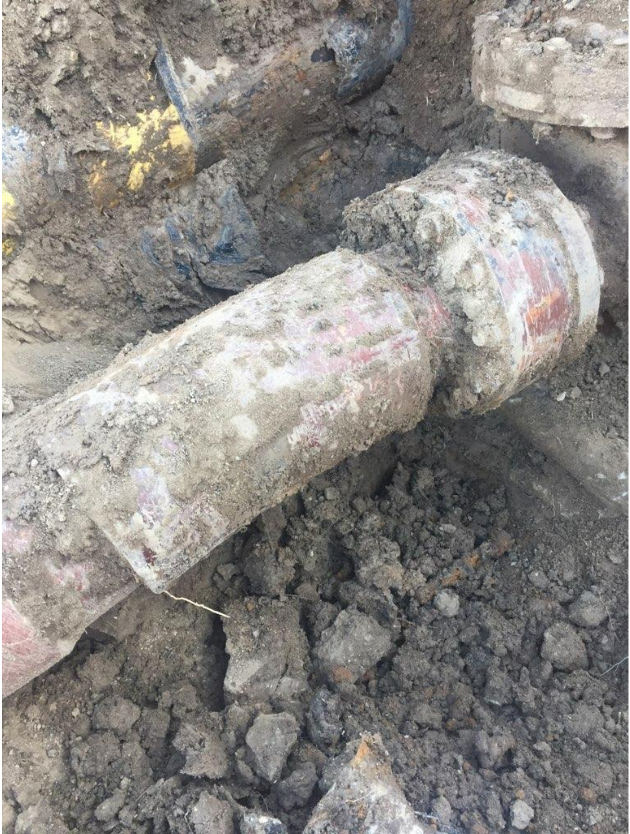
Photo of produced water transfer line fitting/ elbow (at valve can removed) taken by BP personnel.