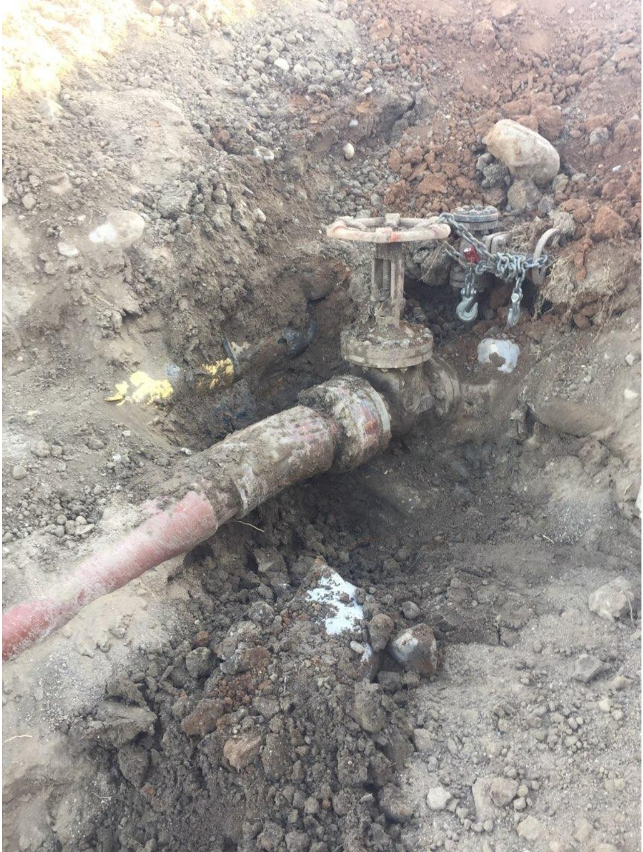
Photo of produced water line block valve and fittings (valve can removed) taken by BP personnel.