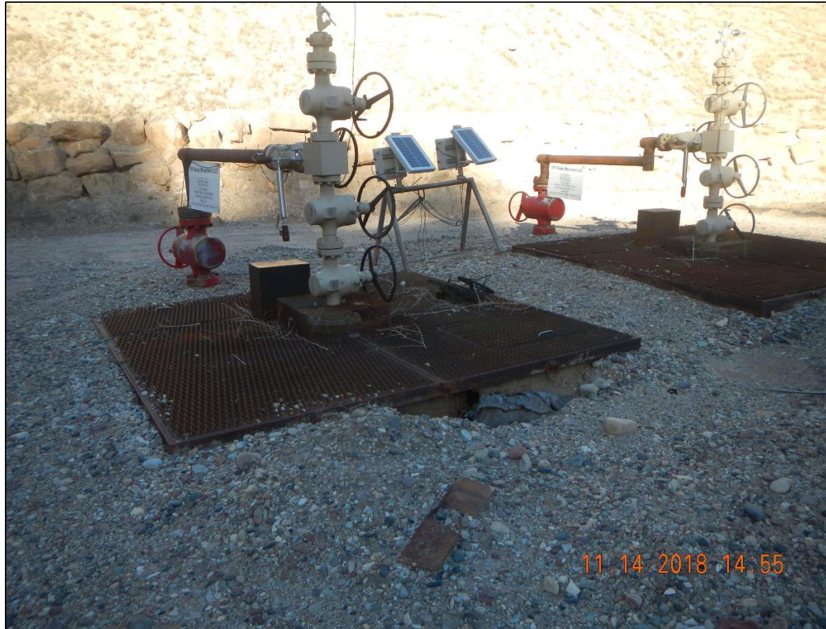
Junk and trash at well.