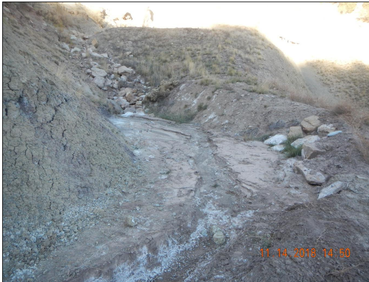
Sediment build up in ditch behind separators.

Federal MV-28-4 Api # 05-045-06787 Inspection # 689702070