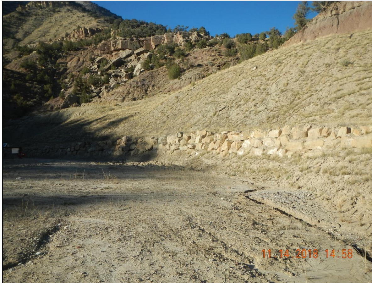
Washing and riling of sediment trap.

Federal MV-28-4 Api # 05-045-06787 Inspection # 689702070