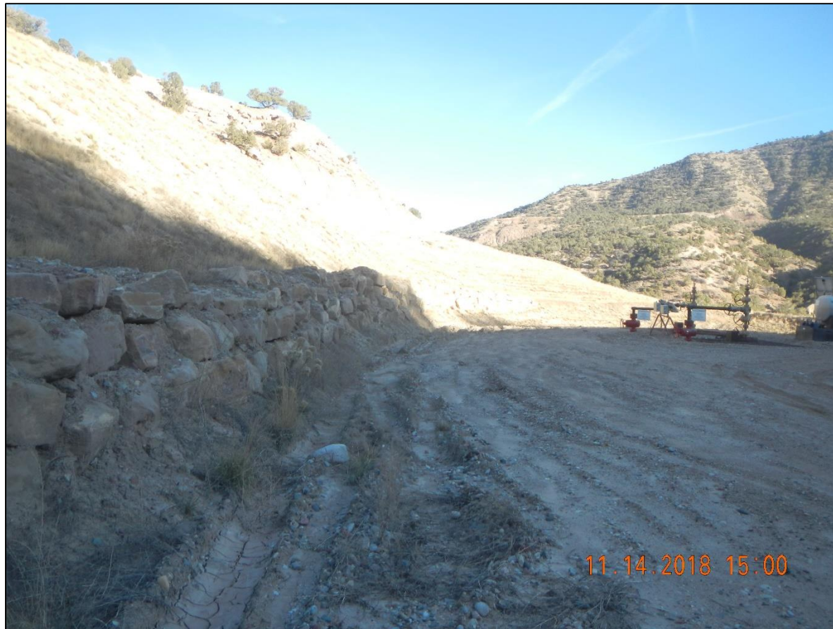
Ditch is rutted.