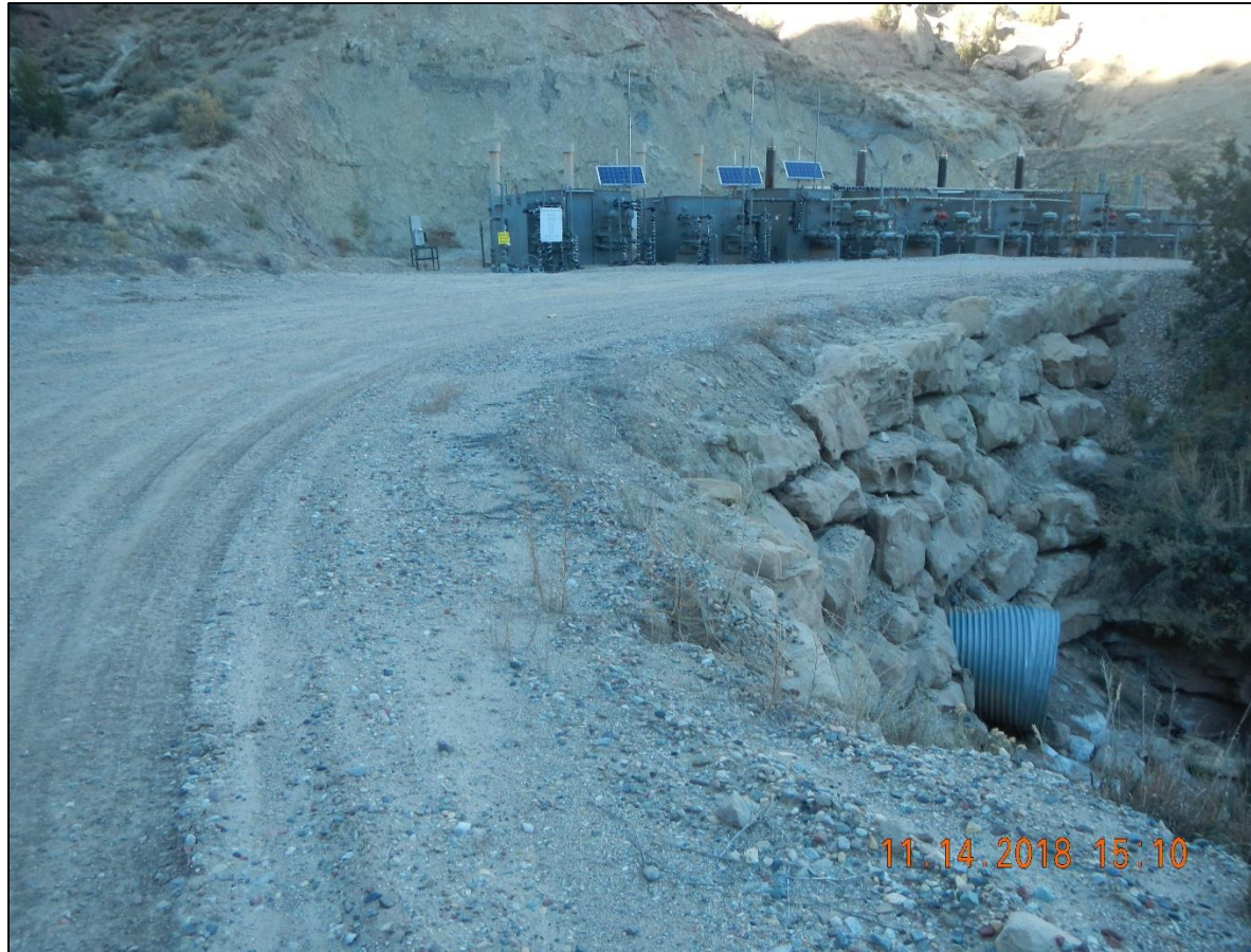
Washing and riling along shoulder above culvert.

Federal MV-28-4 Api # 05-045-06787 Inspection # 689702070