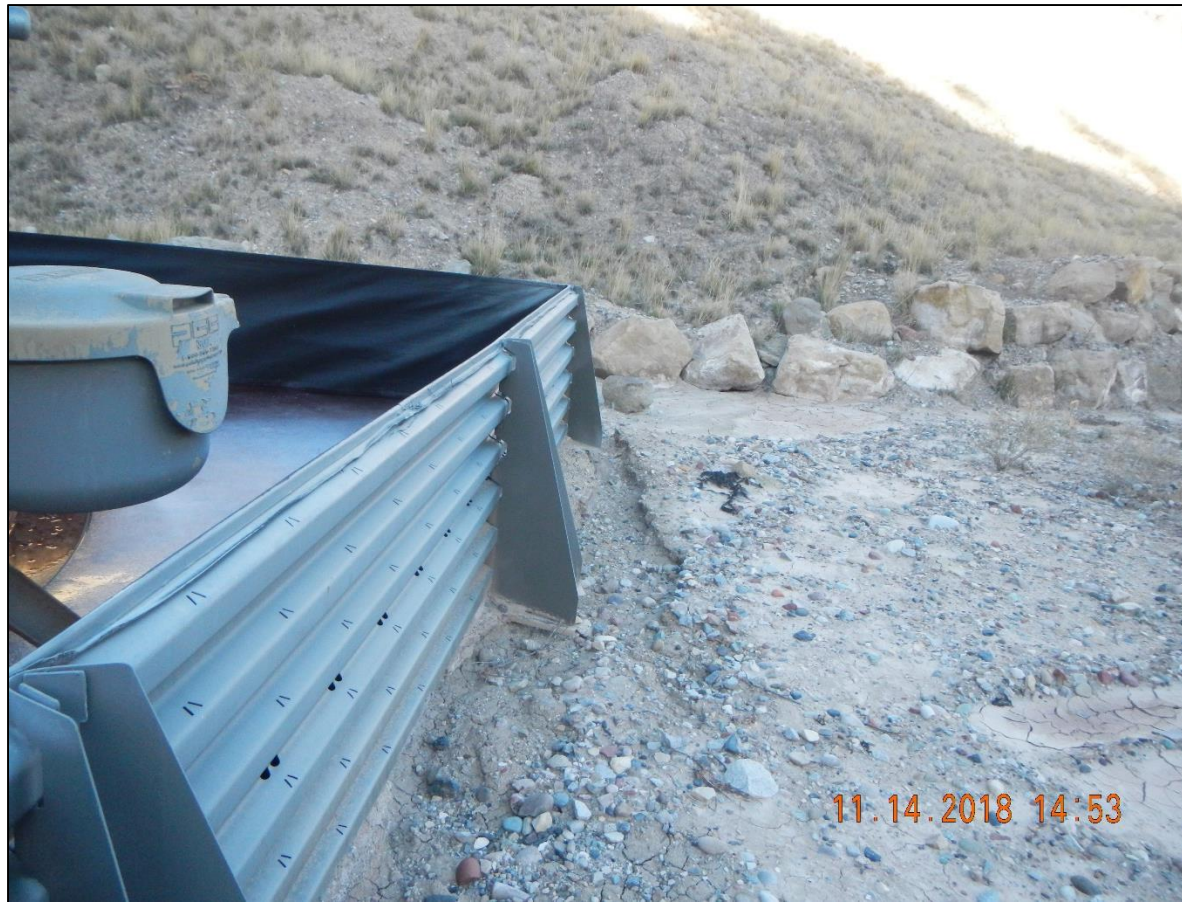
Washing around tank berm.

Federal MV-28-4 Api # 05-045-06787 Inspection # 689702070