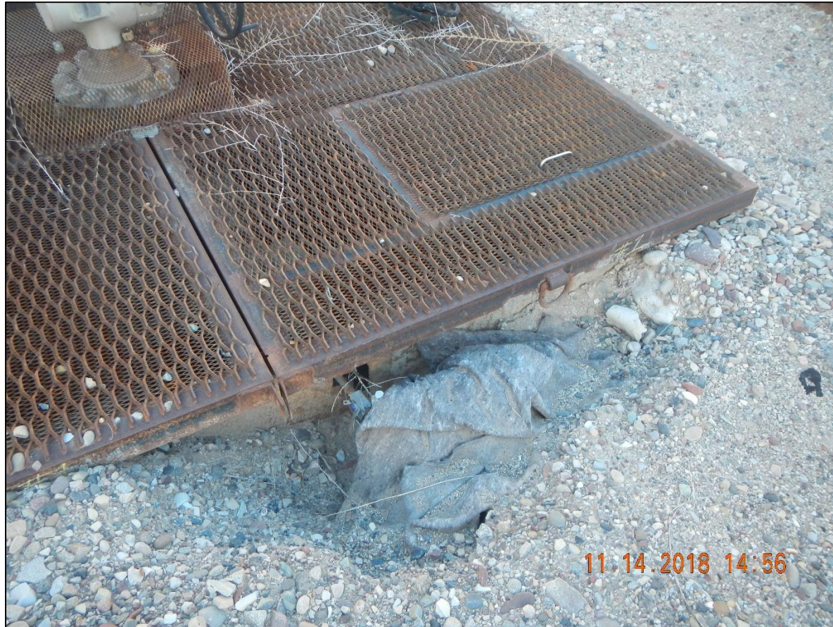
Absorbent spill pads inside of hole next to the cellar of well GM 706-4-HN2.