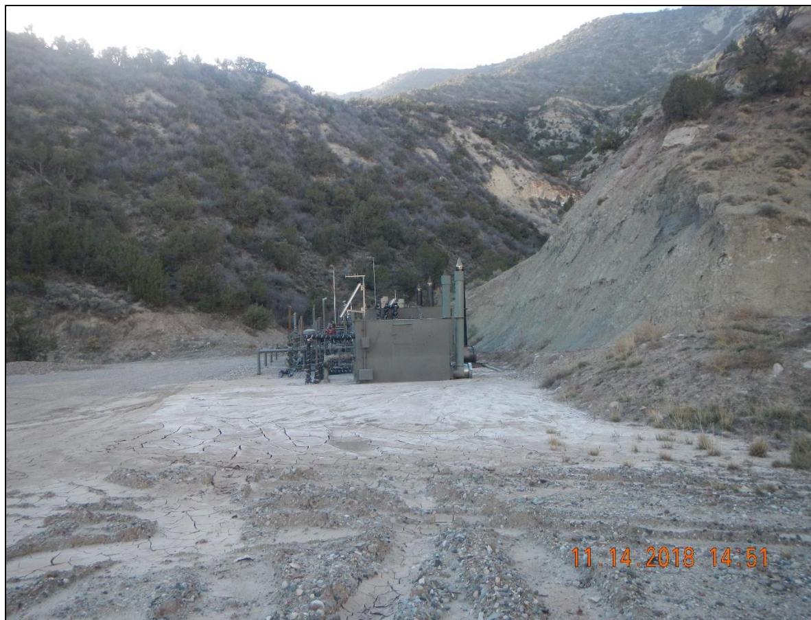
Movement of sediment and collecting at separators.

Federal MV-28-4 Api # 05-045-06787 Inspection # 689702070