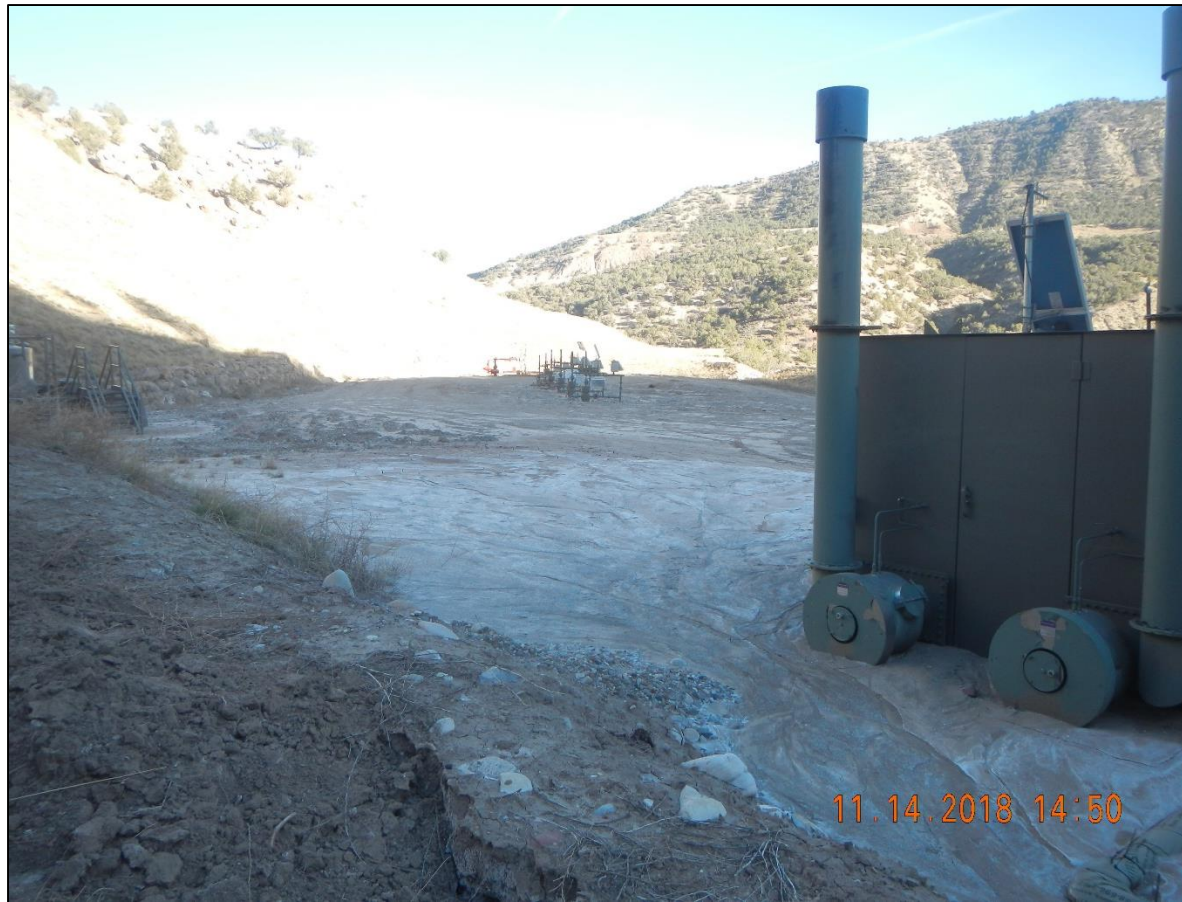
Movement of sediment and collecting at separators.