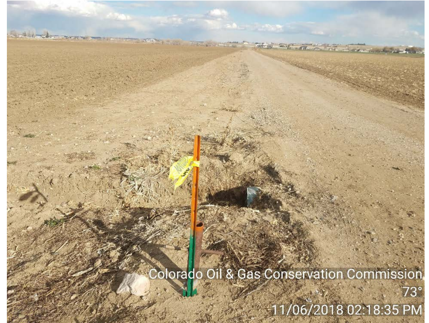
NE deadman on 10/31/18