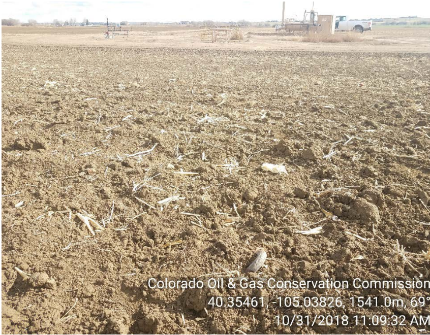
SW deadman on 10/31/18