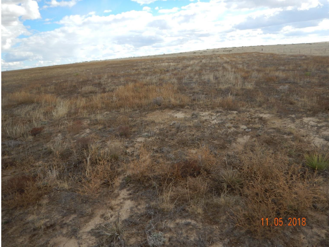
Photo 2: Photo taken from the northwest corner of the location, facing esouth. Photo shows overview of the reclamation area.