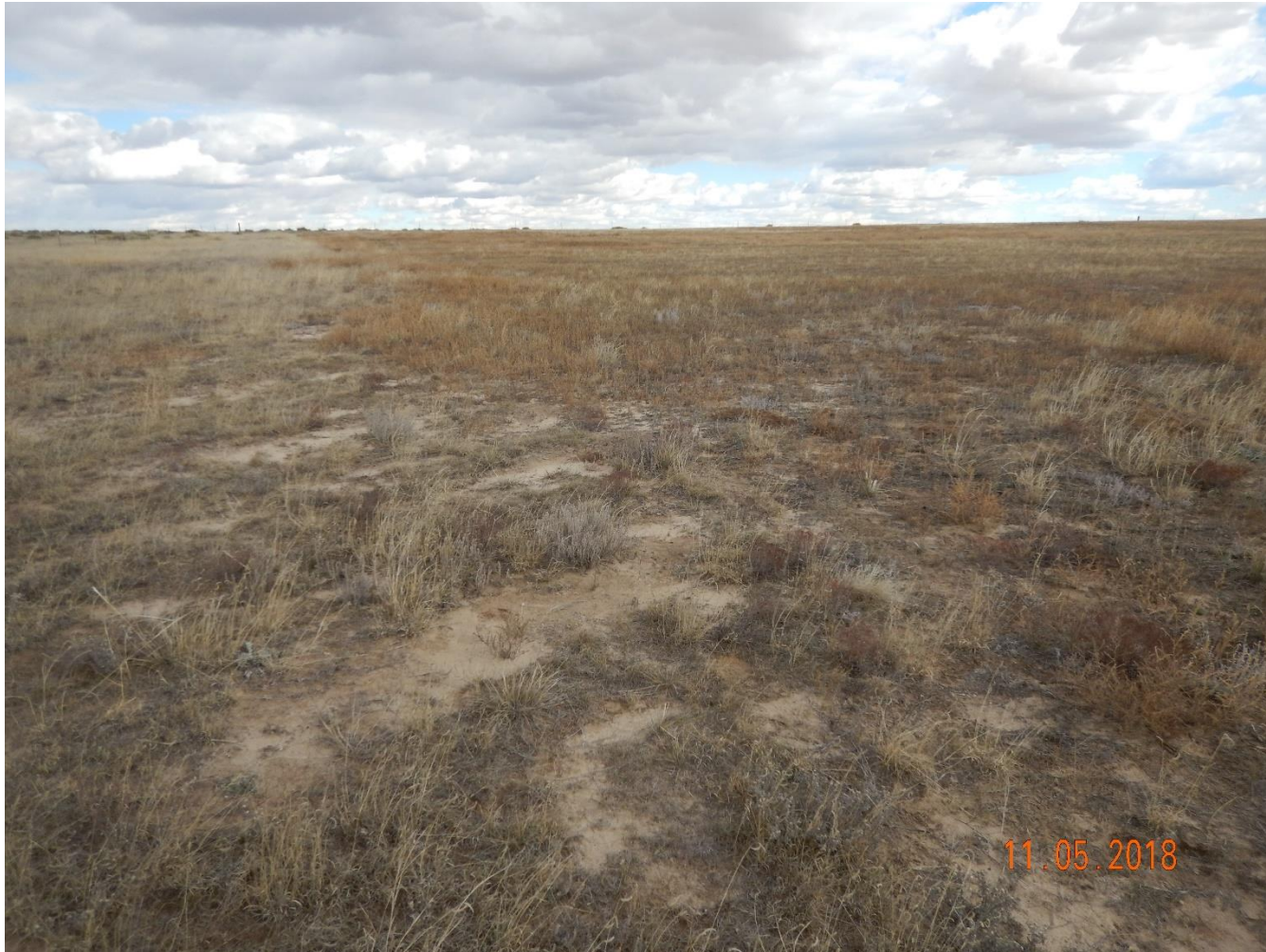
Photo 1: Photo taken from the northwest corner of the location, facing east. Photo shows overview of the reclamation area.