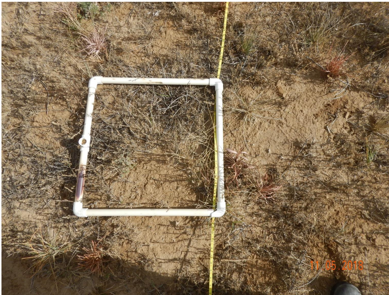
Photo 4: Photo taken from the 50 th point of the transect. Photo shows vegetation over the reclamation area.