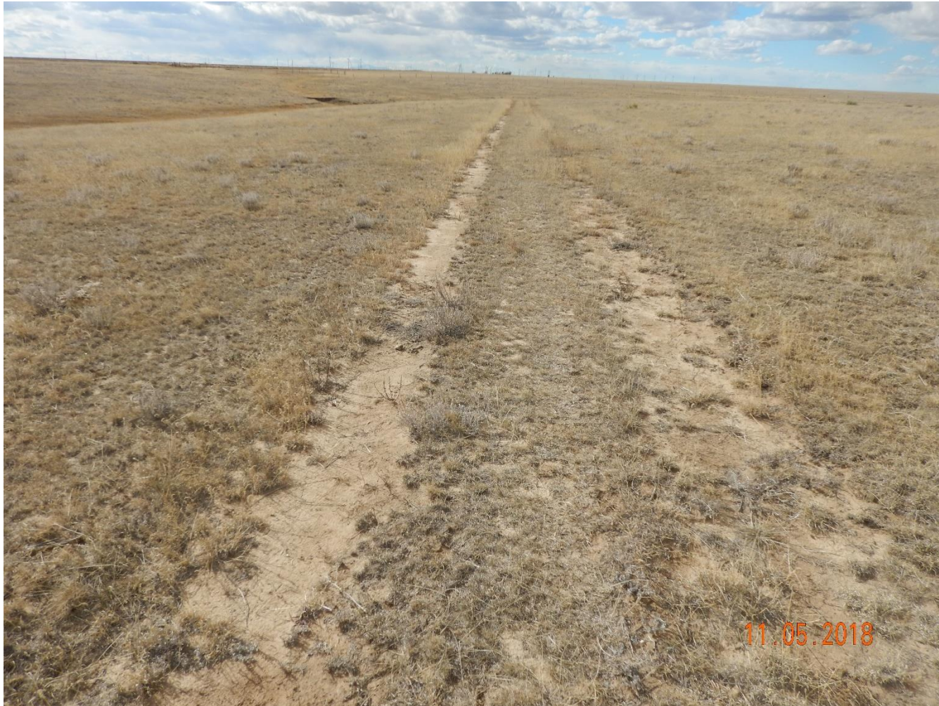
Photo 6: Photo taken from the southeast corner of the location, facing north. Photo shows reclamation activities appear to have been conducted on areas no longer reasonable needed for production activities.