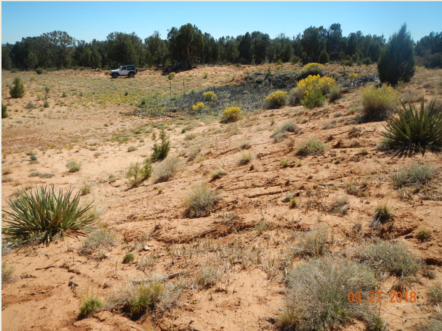
Photo 3. View of the western cut-slope still in place. Sparse vegetation and rilling up to 12 inches deep occurring on the cut-slope.