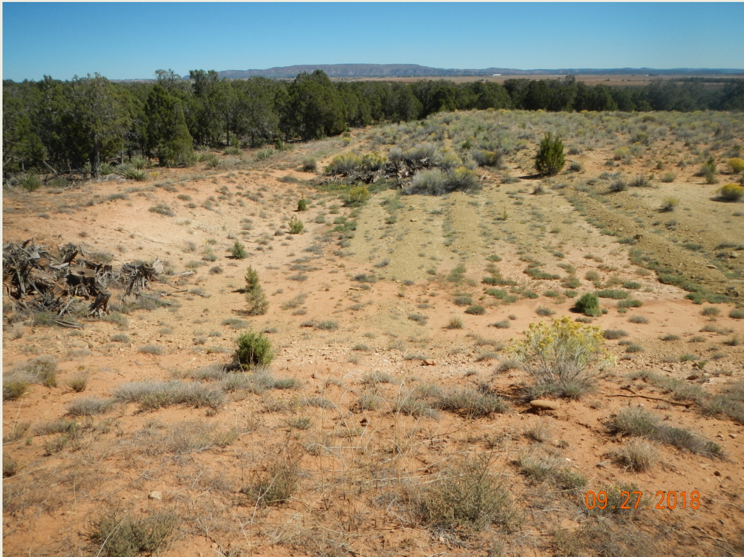
Photo 6. View of bermed area and soil placed in rows in the northern project area.