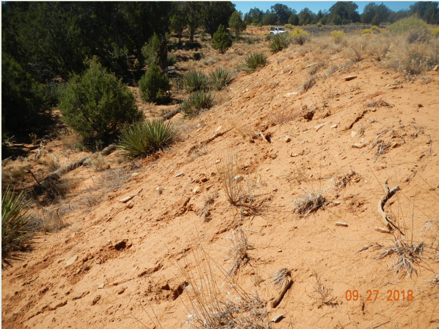
Photo 11. View of the southern project area from the southeastern corner facing eastward. Sparse vegetation, rilling and sediment deposition observed here.