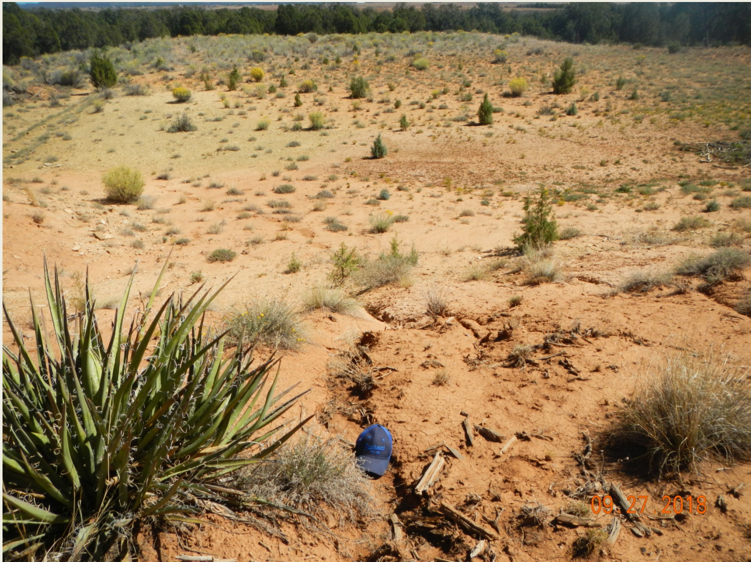
Photo 5. Another view of erosional channels forming on the well pad cut-slope. This is in the northwestern cut-slope.