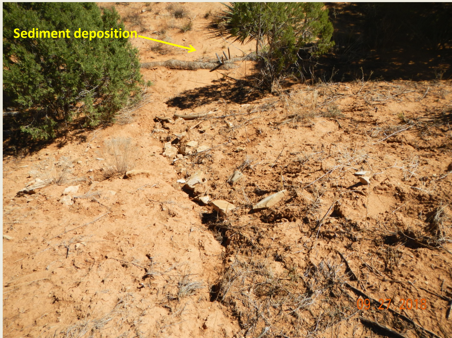
Photo 10. View of rilling up to 10 inches deep in the southeastern project area. Sediment deposition is observed downstream from the wattles.