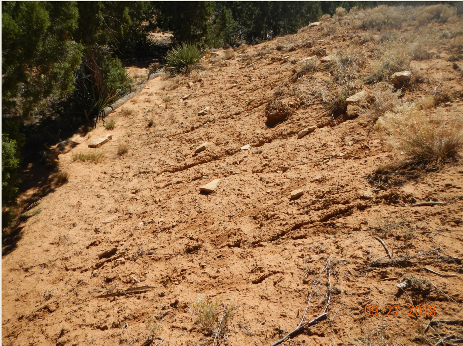
Photo 9. View of the southeastern fill slope (east facing) from the eastern edge facing southward. Vegetation is sparse, rilling is occurring, and wattles are full of sediment.