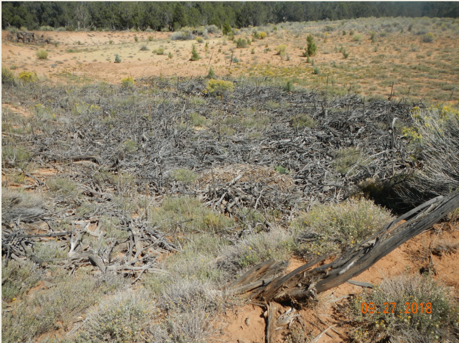
Photo 1. View of wood debris in the southwestern project area, still in place.