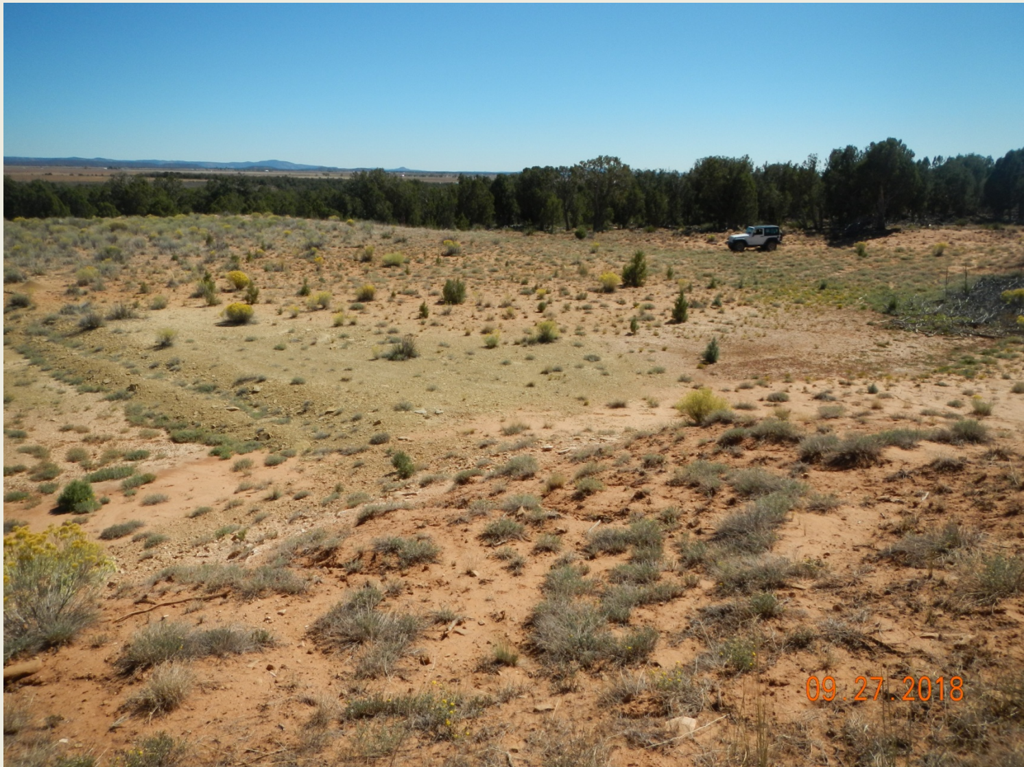
Photo 7. View of the project area from the northwestern corner facing center.