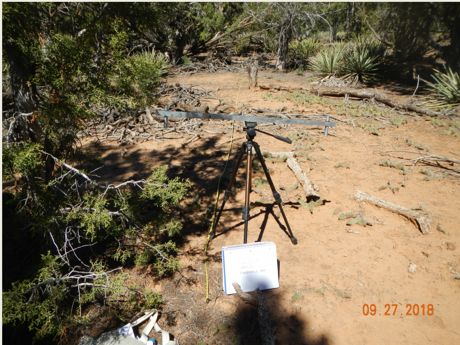
Photo 13. View the beginning of Transect 2, within the reference area facing northward.