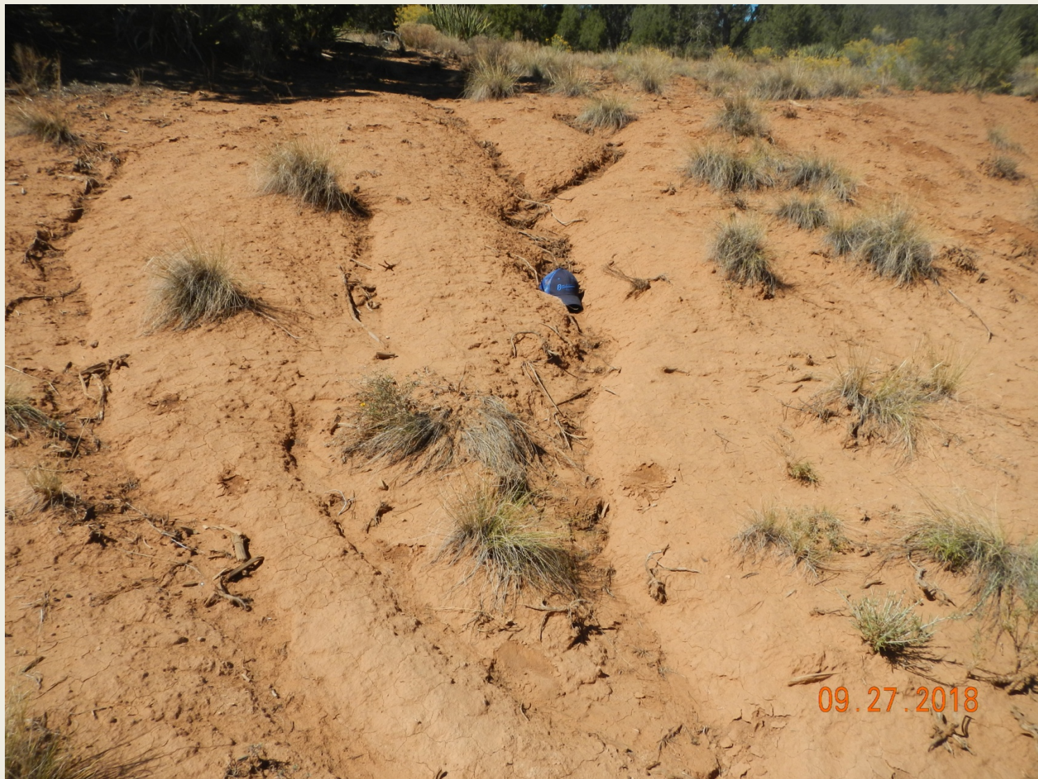
Photo 4. View of rilling approximately 12 inches wide and deep in the southwestern cut-slope.