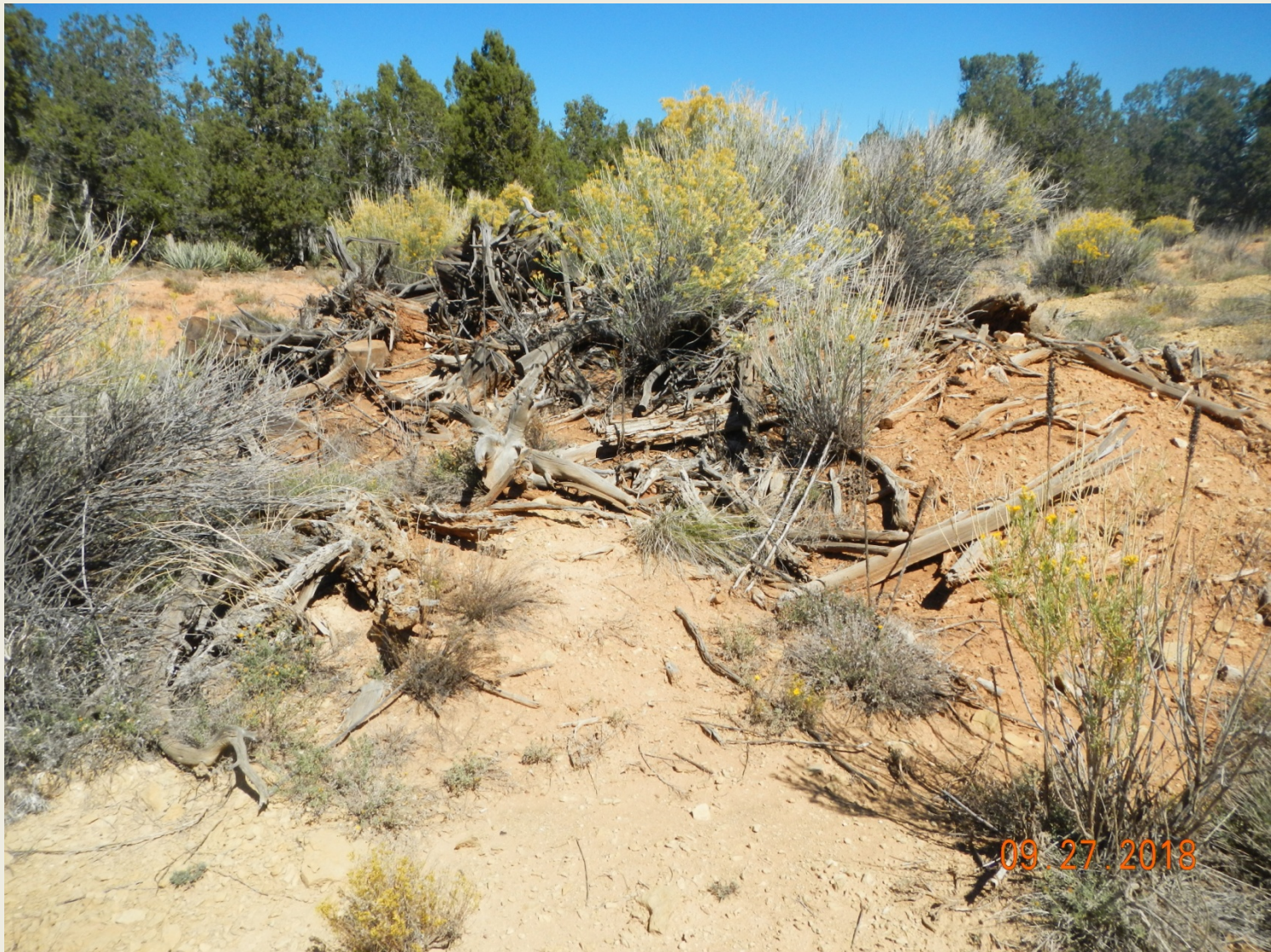
Photo 8. View of more wood debris in the northern project area.