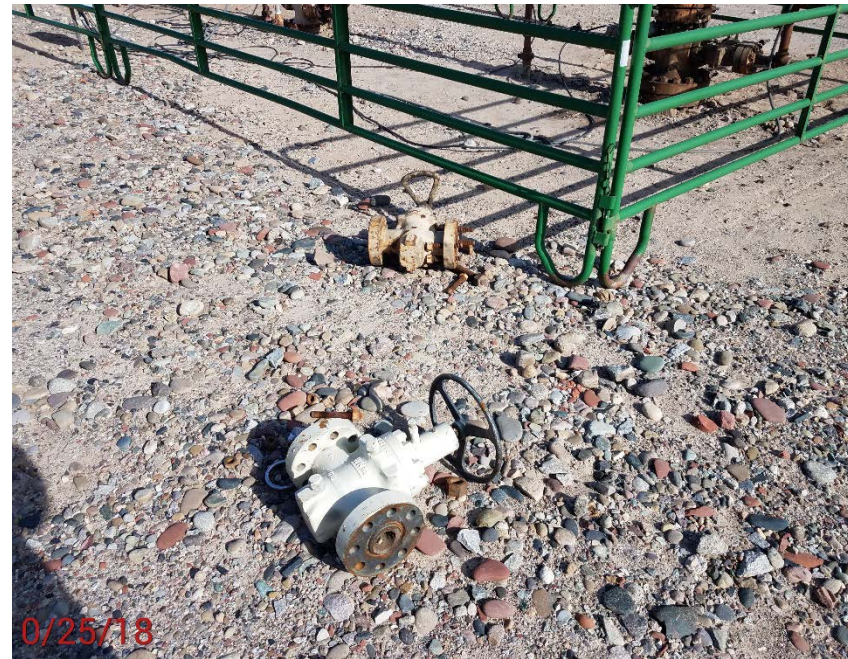
Location Photo #4, 2 Master valves near wellheads.