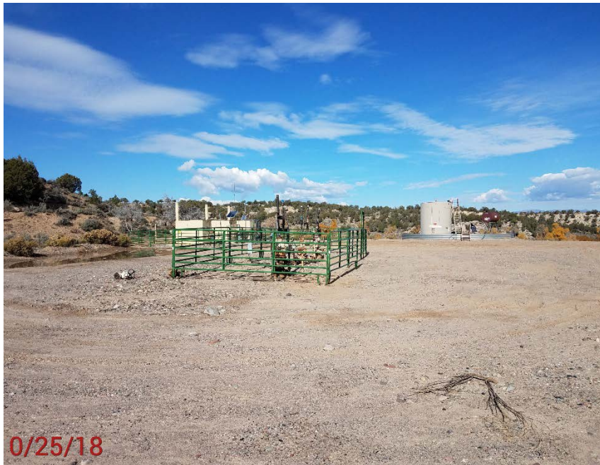
Location Photo #1