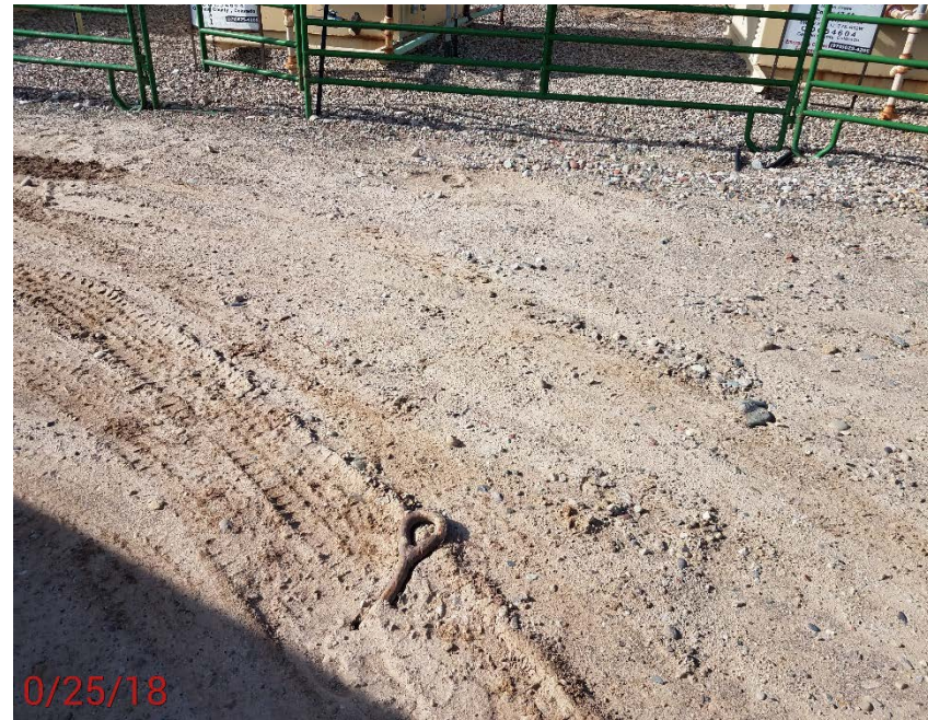
Location Photo #2, unmarked anchor near separator