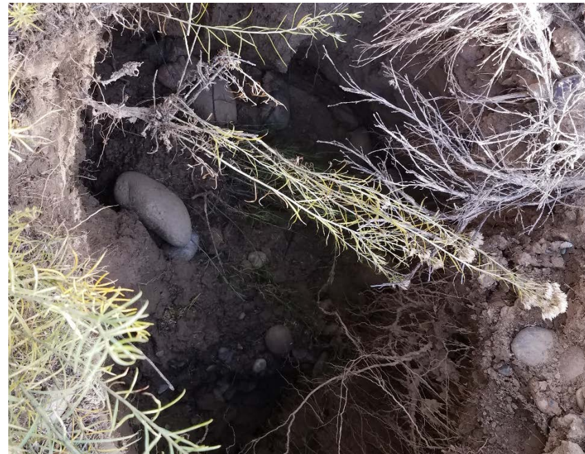
Location Photo #5, poly line on East side of location in rabbit brush