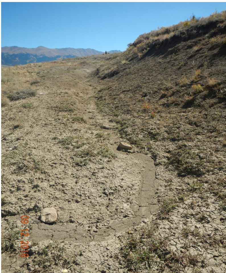
Photo#10: Views along access road, showing erosional issues and areas devoid of vegetation..