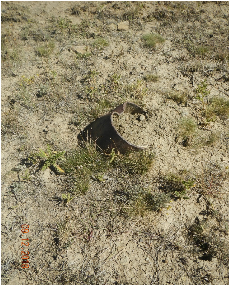
Photo#4: One piece of casing (pipe) is daylighting on the NE section of Location.