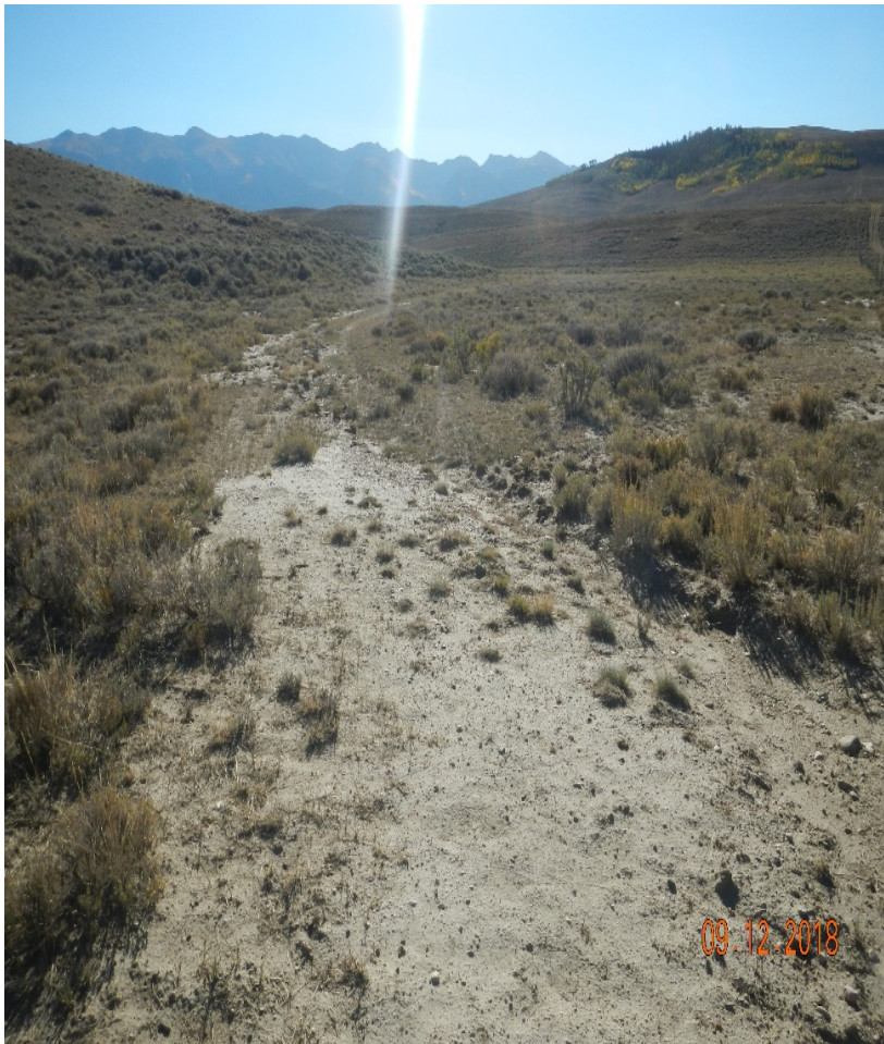
Photo#8: Views Southeast along access road, from diversion point area at State boundary, leading up into location.