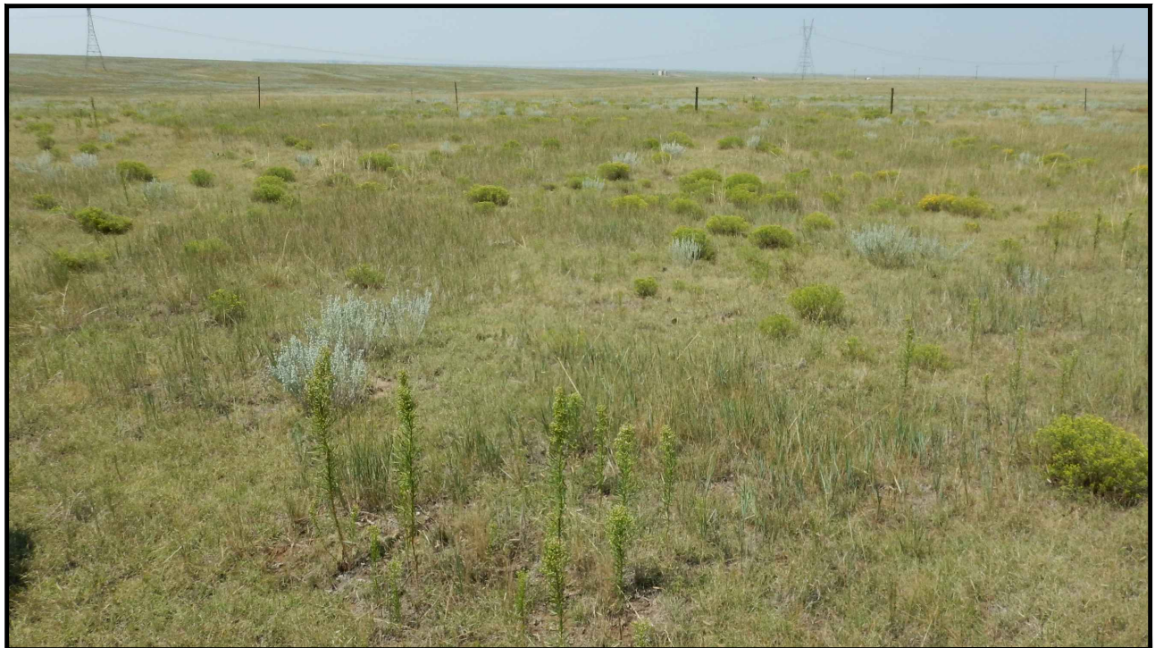
PHOTO: VIEW OF REFERENCE AREA