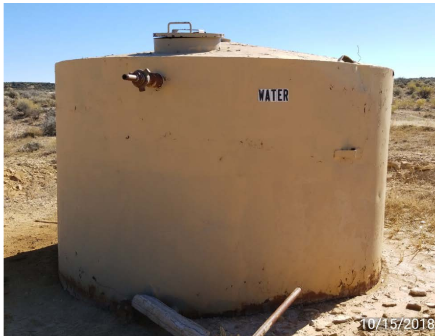
Tank currently not in use with no placards or capacity labels.