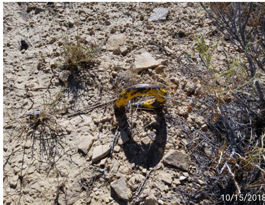
Deadman anchor without marker