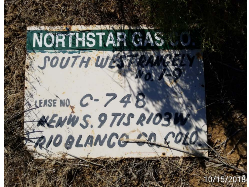
Well head sign lying on ground, missing "Nearest Public Rd CR 2", and no emergency phone number.